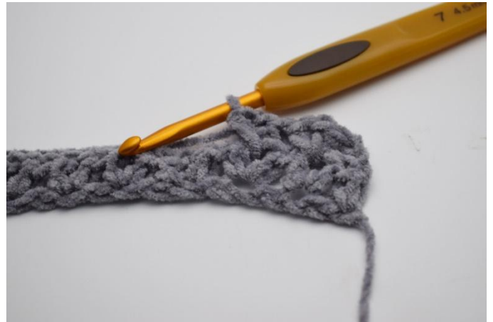
10. Repeat "hdc 1, ch 1, hdc 1" in the next ch space.