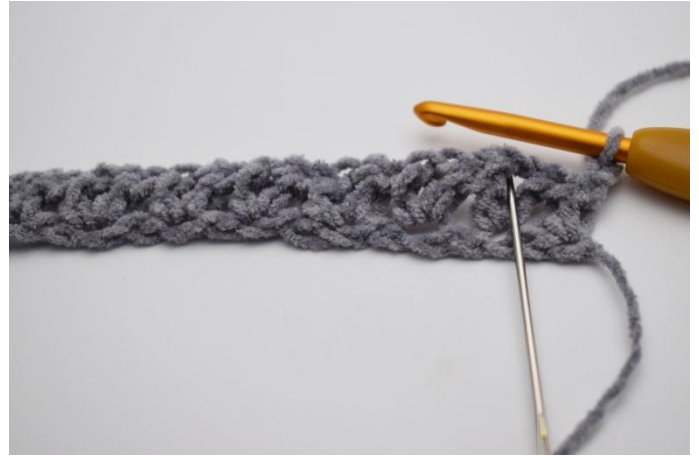
8. Ch 2 and turn your work. Now "hdc 1, ch 1, hdc 1" in all the ch spaces of the row below.