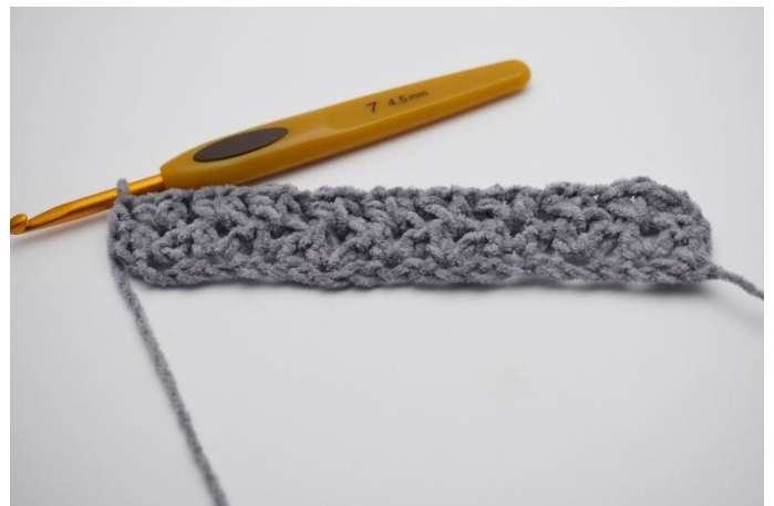
12. Repeat this row until your blanket reaches the desired size or to a total of 112 rows.