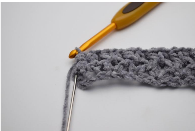
11. Repeat the remainder of the row. Hdc 1 in the last stitch.