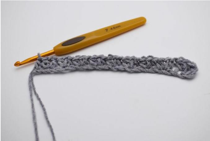
7. You're now done with row 1.