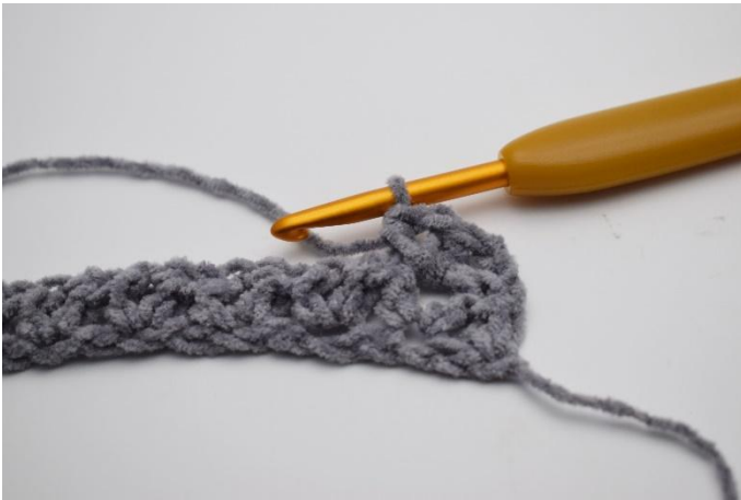
9. "Hdc 1, ch 1, hdc 1" in the first ch space.