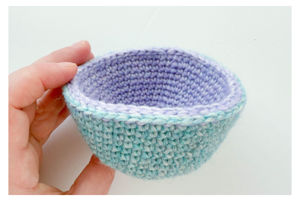
32. Bottom part of the egg