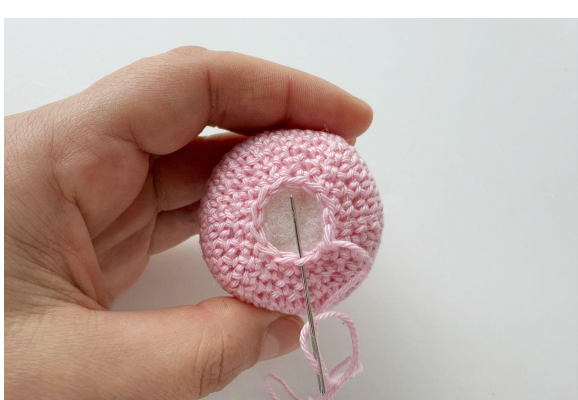
4. Insert the needle in each front loop of last round