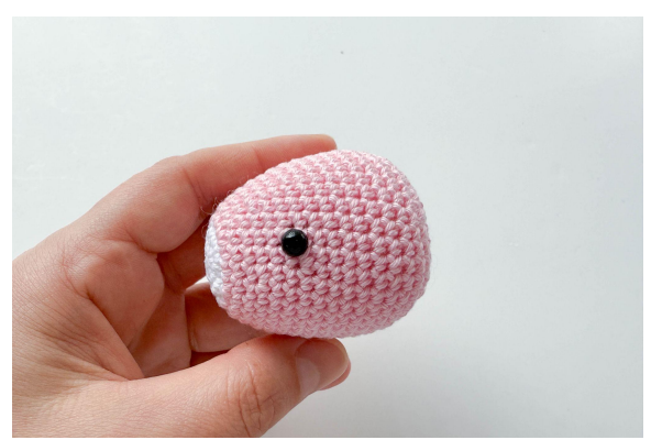
6. Finished head