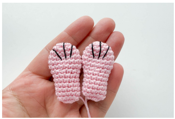
10. Legs, make 3 black lines