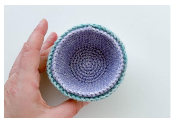
29. Place the inner part inside