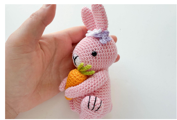
24. Finished bunny