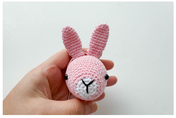
13. Place the ears on the top of the head