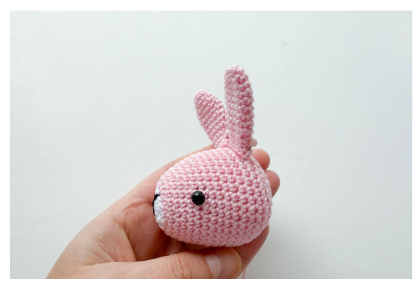
14. Sew them on round 17.