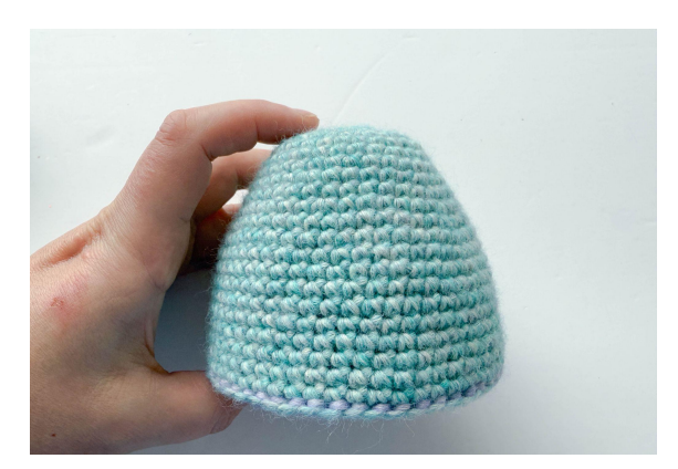
33. Top part of the egg