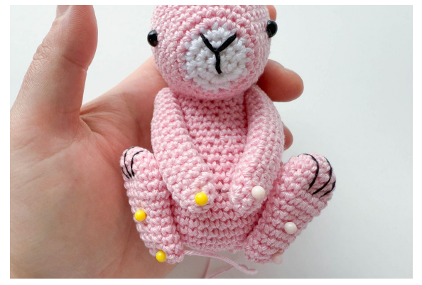
19. Place the legs in diagonal