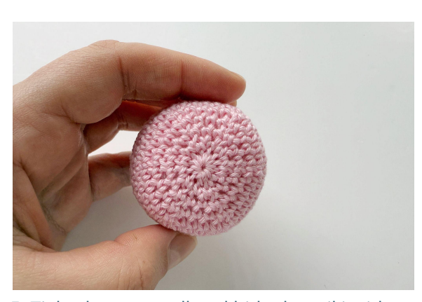
5. Tight the yarn well and hide the tail inside