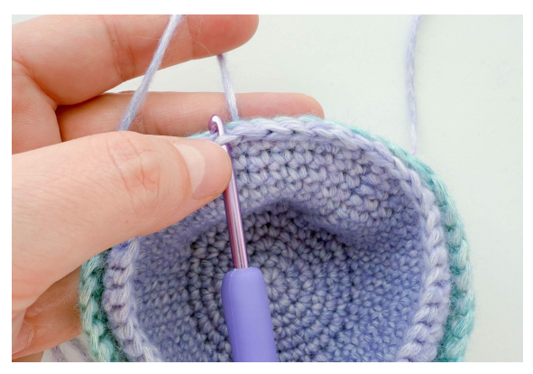
31. Make a slip stitch loosely