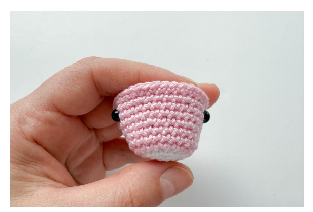
3. 14 sts between eyes