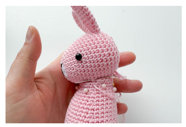
16. Sew the body to the head