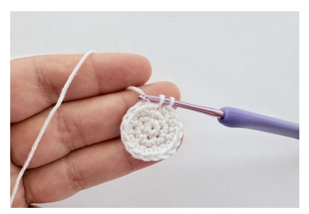
1. Two loops on the hook