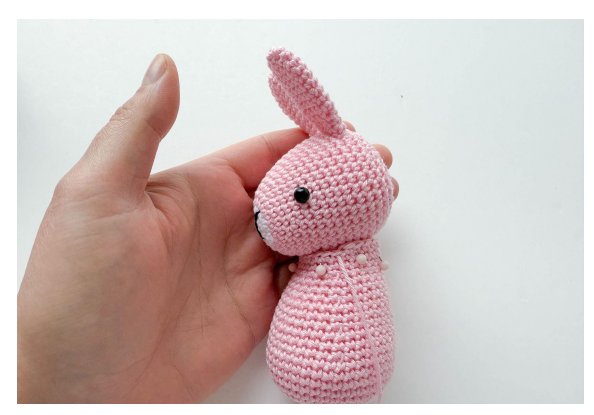
15. Place the rounded belly facing forward