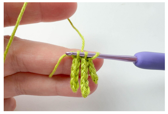
25. Insert your hook in the front loop of the 2nd and 1st piece.