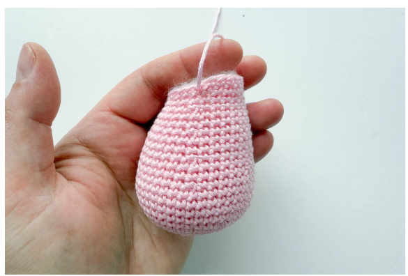
8. Body, leave a tail for sewing