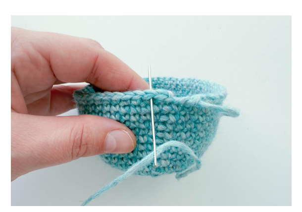
27. Insert the needle in second stitch