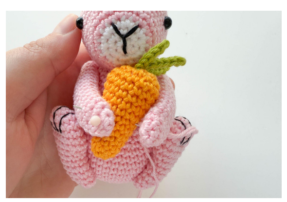
23. Sew the carrot to the arms