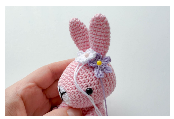
22. Place the flower in the top of the head