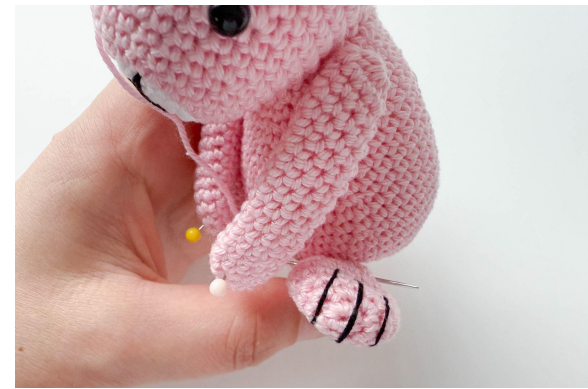
20. Secure the legs to the body in the middle