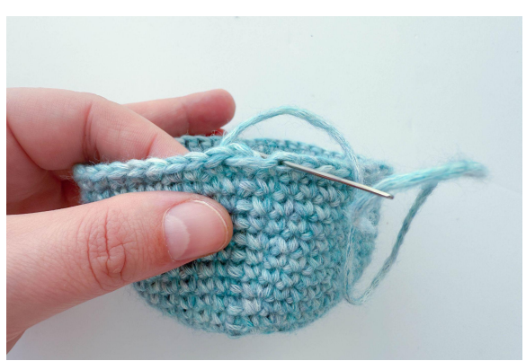
28. Then, insert the needle only in the back loop of last stitch