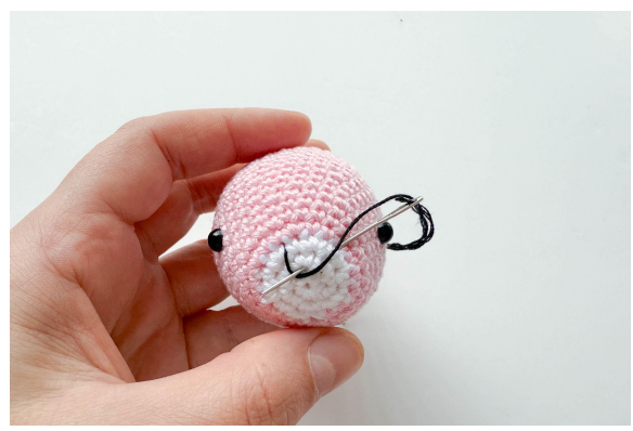
11. Insert your needle 2 rounds lower