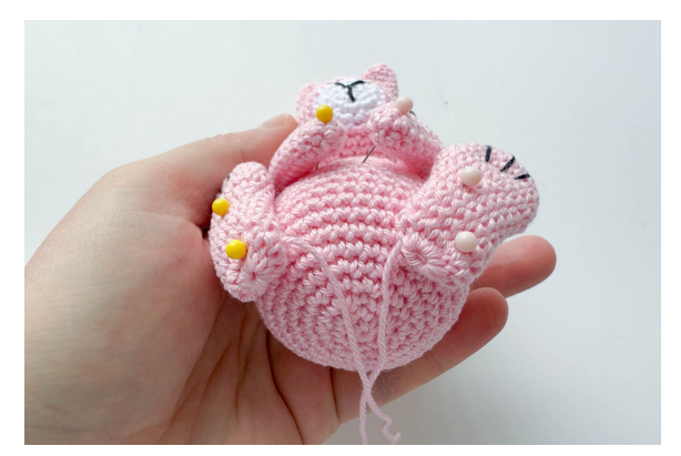
18. Position the heels on round 5 of the body