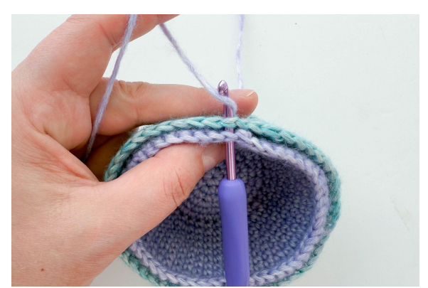
30. Pick up the yarn and pull it through