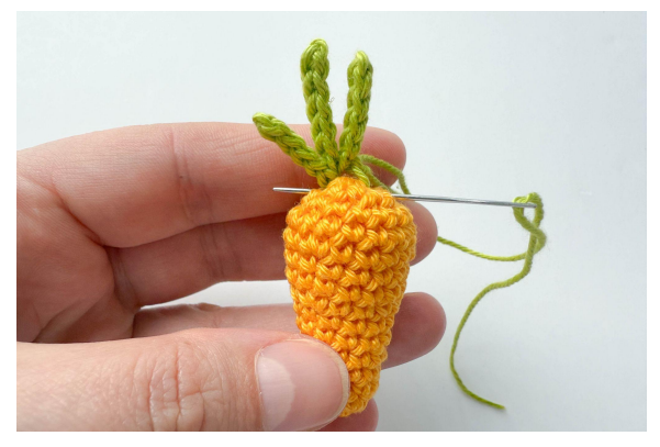
2. Sew the leaves on the top of the carrot