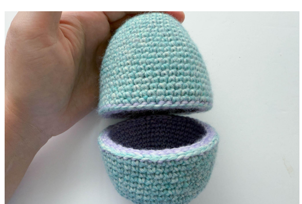
34. Two parts of the egg