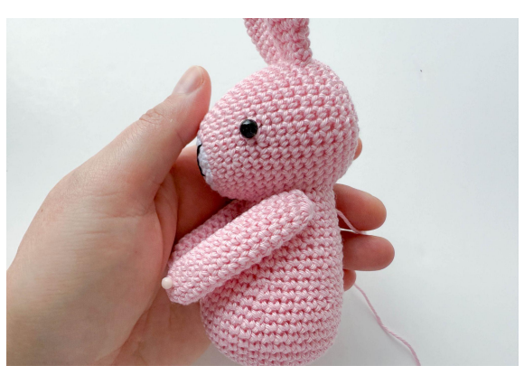
17. Sewing the arms