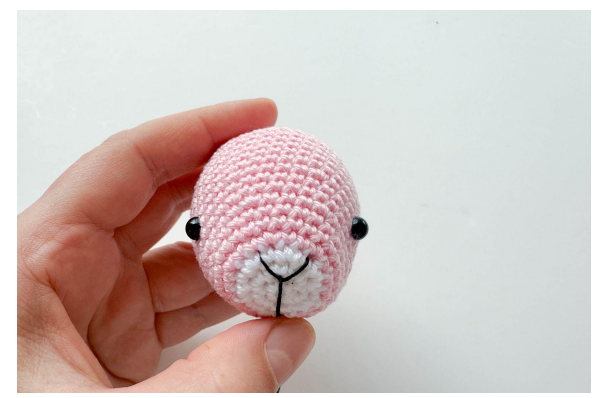
12. Embroider a "Y" shape of the nose