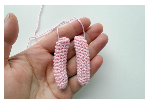
9. Arms, leave a tail for sewing