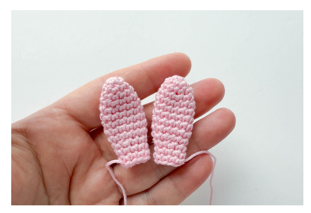
7. Ears, leave a tail for sewing