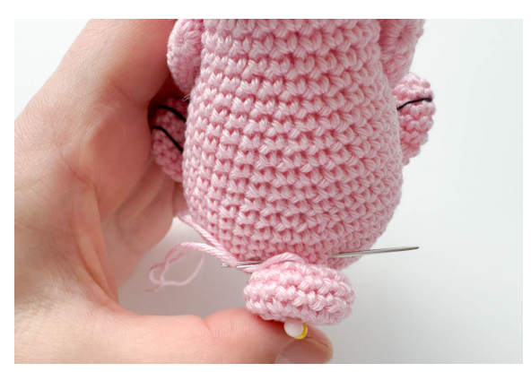
21. Sew the tail on the back of the body