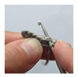
Turn and work in the free loops