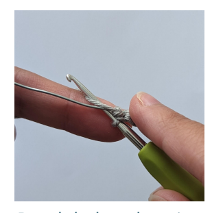
Reach below the wire

Typically, you start a crochet project by working in a magic ring or a chain. But you can also start by working over a wire or a strand. The principle is similar to working in a magic ring, but with the end and start extremities not connected. With a loop or a slip knot on your hook, insert your hook below the wire, yarn over, pull through, yarn over again over the wire, and pull through both loops on your hook. Then you proceed in the same way to work more single crochets.