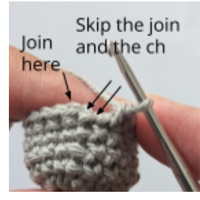
End of the round