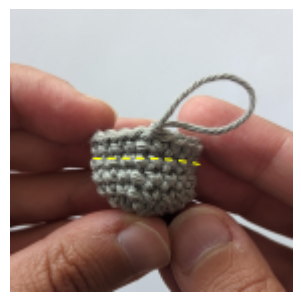
Rounds are parallel to the ground