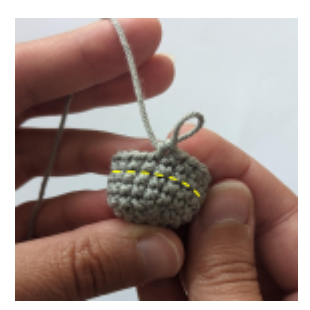
Work is slightly tilted