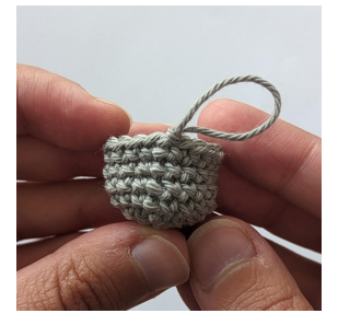
Work in joined rounds

When working in joined rounds, instead of proceeding in a spiral, you proceed by stacking concentric rounds, parallel to the ground. To achieve this effect, you raise the height of your work with a chain 1 at the beginning of each round, and you end each round with a slip stitch join in the first single crochet of the round. You can notice that each round stays at the same height compared to the ground, and the end of the round is almost seamless and not visible.