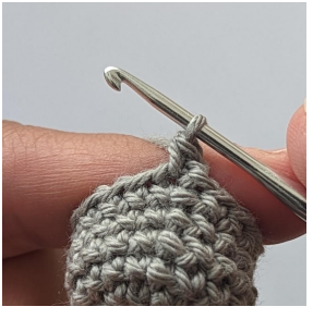
First sc of the round