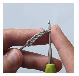
The slipknot is the first chain stitch