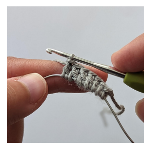
Double crochet over a wire

The same technique can be applied when working with any stitch. In this pattern, the scarf is worked by doing double crochets over the unworked color!