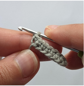
All back bumps have been worked in