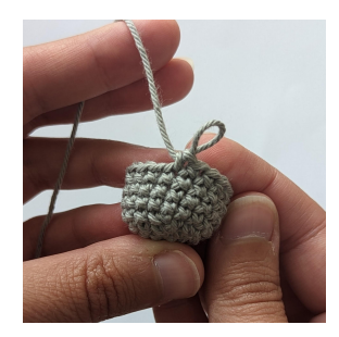
Work in spiral

When working in continuous rounds, you proceed by working each stitch directly in the next stitch available: the first stitch of a round must be worked in the first stitch of the previous round, the second in the second, and so on. The work proceeds in a spiral: you can notice that the rounds are slightly tilted, and the end of the round presents a visible step.