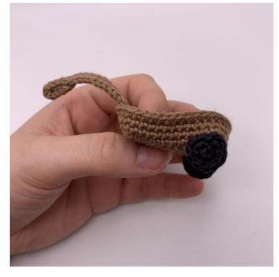
Weave in yarn ends.

Pin and sew the other end of the handle to the inside of the pull cart.