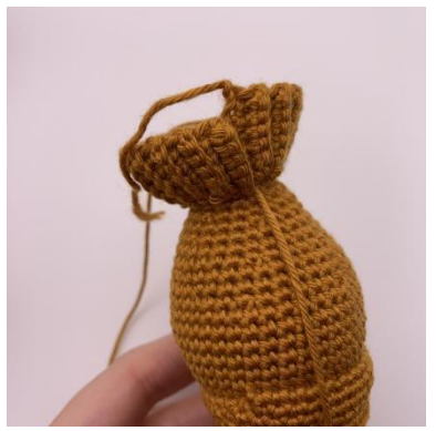
Sew the ends of the collar together and then roll the collar down.