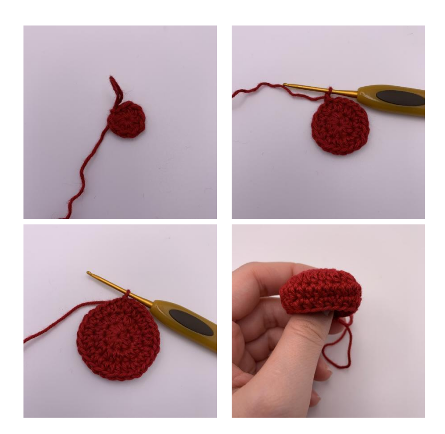
Rnd 5. Starting in the same stitch, *3sc, dec* x 4, sl st into first st of the rnd and ch1 (16) Rnd 6. 4sc, working in FLO 2hdc, 1dc, *dc inc* x 2, 1dc, 2hdc, working in both loops 4sc (18)

Tie off and leave a long tail (30cm) for sewing. The stitches worked in FLO will create the brim of the hat.