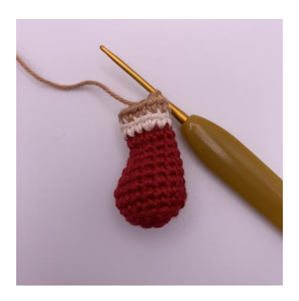
Rnd 14 - 18. Sc in each st around for 5 rnds (15)

Tie off and weave in yarn end. Repeat for the second leg - DO NOT TIE OFF THE SECOND LEG.