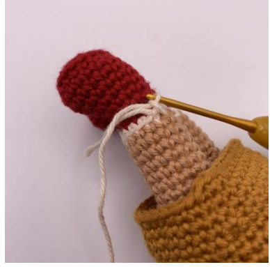
Rnd 1. Starting in the same stitch, *sc, hdc inc, sc* x 5 (20)

Tie off and weave in yarn end, repeat on the second leg.