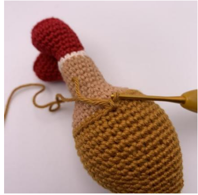
Rnd 1. Starting in the same st sc in each st around (42).