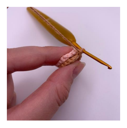
Rnd 4. Through both layers (the outer and inner ear), *2sc, inc* x 6 (24)

Making sure the wrong sides of your work are facing each other, hold the inner ear next to the outer ear.