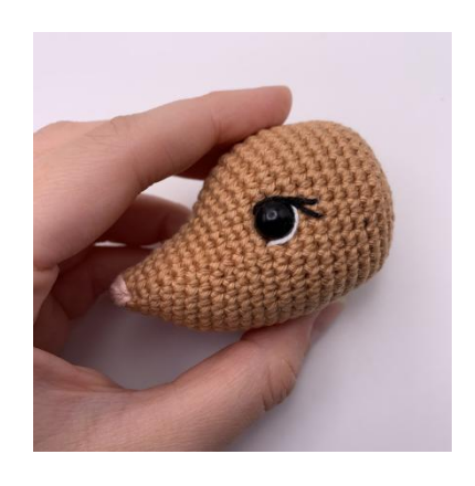
CHEEKS With Baby Pink (51). Make two.

Embroider one horisontal line along the top of the safety eye and a diagonal line next to the safety eye to create eyelashes.