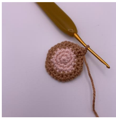
Rnd 5. *3sc, inc* x 6 (30) Folding the top of the ear together, 3sc through both layers.