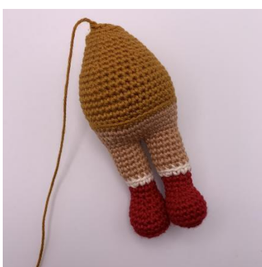
Insert hook into the unworked front loops of rnd 24 of the body, pull up a loop with ochre (13) and ch1.