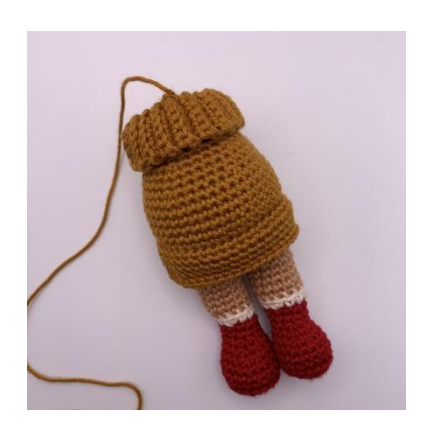
HEAD AND BODY ASSEMBLY

The body should currently look like this.