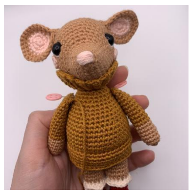
Weave in any yarn ends.