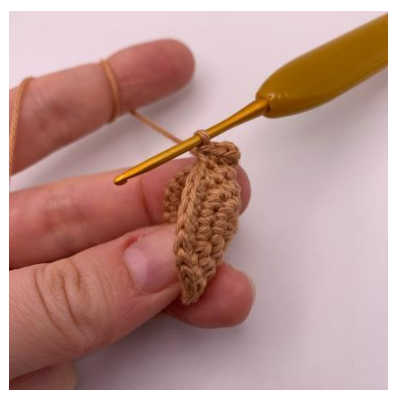
Tie off and leave a long tail for sewing.