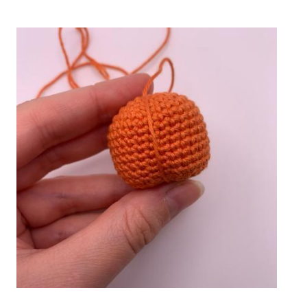
Repeat 4 more times around the pumpkin.