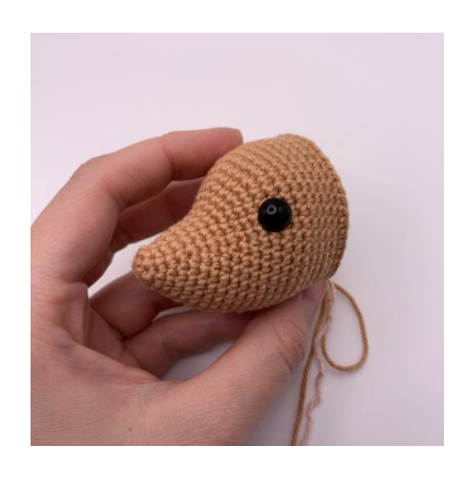
Rnd 25. *3sc, dec* x 6 (24) Rnd 26. *2sc, dec* x 6 (18) Rnd 27. *1sc, dec* x 6 (12) Rnd 28. *dec* x 6 (6)