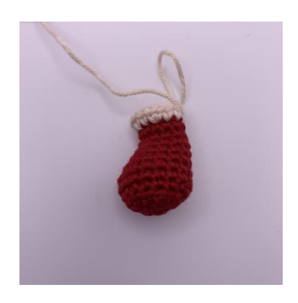
Rnd 12. *3sc, inc* x 3 (15)