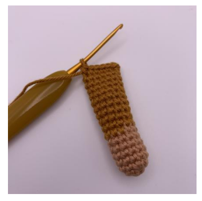
Tie off and leave a tail for sewing.

Pin and sew the arms between rnds 37 - 38 of the body.