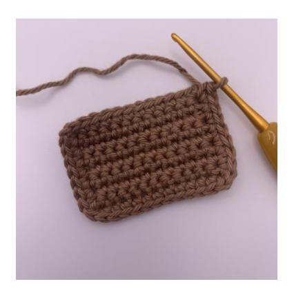
Rnd 2 - 4. Sc in each st around for 3 rnds (42)