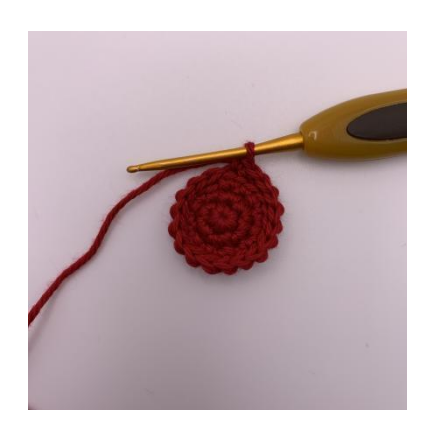
Rnd 5 - 6. Sc in each st around for 2 rnds (18) Rnd 7. 7sc, *dec* x 2, 7sc (16)

Start stuffing the legs and continue to stuff throughout this section.