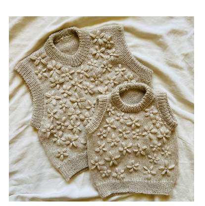
INFO AND TIPS Structure:

The slipover is worked in stockinette stitch top down in one piece. First, the back part is worked back and forth in rows and then, increases will be worked to shape the armholes. For the front part, stitches will be picked up along the back part. Then, the round neck will be shaped with increases and after joining both front parts, increases for the armholes are worked like for the back part before. Finally, the back and front part are joined by casting on new stitches under each armpit and the body is now finished in stockinette stitch in the round. Last but not least, a hem in 1x1 ribbing is added to the body. A double folded collar is now added to the neckline as well as double folded hems to the armholes.