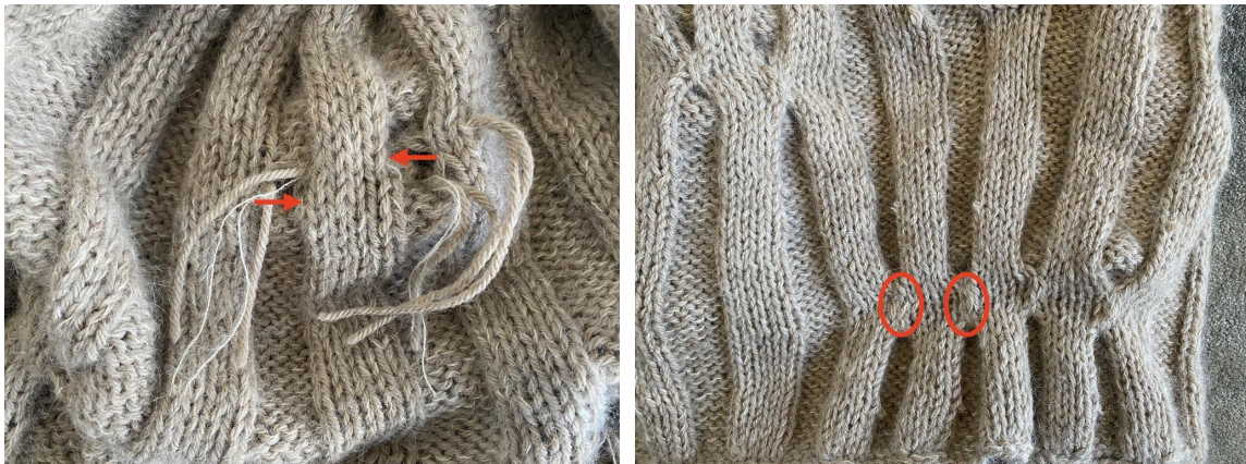
Photo Demo. for WS of Knots

Close the gaps of knots on WS (see photo demo. below).