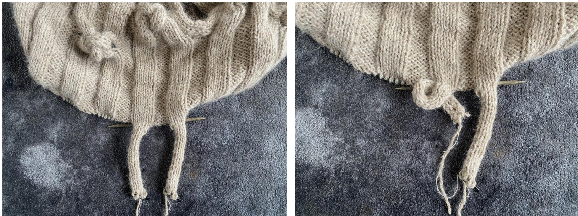
Photo Demo for Making Knot

https://www.instagram.com/reel/C7jmzGLOcp-/?utm_source=ig_web_copy_link&igsh=MzRIODBiNWFIZA==