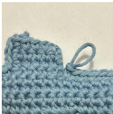
Work 1 sc in the last st available before the corner