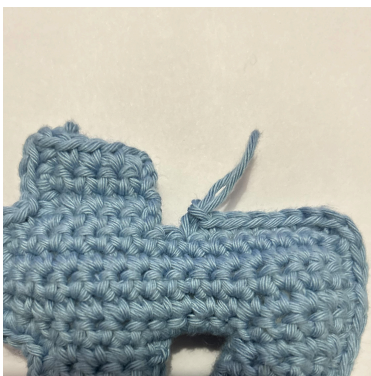
When you have a corner facing inward like this

Then go back to your crochet. Ch1 and work 1 sc in each st and side of the rows all around, passing through both pieces to assemble and stuff as you go. Finish with 1 sc in the last st and invisible join with the first one. Weave in ends.