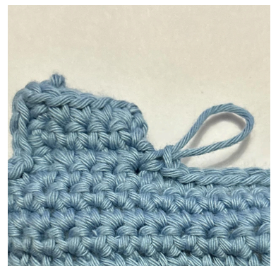
And work 1 sc in the first side of row available after the corner