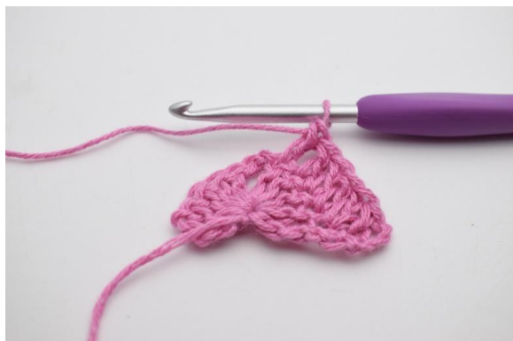
3. Crochet 1 dc in the next 4 stitches.