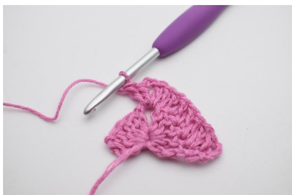
5. Like this