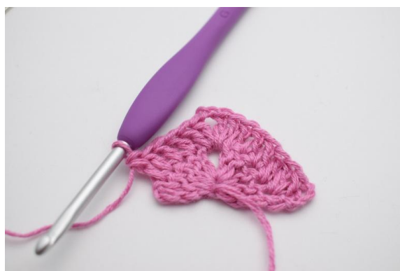
6. Crochet 1 dc in the next 4 stitches.