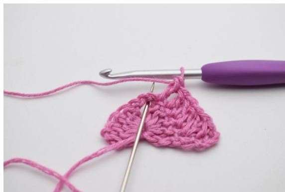
4. In the ch-sp, crochet 2 dc, chain 2, 2 dc.