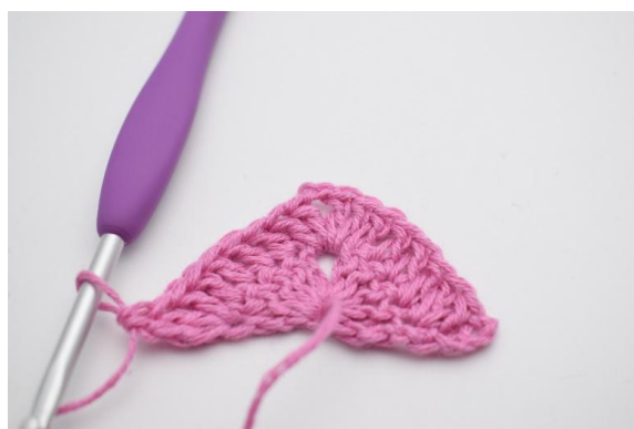
8. Like this.