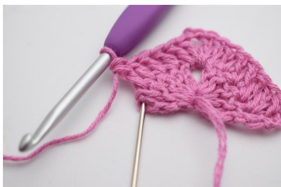
7. In the last stitch crochet 2 dc and 1 tr.