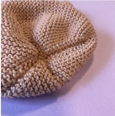
Part 1-6 sewn together