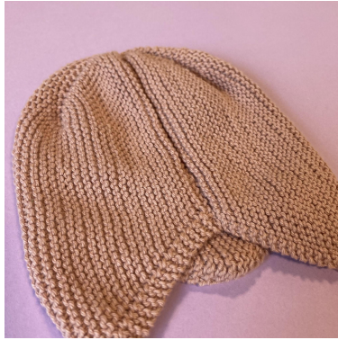
CO edge and the BO edge sewn together