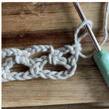
Photo shows the end of Row 2. Work was turned.

Row 2: CH-6. Into the first CH SP, SC. *(CH-5, in next CH-SP, SC). REP from *( ) across all CH-SPs. CH-2, DC into the 5th CH of the chain CH-9 below. TURN. (21 Arches)