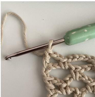
Photos show the end of Row 4.

Row 4: CH-6. into the first CH SP, SC. *(CH-5, in next CH-SP, SC). REP from *( ) across all CH-SPs. CH-2, DC into the 2nd CH of the chain CH-6 below. (21 Arches)