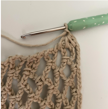
Photo shows the beginning of Row 1.

Row 1 (RS): You'll be working down your side seams. Turn your work 90 degrees. You'll be working around each arch. CH-1, SC in first CH-5 SP *(HDC3TOG, CH-1). REP from *( ) across. SC in last. TURN. (20 STS)