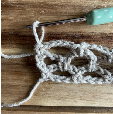
Photo shows the end of Row 3.