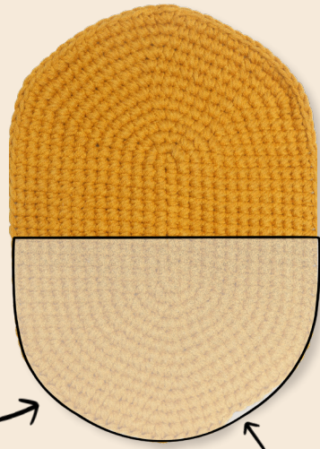
End of the round