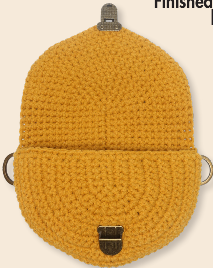
Finished Mini Moon bag