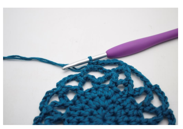
23. Like this.