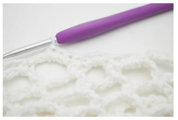
30. "Work 1 sc in the next st, work 3 sc into the following ch space".