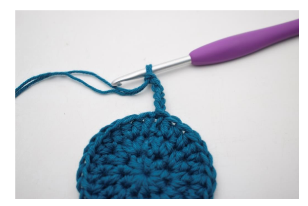
5. "Ch 5.