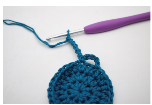
8. "Ch 5.