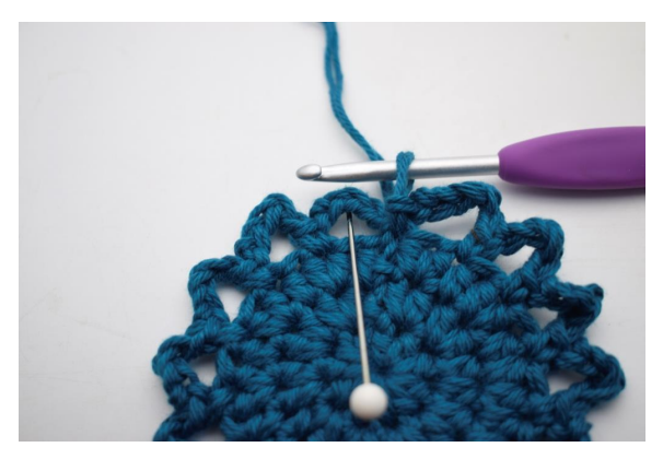
14. Work 3 sl sts up along the first ch space to begin in the middle of the space.