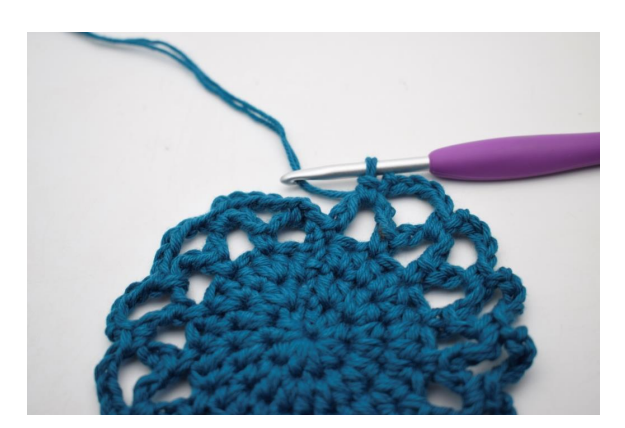
20. Repeat "to" to the end of the round.