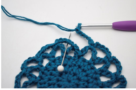
20. To end the round, work 1 sc into the first ch space made in this same round.