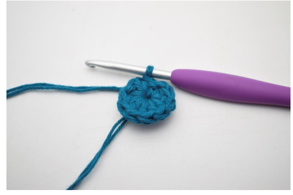
2. Work 10 hdc into the ring. Finish with a sl st. (10)