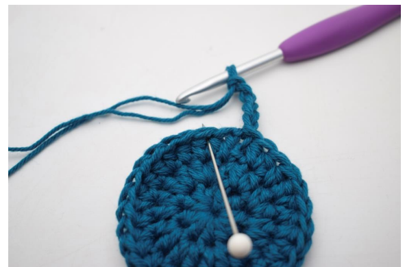
6. Skip 1 st and work 1 sc in the next st".