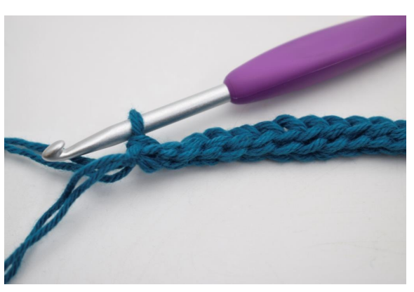
4. Work sl sts in all loops to the end of the row.