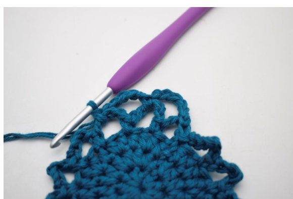
19. Like this.