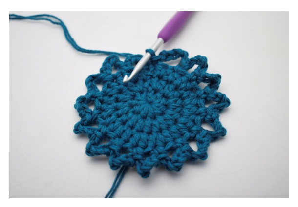
13. Like this. (15 ch spaces)