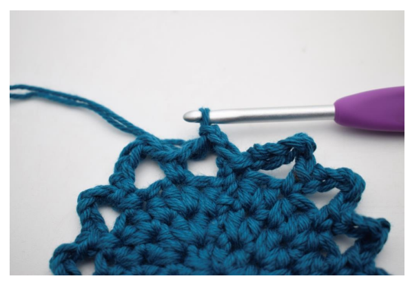
15. Like this.