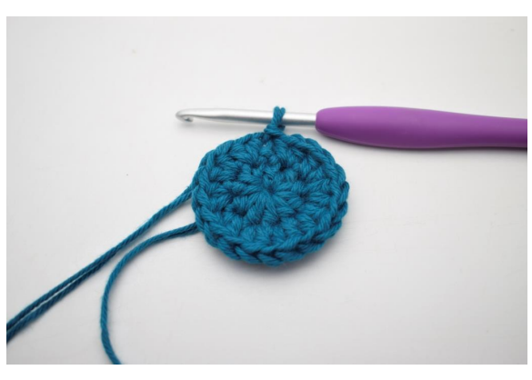
3. Ch 1. Work 2 hdc in each st. Finish with a sl st. (20)