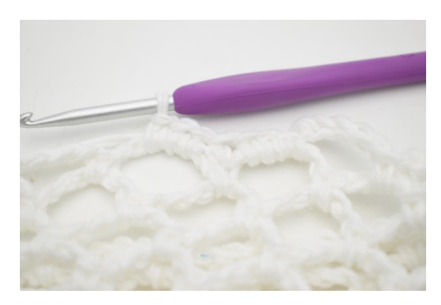
29. Work 3 sc into the following ch space".