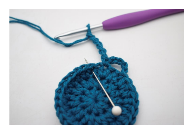
9. Skip 1 st and work 1 sc in the next st".