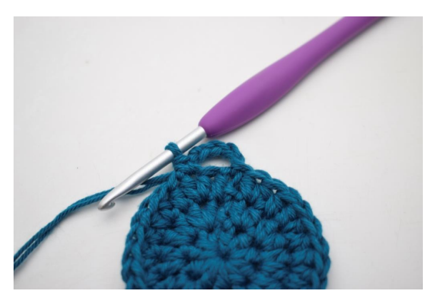
7. Like this.