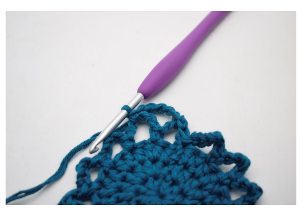
17. Like this.