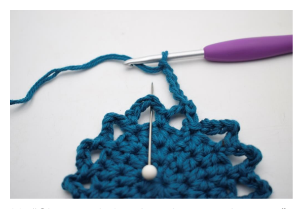
16. "Ch 5, work 1 sc into the next ch space"