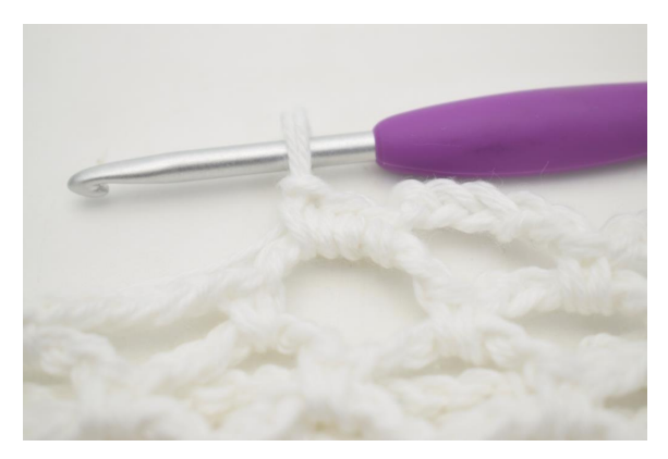
27. Work 2 sc into the ch space into which you worked the last sc of the previous round.