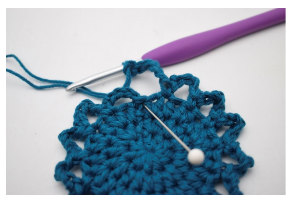
12. Finish with a sl st.