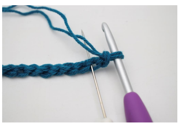
2. Tilt your base ch to make the back vertical loops appear.Work 1 sl st in the 2nd loop from the hook.