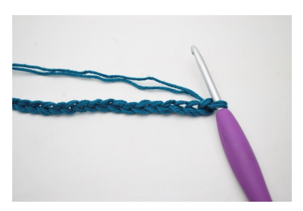
1. Ch 100.