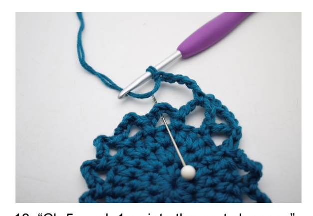
18. "Ch 5, work 1 sc into the next ch space"