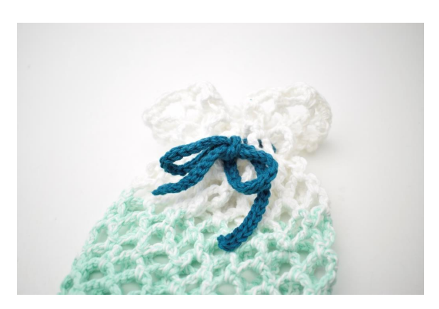
7. Like this.