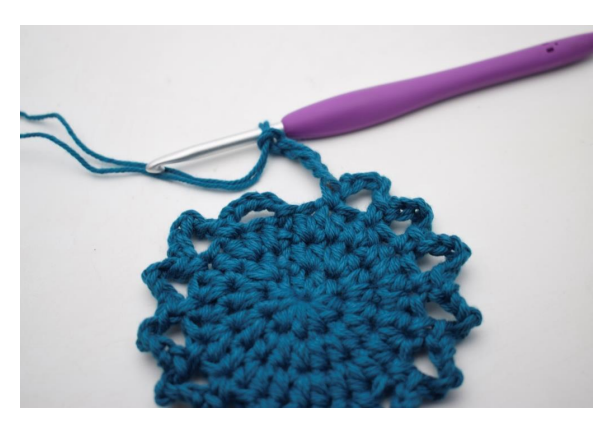
11. "Ch 5, skip 1 st and work 1 sc in the next st". Repeat "to" to the end of the round.