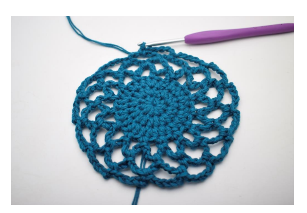
24. Repeat "to" to the end of the round. (15 ch spaces)