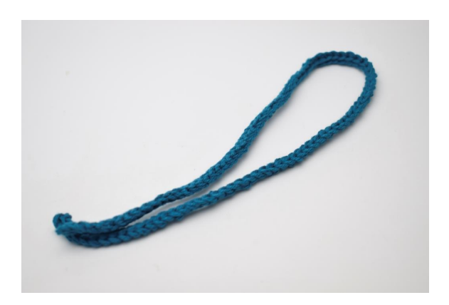
5. Cut the yarn and weave in ends.