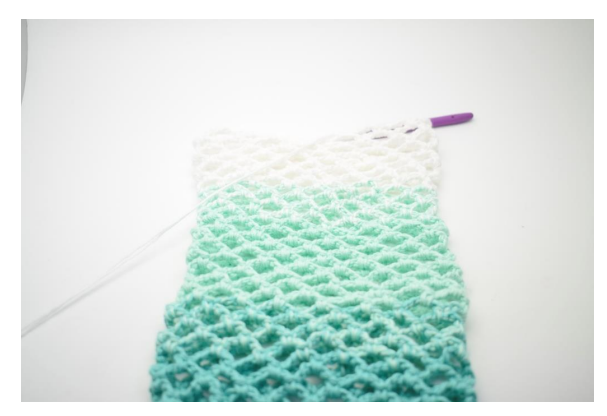
26. Repeat row 6 until you have a total of 64 rounds.