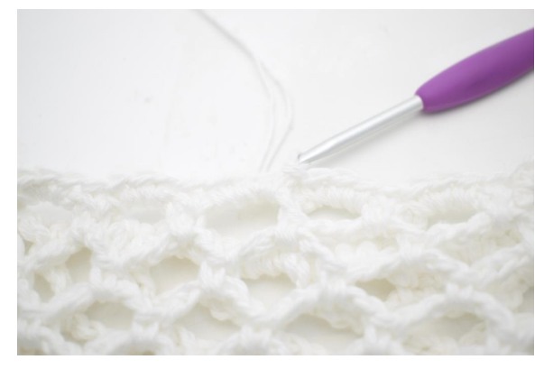
31. Repeat "to" to the end of the round. Finish with a sl st.