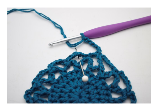
22. "Ch 5, work 1 sc into the next ch space"