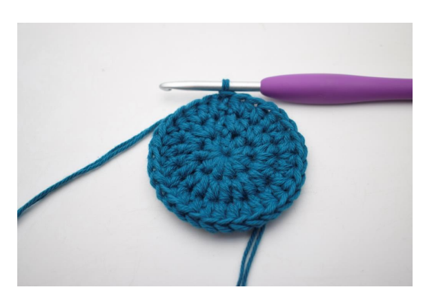
4. Ch 1. "Work 1 hdc in the first st, 2 hdc in the next st". Repeat "to" to the end of the round and finish with a sl st. (30)