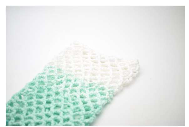
32. Cut the yarn and weave in ends.