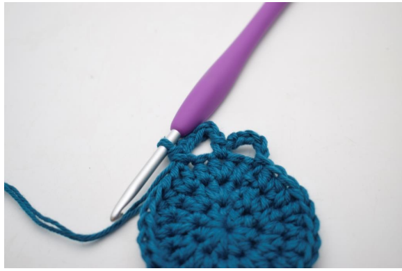
10. Like this.