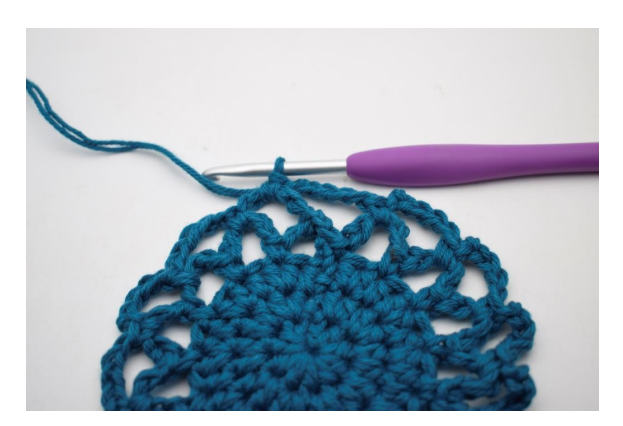
21. Like this. (15 ch spaces)