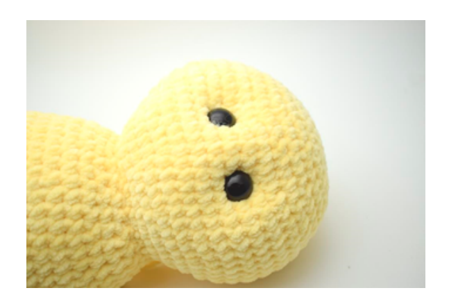
5. Tighten slightly to indent the eyes a bit and shape the hollows.