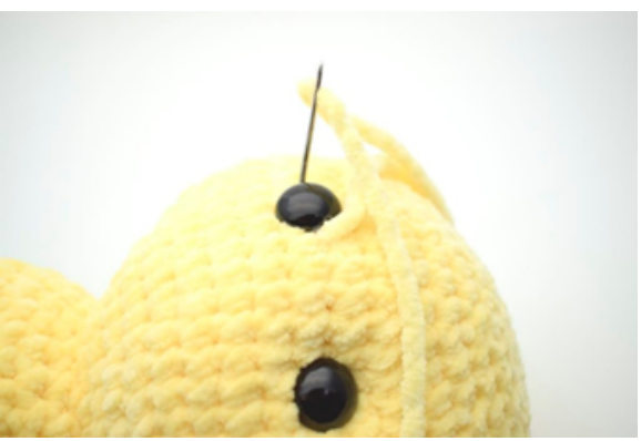
4. and insert it again on the opposite side of the eye