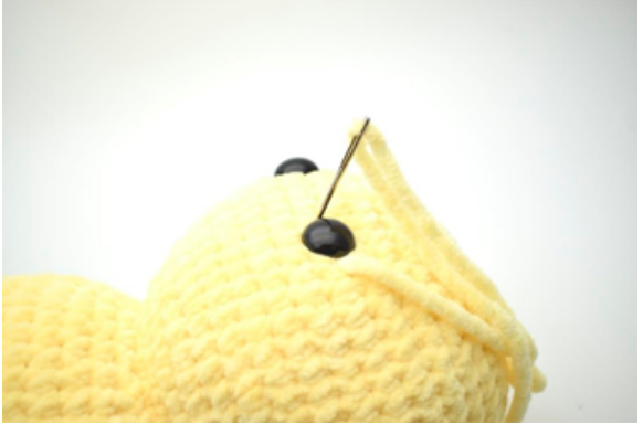
2. Insert the needle on the opposite side of the eye and tighten slightly.