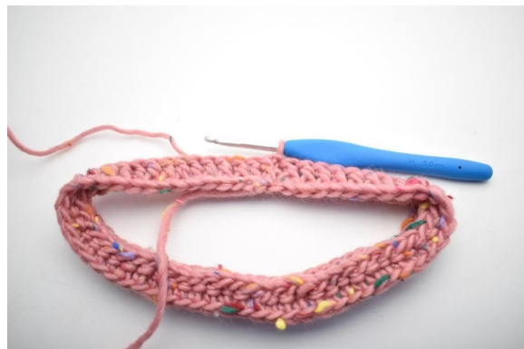
10. Work 1 FPdc around. End with a sl st. = 58 (62)