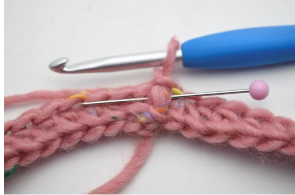
6. Work 1 FPdc around the first st. A FPdc is a raised double dc which is worked from the front around the post of the previous row. The needle indicates where to work the dc from the front and around the post.