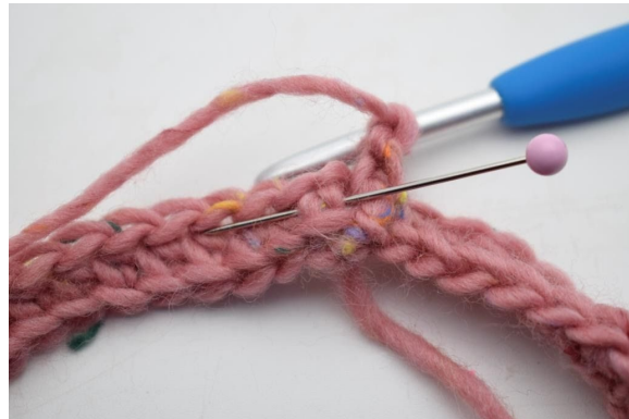
8. Work 1 FPdc around the next st.