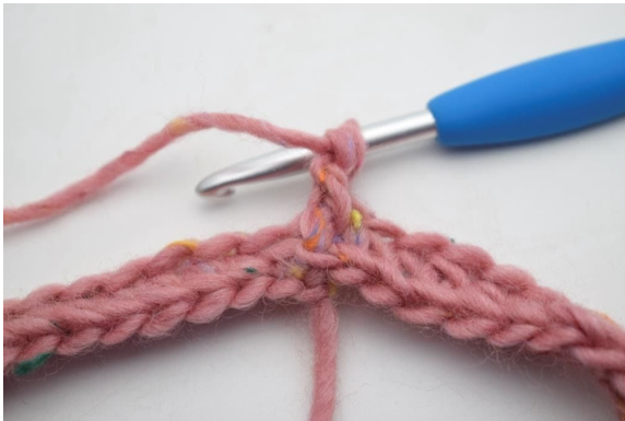
7. This is how it will look.