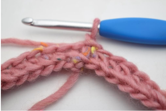
5. Ch 1.