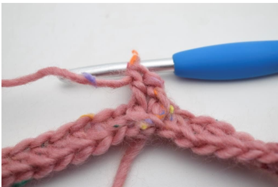
9. This is how it will look.