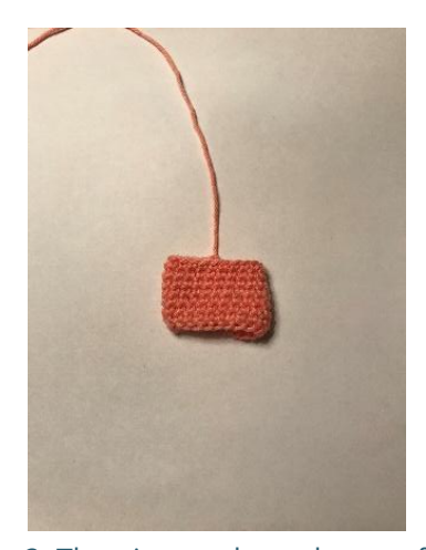
2. The picture shows how to fold the flat piece. Wind the tail around the round piece and tighten to make it narrower in the middle part and thus form a bow.

Cut off the yarn but leave a LONG tail for making the middle part of the bow. Now, fold the round piece flat leaving the tail in the middle so that it can be wound around the piece and form a bow.