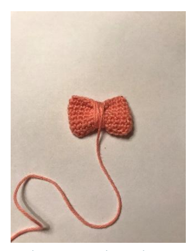
3. The picture shows how to wind the tail around the flat piece.

Weave in the end thoroughly on the back side and leave a tail for sewing the bow onto the head.