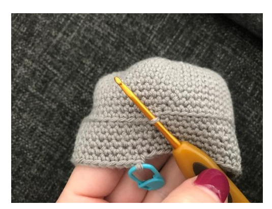
The picture shows where to insert the hook to begin making Hollie's dress. I did it in the front loop where the beginning and end of rnd 21 meet and after having crocheted the body through rnd 26.

Rnd 1: 1 sc in each st (60). When you reach the end of the round make 1 sc in the st where you pulled the yarn through to begin making the dress. This sc replaces the st you made at the beginning meaning that you now have 60 sts.