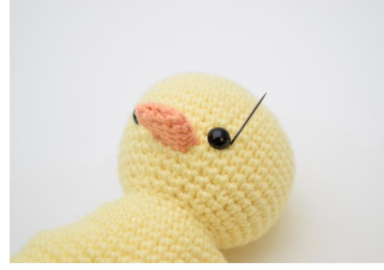
1. Pull the yarn and needle out on the right side of the right eye.