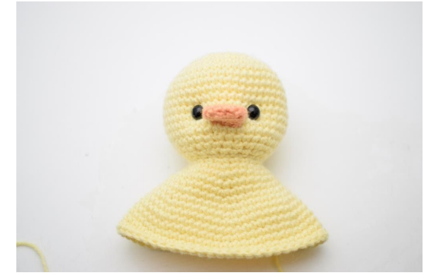
5. Tighten gently until the eye hollows have the desired shape. Weave in ends.