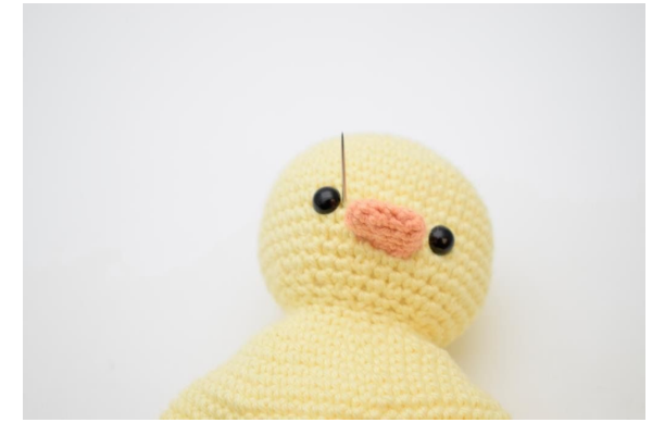
3. Pull the needle through on the right side of the other eye.