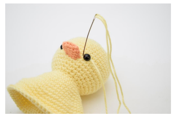
2. Insert the needle on the left side of the eye.