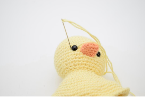
4. Insert the needle on the left side of the eye.