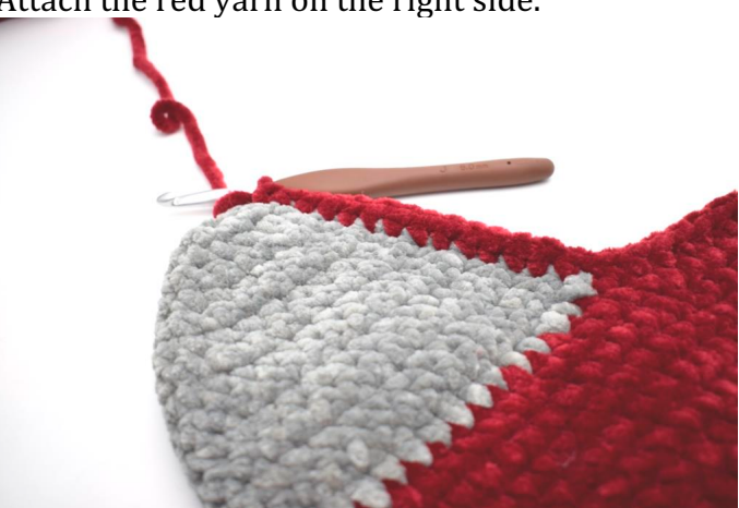
Now, work 14 sts along one side of the heel.