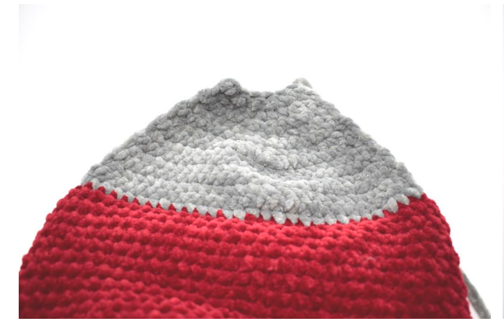
This is how the heel looks like now.