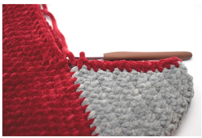
And 14 sc along the other side of the heel.