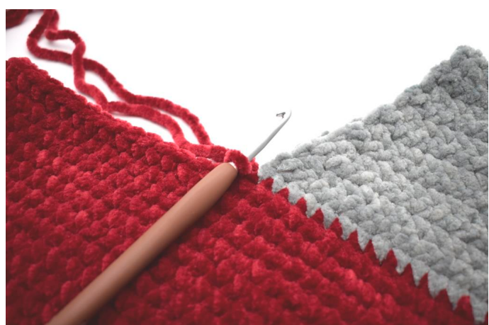
Attach the red yarn on the right side.