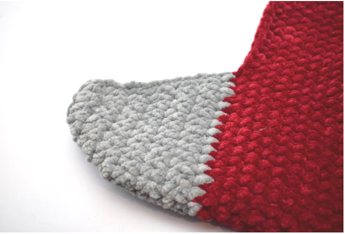
Sew the end together on the wrong side. The heel is now finished.