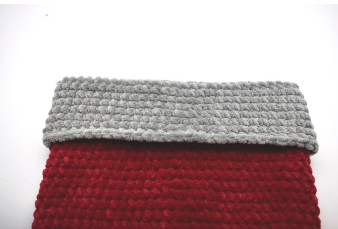
The edge is now finished.