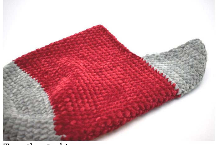
Turn the stocking.

1. Turn the stocking and on the right side attach the yarn as shown in the picture below. Work 1 sc in 32 sts until the beginning of the heel and now work 14 sc along one side of the heel, and 14 sc along the other side of the heel. (60)