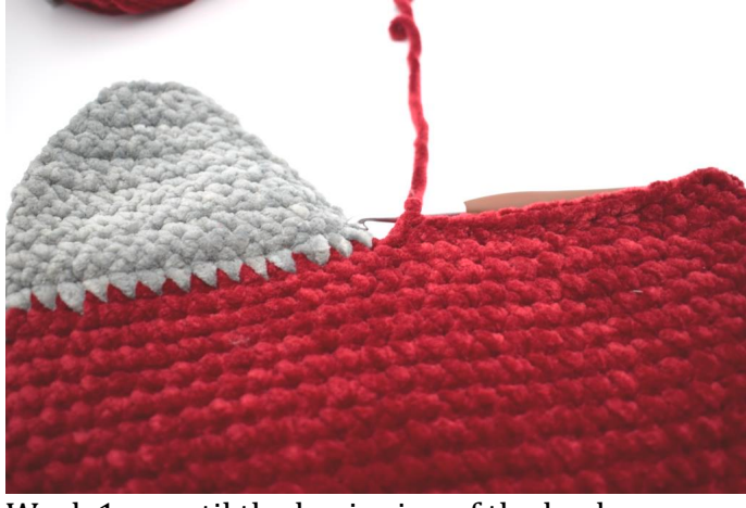
Work 1 sc until the beginning of the heel.