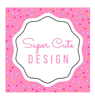
Enjoy :-) Super Cute Design