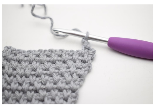
65. Ch 1 and work the 2 next ch-space tog.