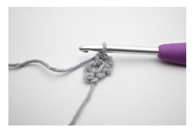
5. Like this.