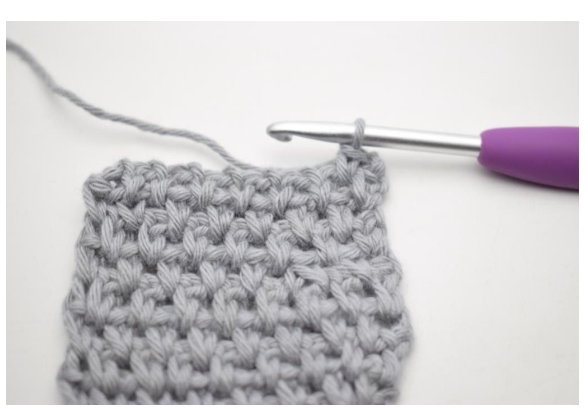
80. Work 1 sc in first ch-space.