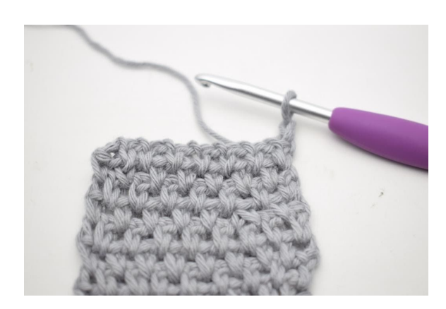
79. Turn with ch 2.