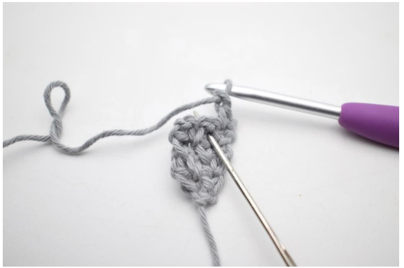
21. Ch 1 and work 1 sc in next ch-space.