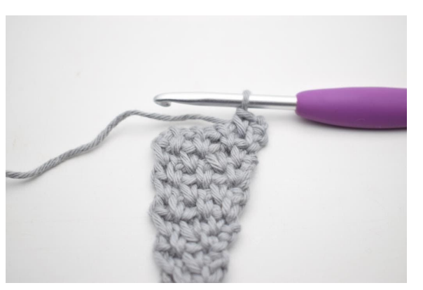
51. Work 1 sc in first ch-space.