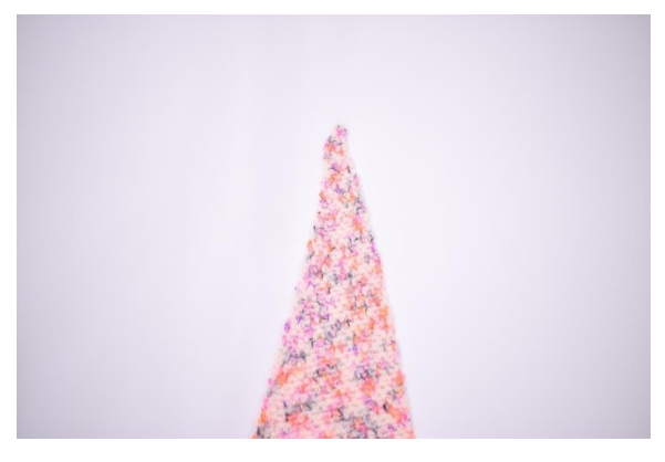
94. Repeat the procedure and decrease on every 4<sup>th</sup> row, until you have worked a total of 348 rows. (2 sc)