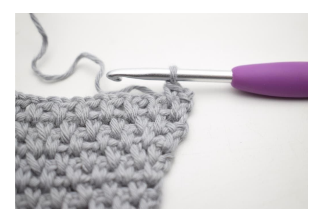
64. Like this.