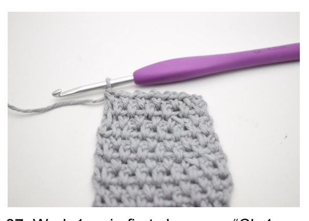
87. Work 1 sc in first ch-space. "Ch 1