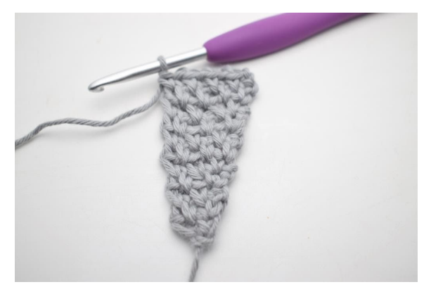
52. "Ch 1 and work 1 sc in next ch-space". Repeat from " to " 2 times more. (4 sc)