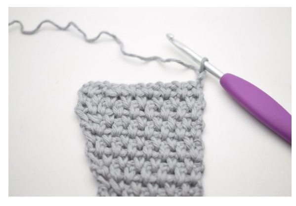
70. Turn with ch 2.