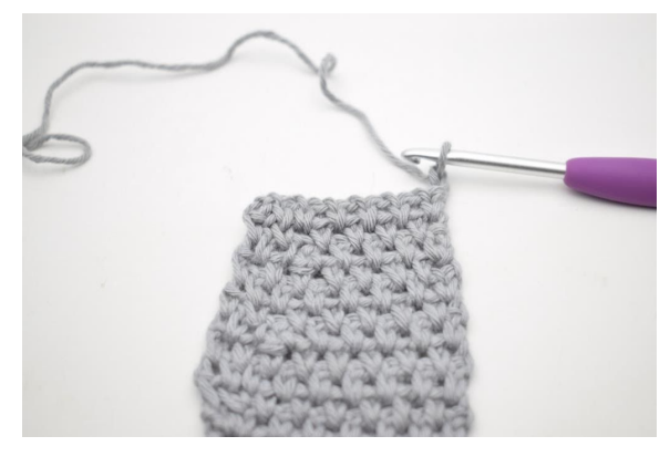
88. Turn with ch 2.