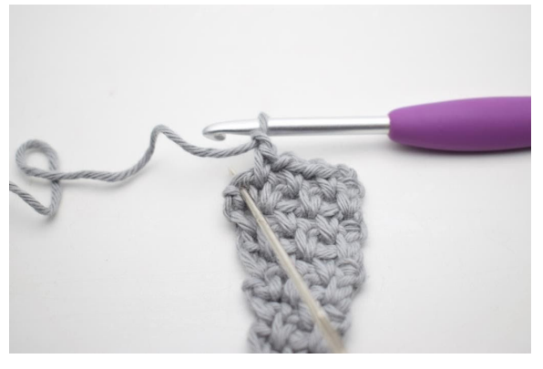
48. Ch 1 and work 1 sc in last st. (4 sc)