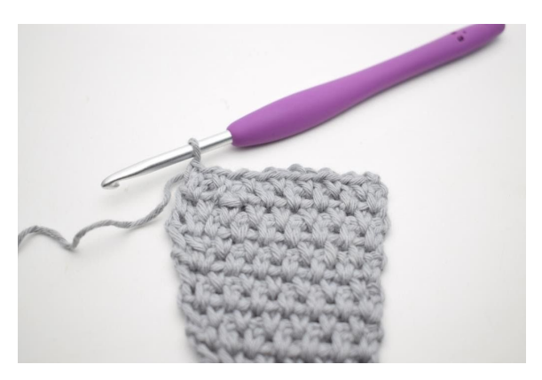
74. Repeat from " to " 42 times more. (44 sc)