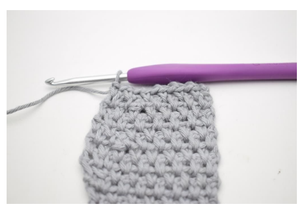
85. Work 1 sc in first ch-space. "Ch 1 and work 1 sc in next ch-space". Repeat from " to " 41 times more. (43 sc)