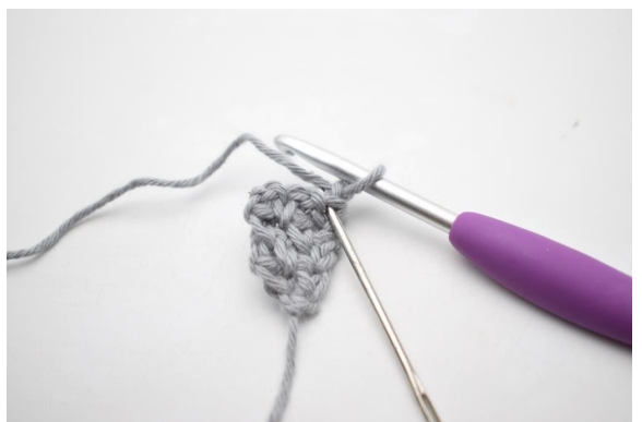
19. Work 1 sc in first st.