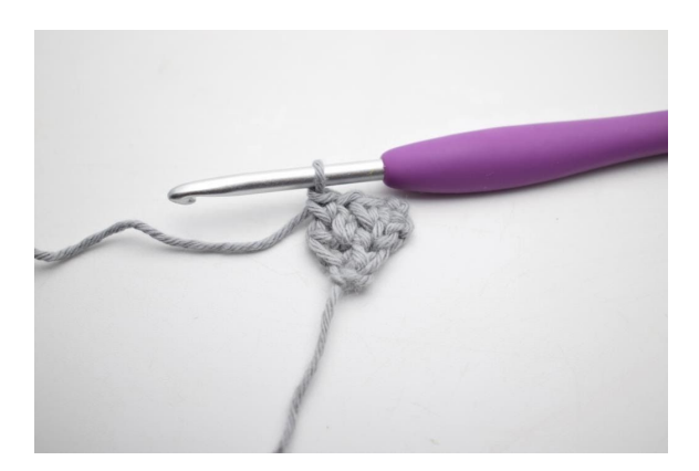
12. Like this.