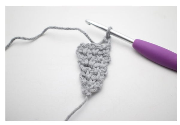
36. Turn with ch 2.