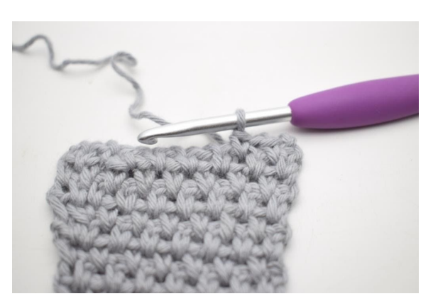
73. Like this.