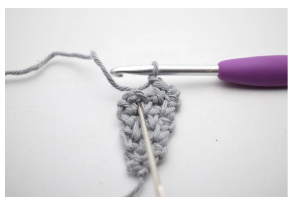
28. Ch 1 and work 1 sc in next ch-space.