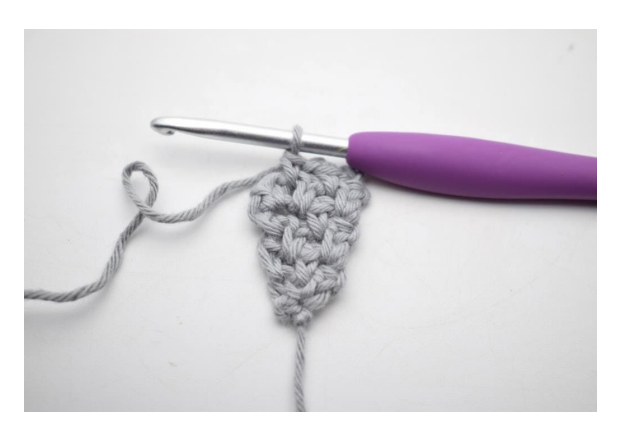
29. Like this.