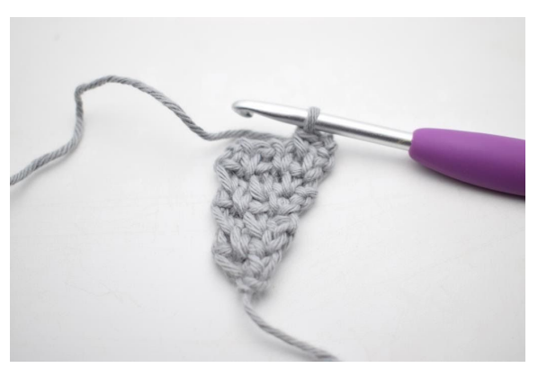
33. Work 1 sc in first ch-space.