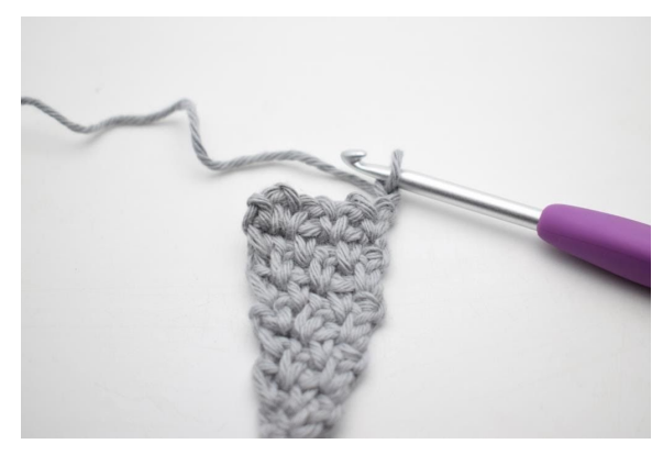
45. Turn with ch 2.