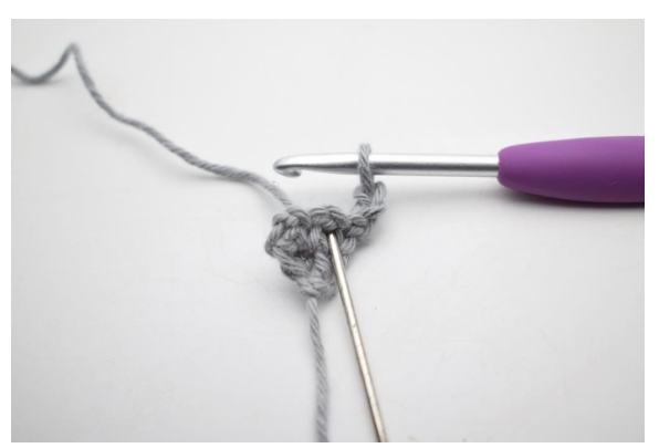
9. Work 1 sc in first ch-space.