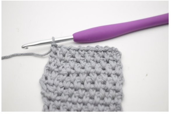
78. Work 1 sc in first ch-space. "Ch 1 and work 1 sc in next ch-space". Repeat from " to " 42 times more. (44 sc)