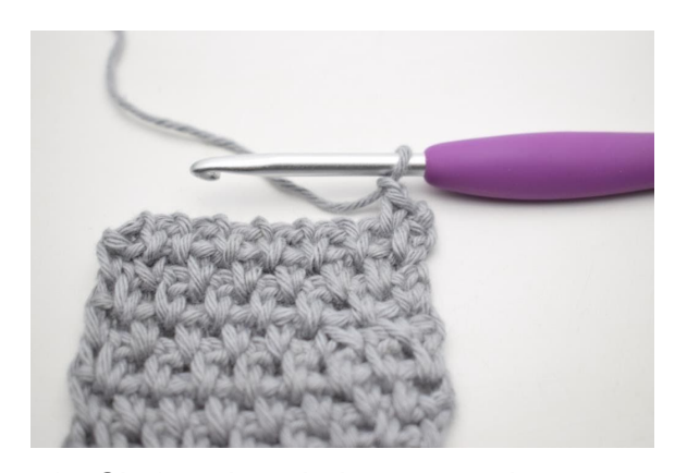
81. Ch 1 and work the 2 next ch-space tog.