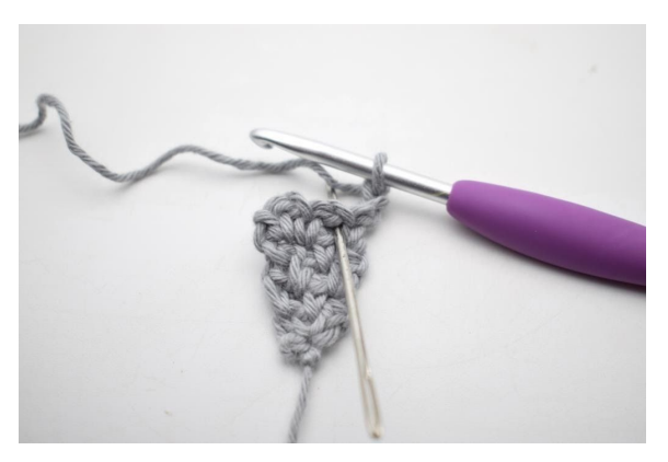
26. Work 1 sc in first ch-space.