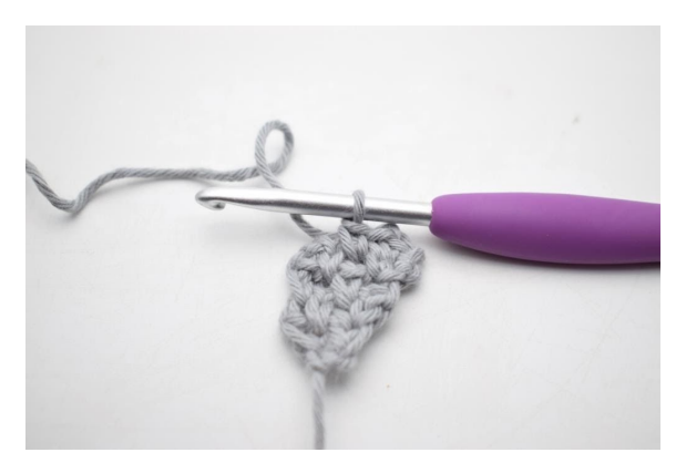
22. Like this.