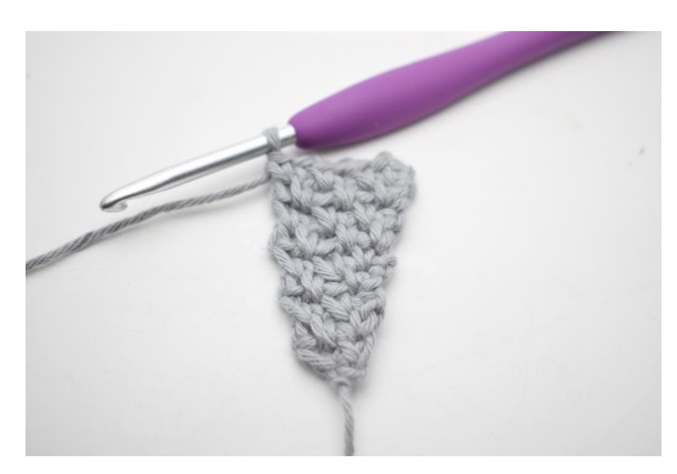
44. Repeat from " to " 2 times more. (4 sc)