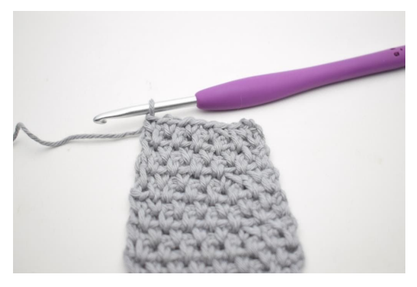
90. Turn with ch 2. Work 1 sc in first ch-space. Ch 1 and work the 2 next ch-space tog. "Ch 1 and work 1 sc in next ch-space". Repeat from " to " 39 times more. (42 sc)