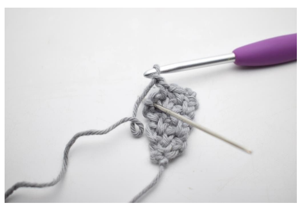
30. Ch 1 and work 1 sc in last st. (3 sc)