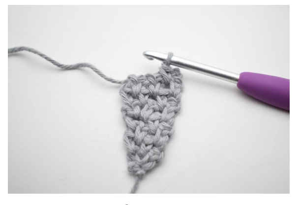
37. Work 1 sc in first ch-space.