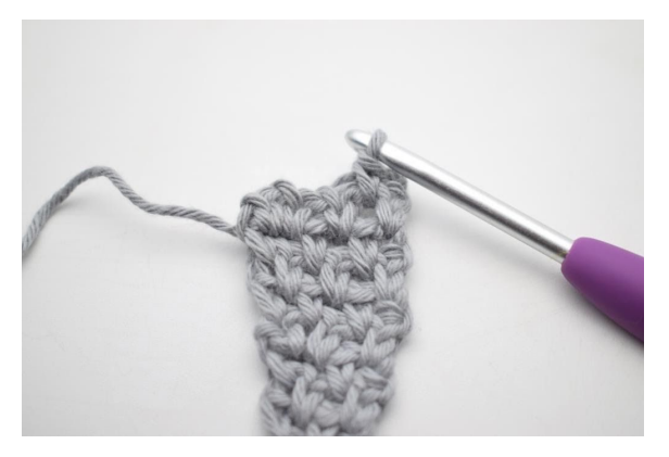
46. Work 1 sc in first ch-space.