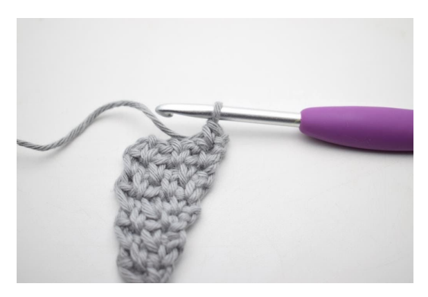
42. "Ch 1 and work 1 sc in next ch-space".