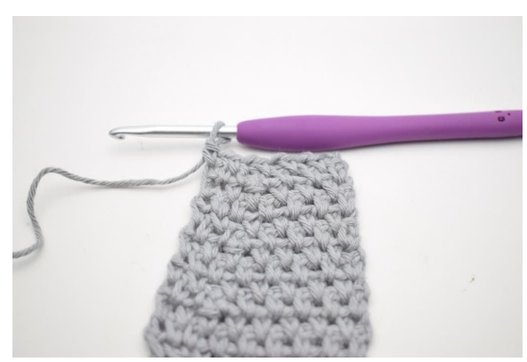
91. Turn with ch 2. Work 1 sc in first ch-space. "Ch 1 and work 1 sc in next ch-space". Repeat from " to " 40 times more. (42 sc)