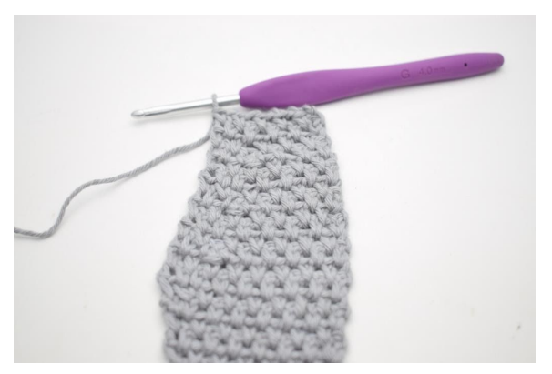
93. Turn with ch 2. Work 1 sc in first ch-space. "Ch 1 and work 1 sc in next ch-space". Repeat from " to " 40 times more. (42 sc)