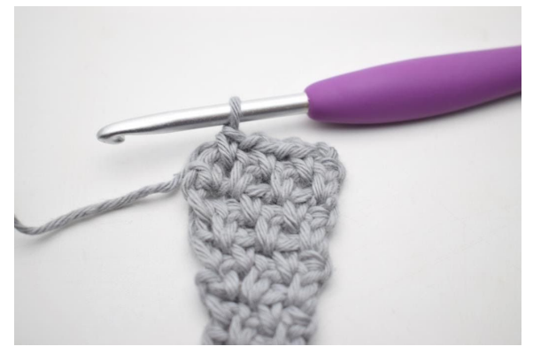
47. "Ch 1 and work 1 sc in next ch-space". Repeat from "to" 1 more time.