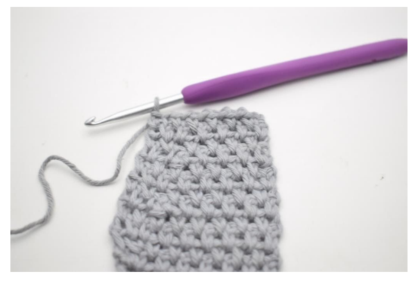
89. Work 1 sc in first ch-space. "Ch 1 and work 1 sc in next ch-space". Repeat from " to " 41 times more. (43 sc)