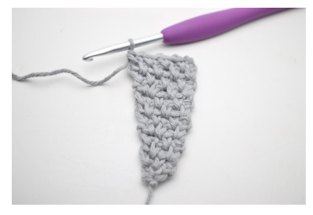
55. "Ch 1 and work 1 sc in next ch-space". Repeat from " to " 2 times more. (4 sc)