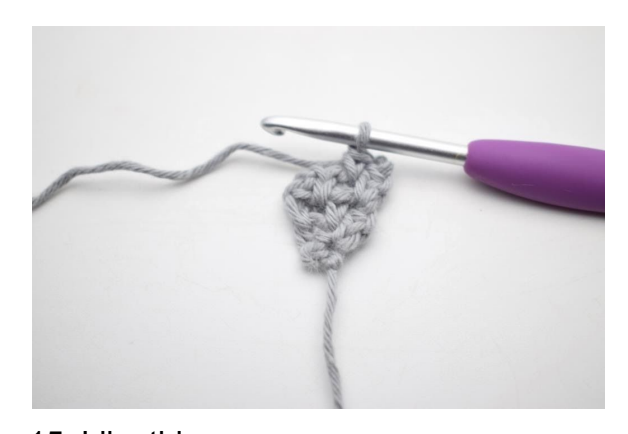
15. Like this.