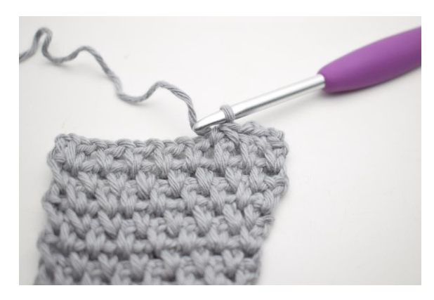
66. Like this.