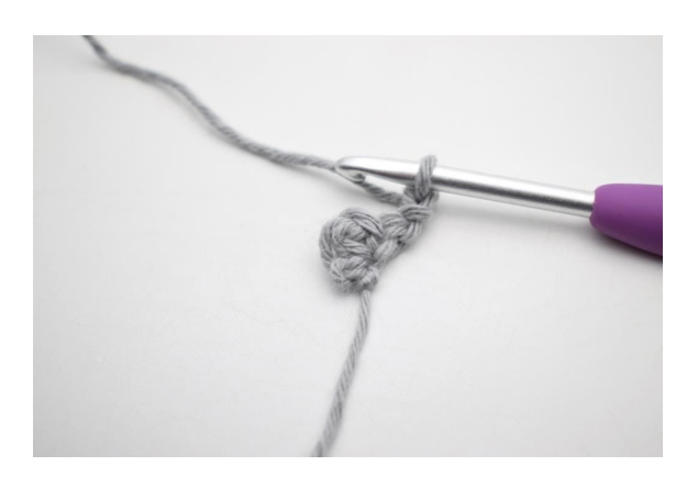
3. Turn with ch 2.