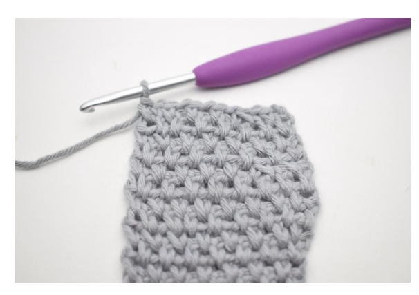
83. "Ch 1 and work 1 sc in next ch-space". Repeat from " to " 40 times more. (43 sc)