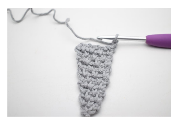
53. Turn with ch 2.