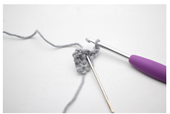
14. Work 1 sc in first ch-space.