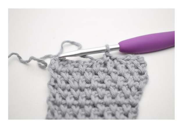
68. Like this.