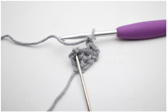
11. Ch 1 and work 1 sc in last ch-space. (2 sc)