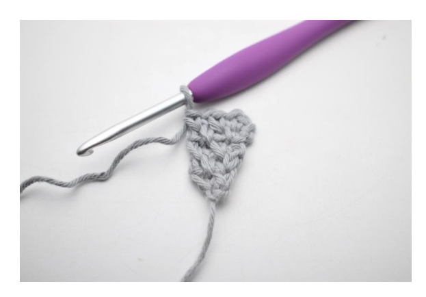
24. Like this.