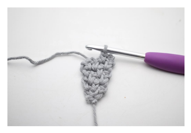
27. Like this.