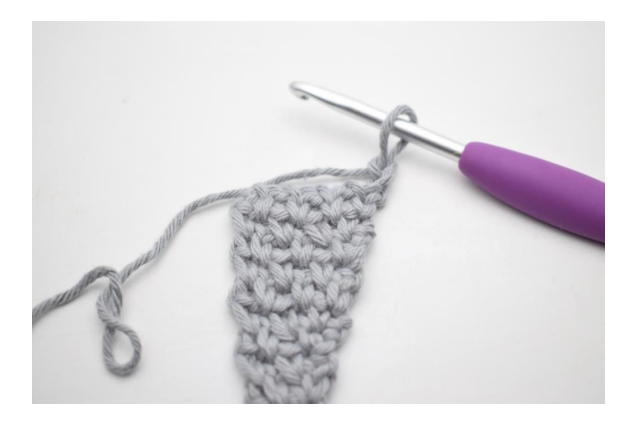
50. Turn with ch 2.