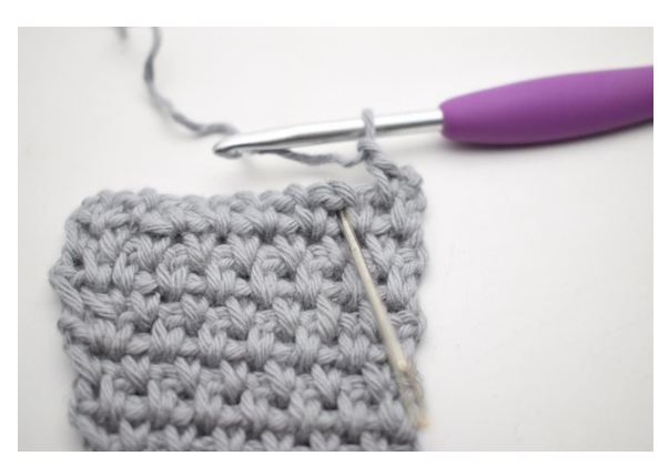
72. "Ch 1 and work 1 sc in next ch-space".