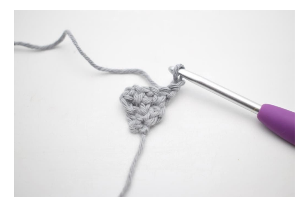
13. Turn with ch 2.