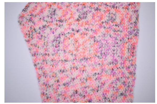
61. Now you need to decrease in every 4<sup>th</sup> row, as the shawl isn't going to be any wider.