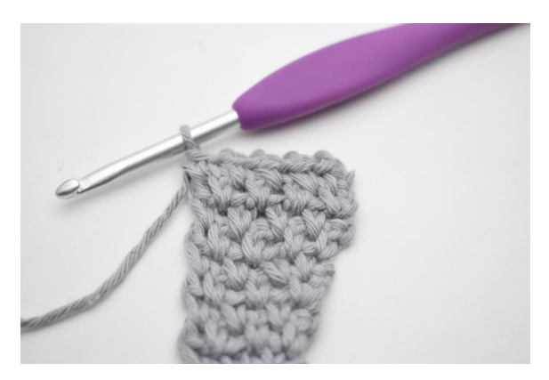
56. Turn with ch 1. Work 1 sc in first st. "Ch 1 and work 1 sc in next ch-space". Repeat from " to " 3 times more. (5 sc)