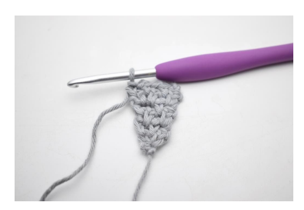
31. Like this.