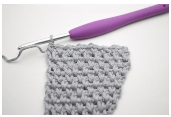
69. Repeat from " to " 41 times more. (44 sc)