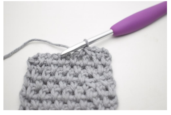
82. Like this.