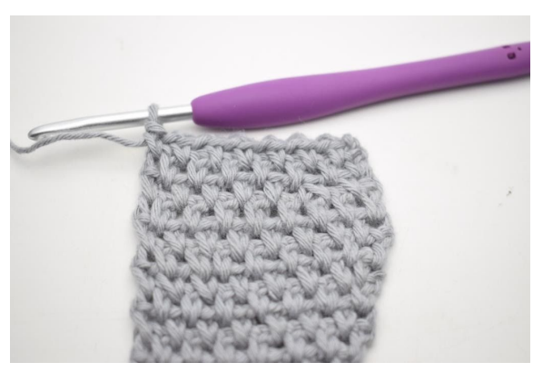
76. Work 1 sc in first ch-space. "Ch 1 and work 1 sc in next ch-space". Repeat from " to " 42 times more. (44 sc)