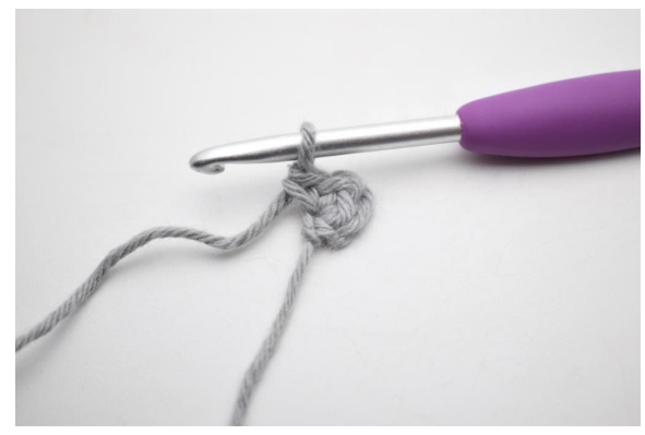
2. Work 1 sc, ch 1 and 1 sc in 2^{nd} ch from hook. (2 sc)