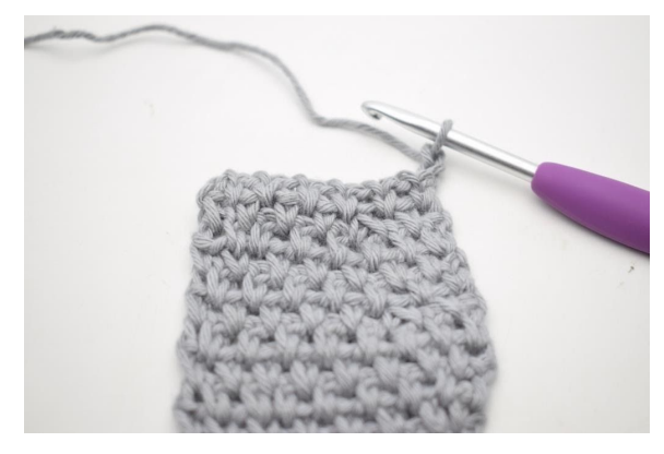
86. Turn with ch 2.