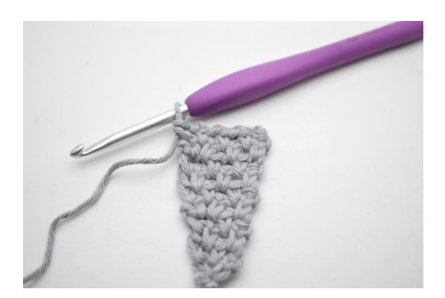
49. Like this.