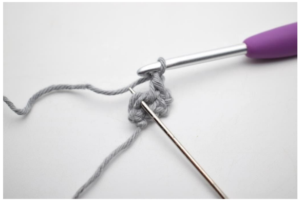
6. Ch 1, and work 1 sc in last st. (2 sc)