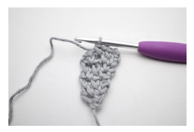
34. "Ch 1 and work 1 sc in next ch-space".