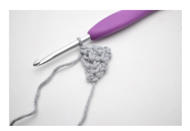
17. Like this.