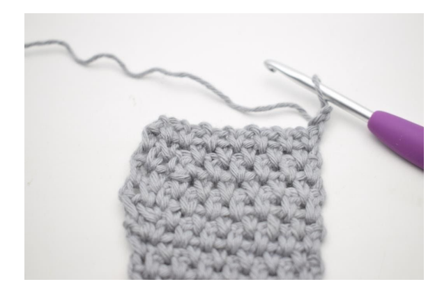
77. Turn with ch 2.