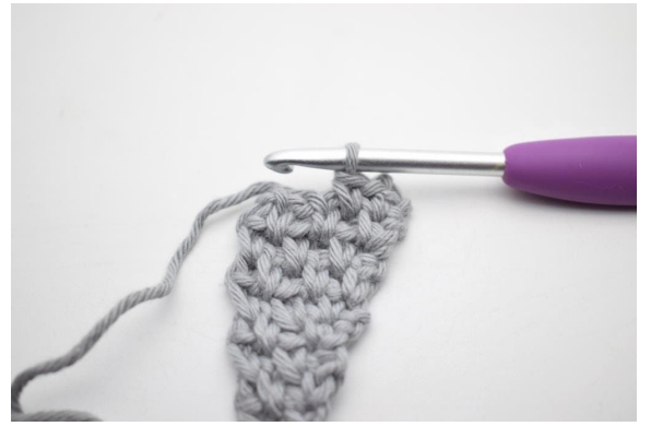
43. Like this.