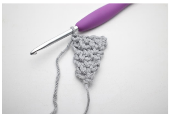
35. Repeat from " to " 1 more time. (3 sc)