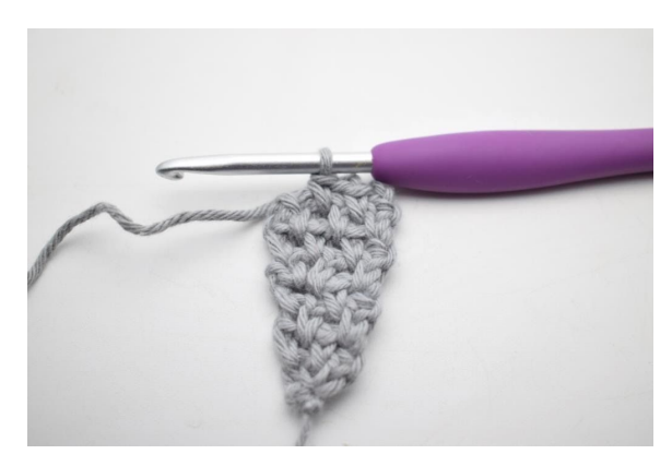
38. "Ch 1 and work 1 sc in next ch-space".