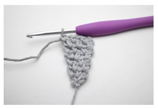
39. Repeat from " to " 1 more time. (3 sc)