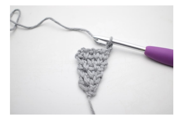
32. Turn with ch 2.