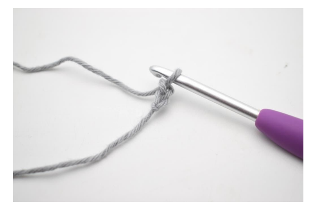
1. Ch 2.