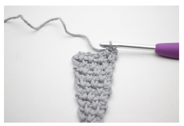
54. Work 1 sc in first ch-space.