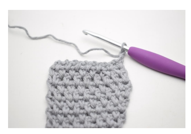
75. Turn with ch 2.