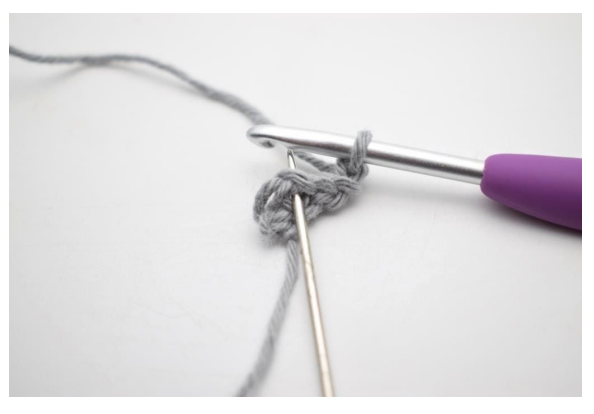
4. Work 1 sc in first ch-space.