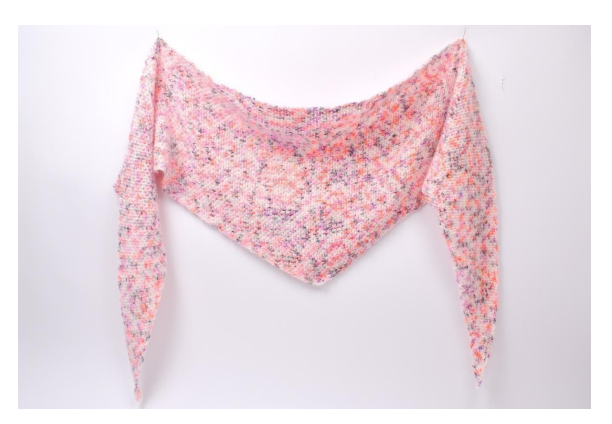
95. Cut the yarn and weave in ends.