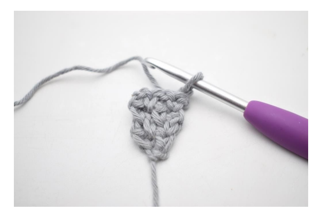
18. Turn with ch 1.