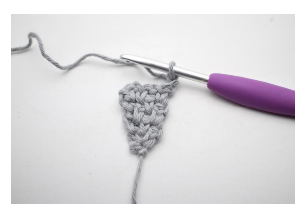
25. Turn with ch 2.