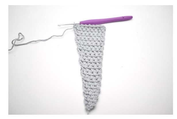
60. Repeat the same procedure and increase in every 4<sup>th</sup> row until you have worked a total of 176 rows. (45 sc)