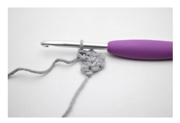
7. Like this.