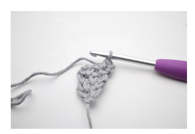
20. Like this.