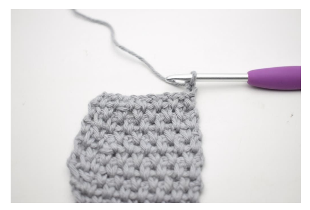
84. Turn with ch 2.