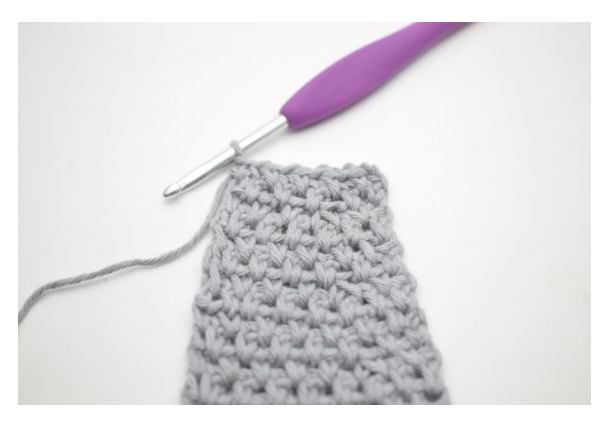
92. Turn with ch 2. Work 1 sc in first ch-space. "Ch 1 and work 1 sc in next ch-space". Repeat from "to" 40 times more. (42 sc)