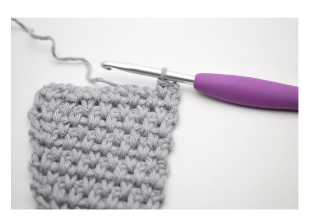
71. Work 1 sc in first ch-space.