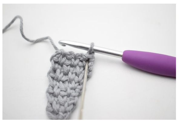
41. Work 1 sc in first st.