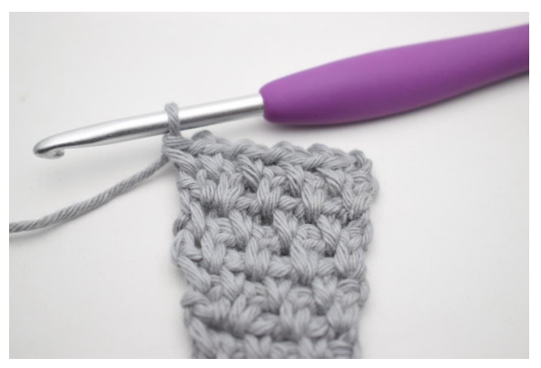
57. Turn with ch 2. Work 1 sc in first ch-space. "Ch 1 and work 1 sc in next ch-space". Repeat from " to " 2 times more. Ch 1 and work 1 sc in last st. (5 sc)