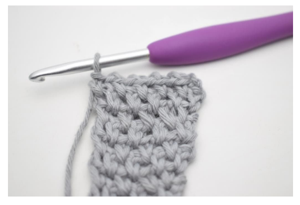
58. Turn with ch 2. Work 1 sc in first ch-space. "Ch 1 and work 1 sc in next ch-space". Repeat from " to " 3 times more. (5 sc)