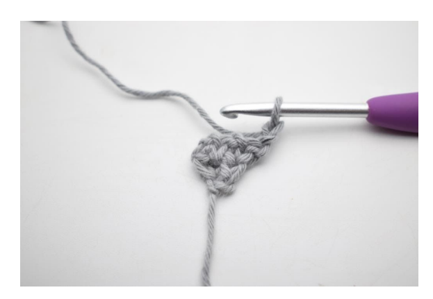
8. Turn with ch 2.