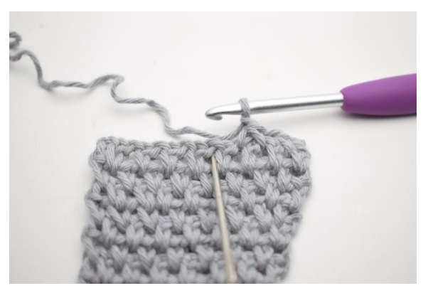
67. "Ch 1 and work 1 sc in next ch-space".