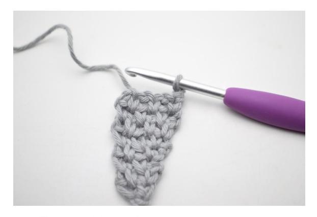
40. Turn with ch 1.