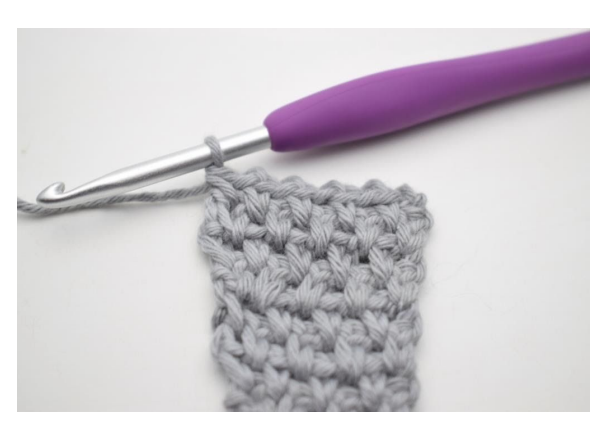
59. Turn with ch 2. Work 1 sc in first ch-space. "Ch 1 and work 1 sc in next ch-space". Repeat from " to " 3 times more. (5 sc)