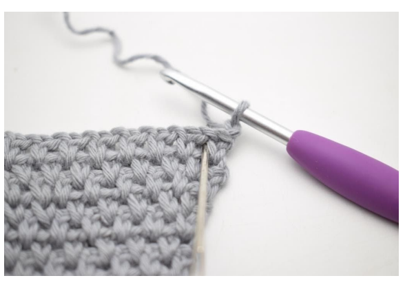
63. Work 1 sc in first ch-space.