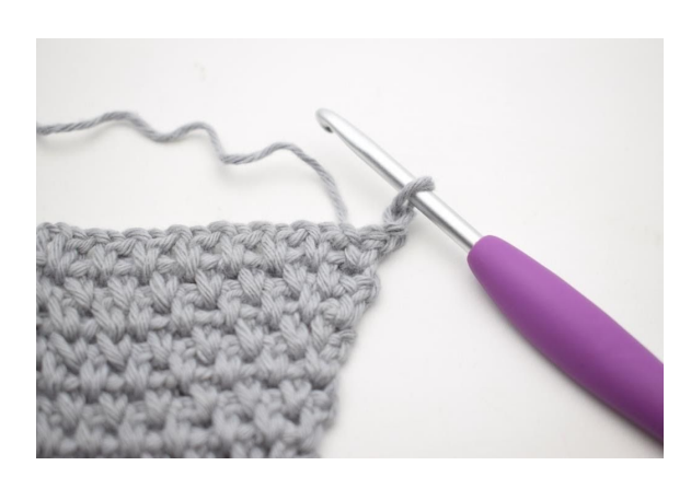
62. Turn with ch 2.