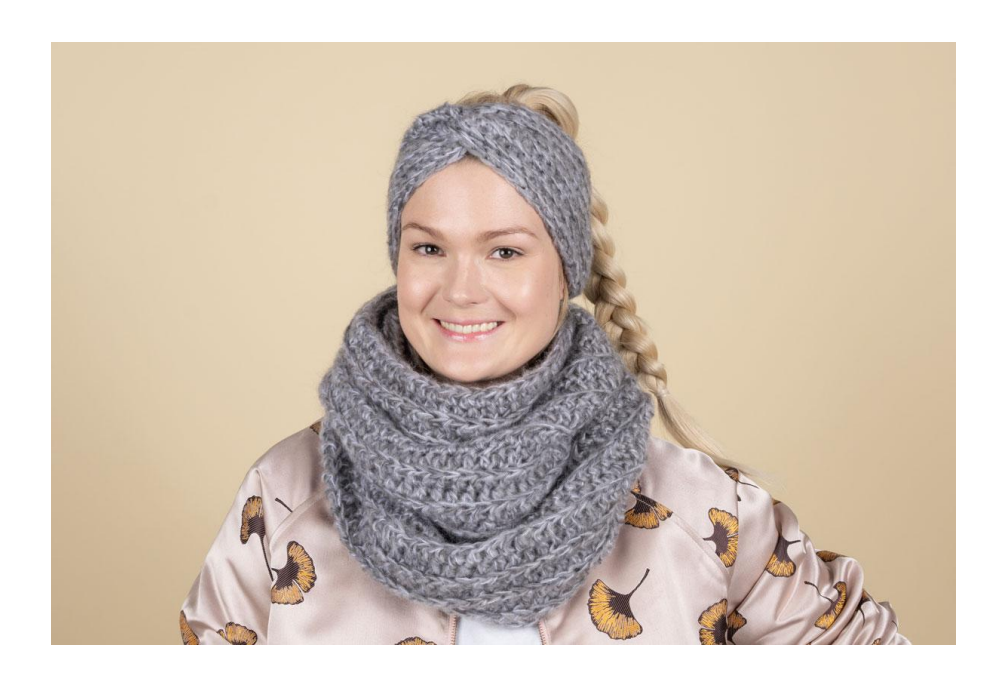
Enjoy 😔 Love from Hobbii.com