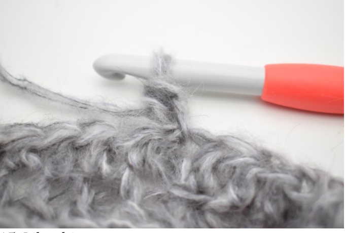
15. Like this.