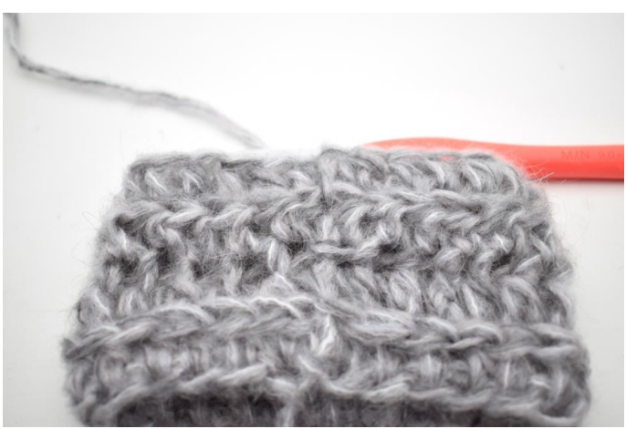
16. Work hdc tbl on entire round. Finish with 1 sl st in first hdc. (125)