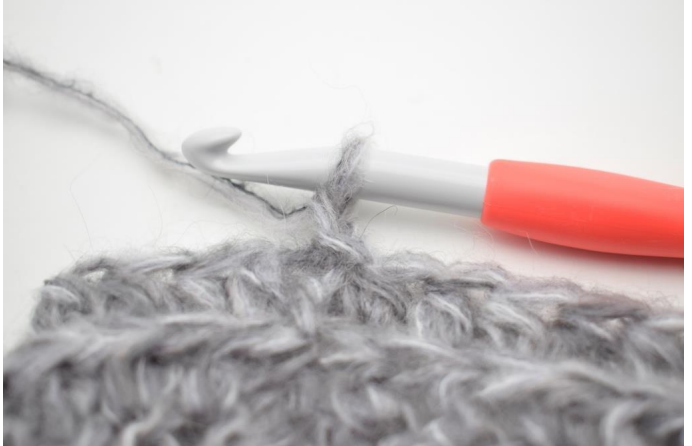
12. This round is worked as round 3. Ch1.