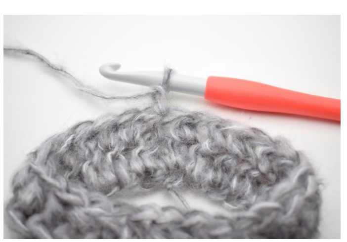
8. Turn piece.