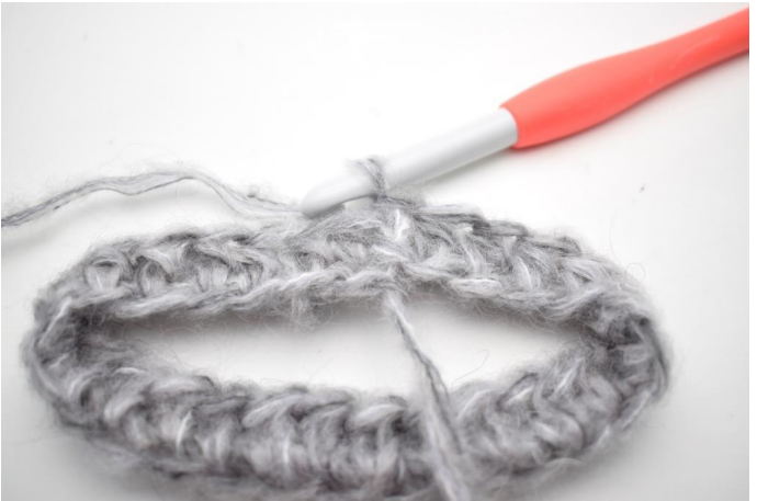
2. Ch1. Work hdc in the round in every ch. Finish with 1 sl st in first hdc. (125)

1. Ch125. Make a circle with 1 sl st in first ch.