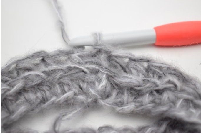
6. Work hdc tbl on entire round. Finish with 1 sl st in first hdc. (125)