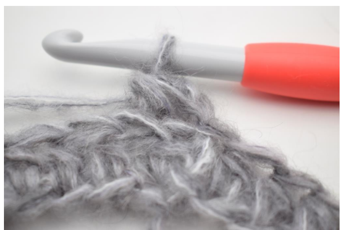
5. Like this.