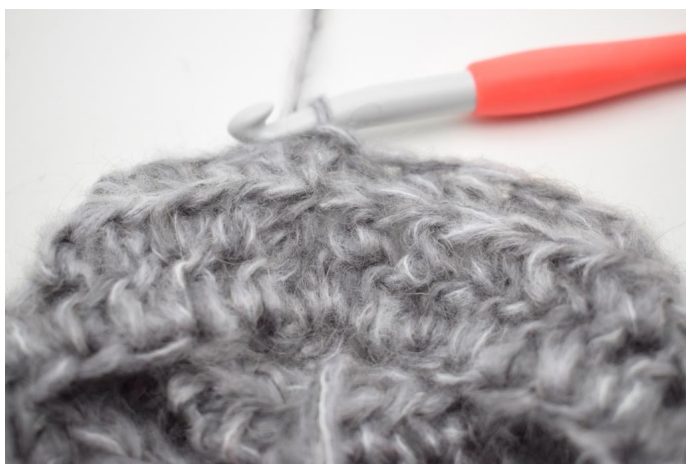
11. Work hdc tbl on entire round. Finish with 1 sl st in first hdc. (125)