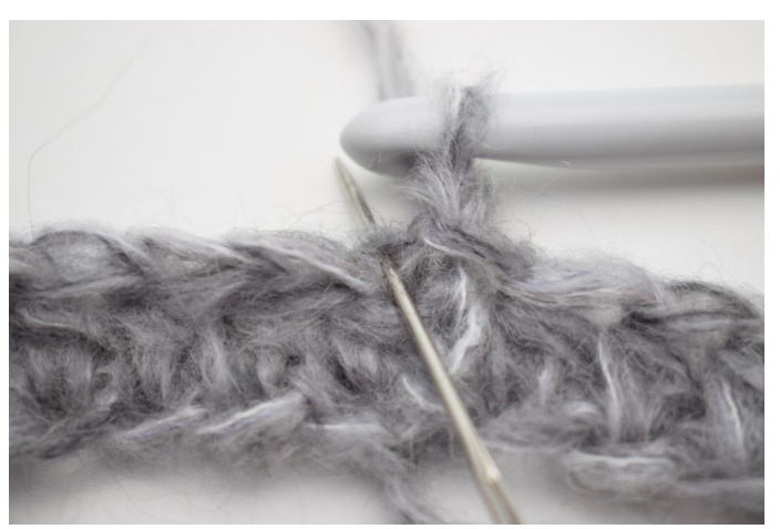
4. Work hdc tbl in first st. The needle shows in which loop you work in.