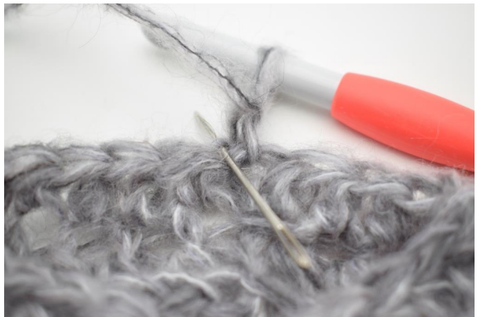
14. Work hdc in tbl in first st.