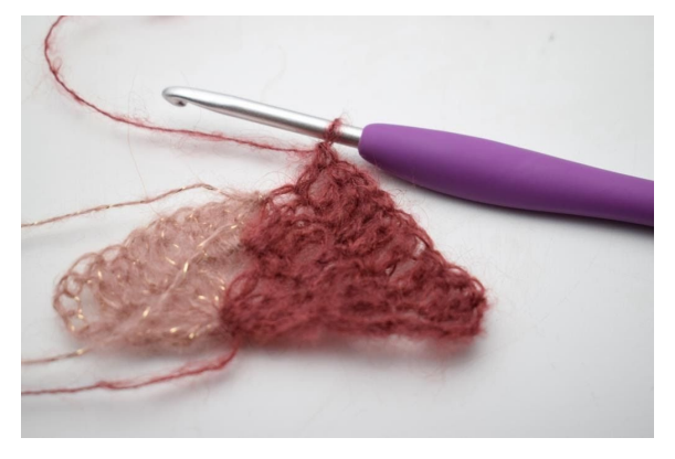
18. 1 dc in each of the next 7 sts.