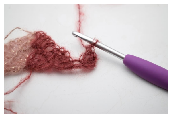
17. Like so.