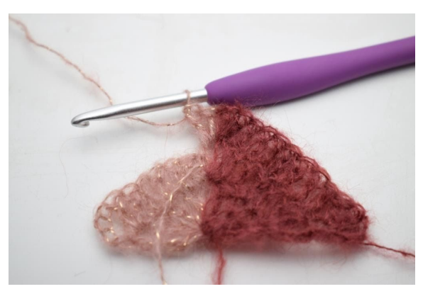
22. Like so.