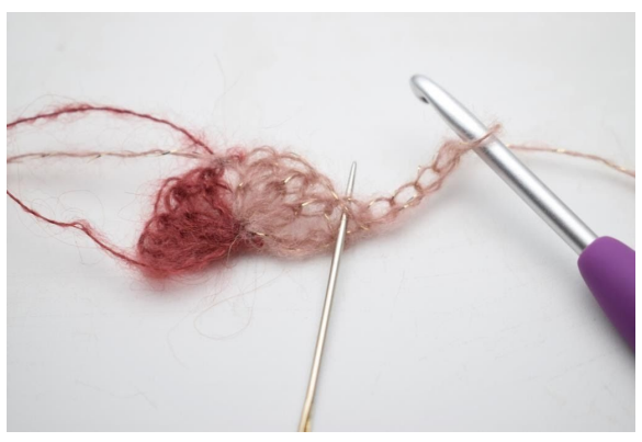
6. Work 2 dc in the first st.