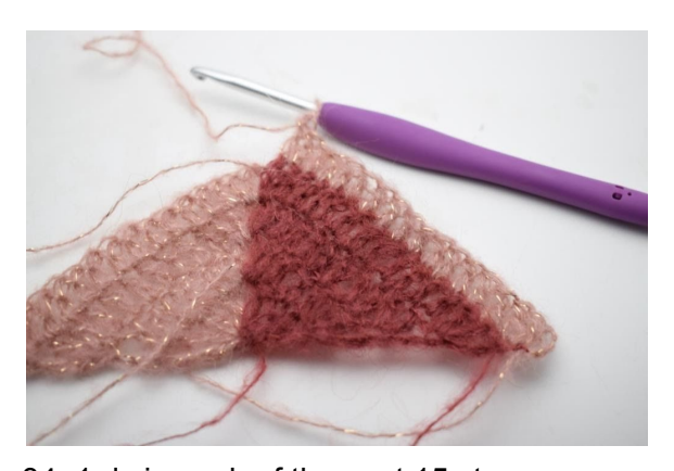
34. 1 dc in each of the next 15 sts.