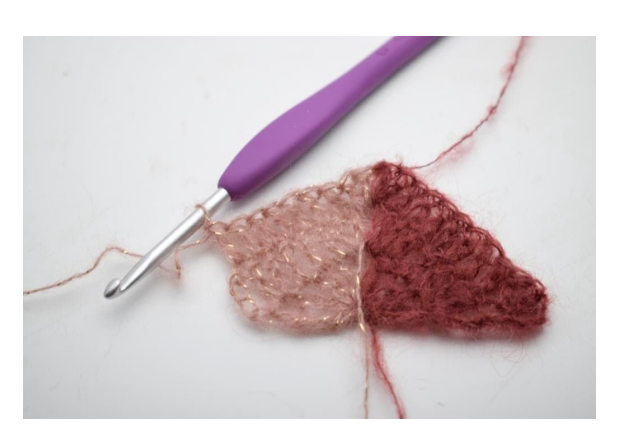
23. 1 dc in each of the next 7 sts.