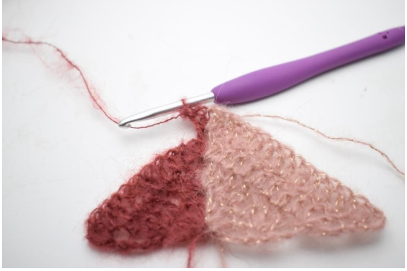
29. Switch to col. 1. Ch 1 and make another 2 dc into the ch-sp.