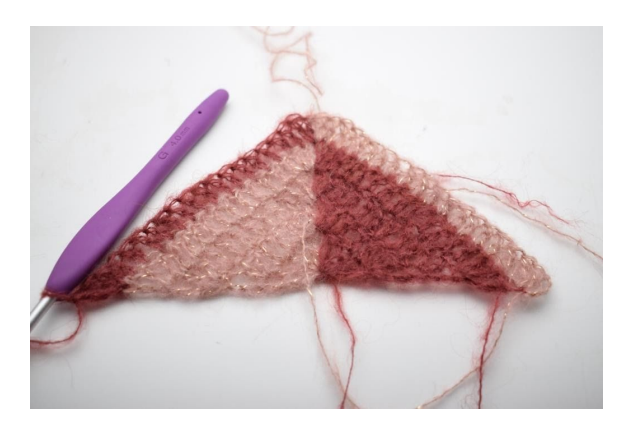
38. Make 2 dc and 1 tr in the last st.