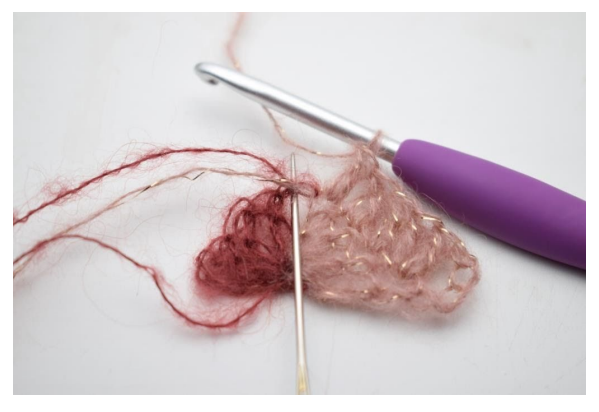
9. Make 2 dc and ch 1 in the ch-sp.