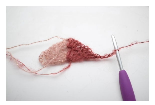
15. Turn and ch 4.