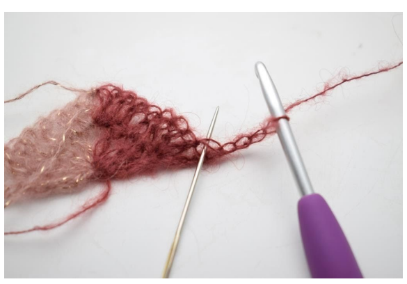
16. Work 2 dc in the first st.