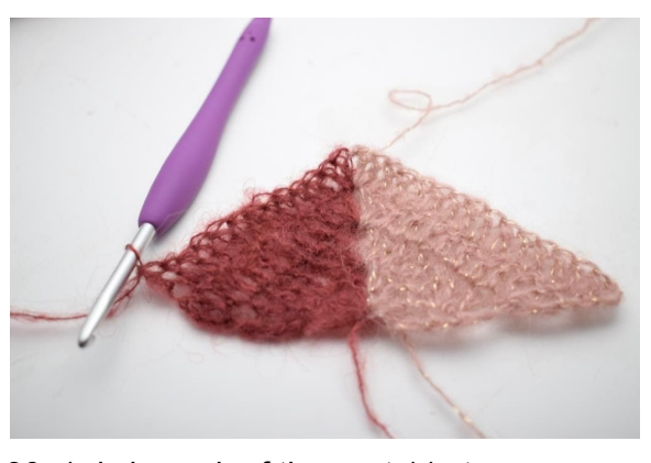
30. 1 dc in each of the next 11 sts.