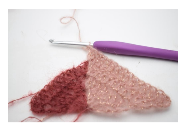
28. Make 2 dc and ch 1 in the ch-sp.