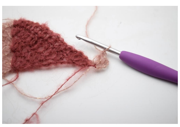
33. Switch to col. 2. Ch 4. Work 2 dc in the first st.