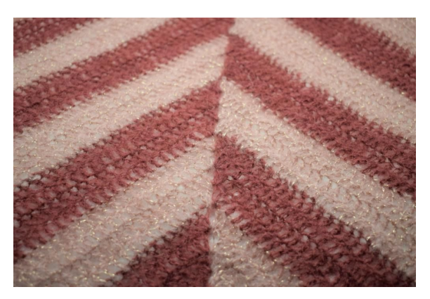
39. Repeat this method and the color changes, keeping the pattern of 4 rows of each color until you have 48 rows and 12 stripes in all. Cut the yarn and weave in ends.