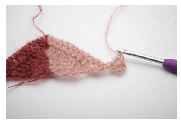
26. Turn and ch 4. Work 2 dc in the first st.