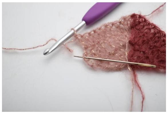
24. Make 2 dc and 1 tr in the last st.