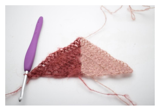
31. Make 2 dc and 1 tr in the last st.