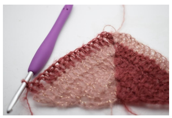
37. 1 dc in each of the next 15 sts.