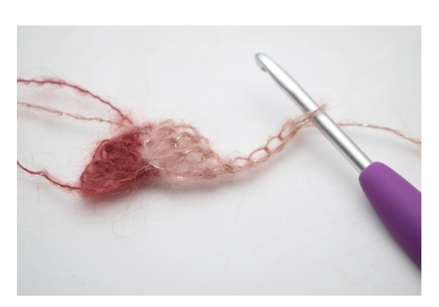
5. Turn and ch 4.