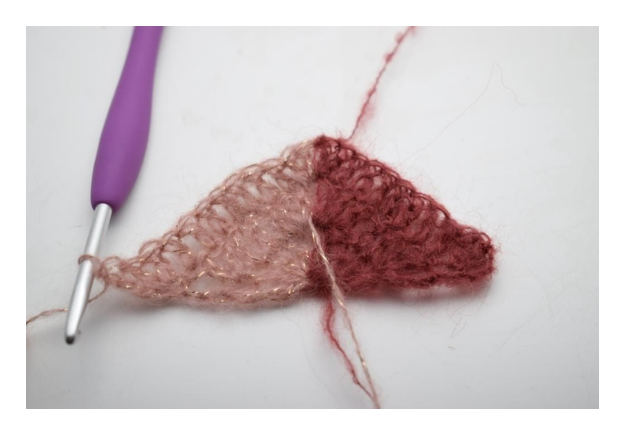
25. Like so.