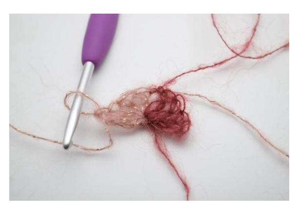
4. 3 dc and 1 tr into the ring.