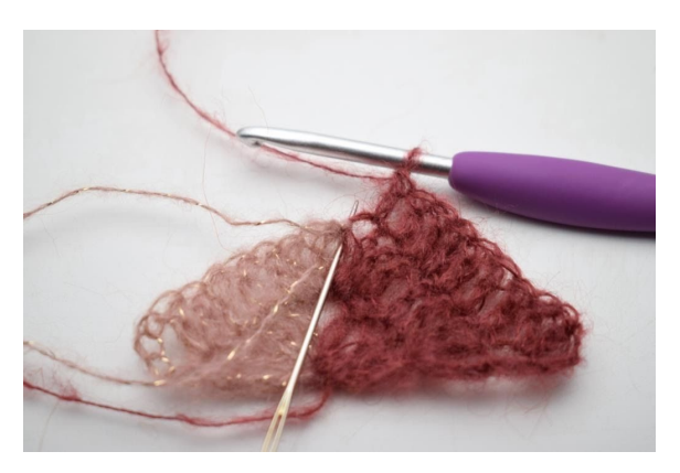
19. Make 2 dc and ch 1 in the ch-sp..