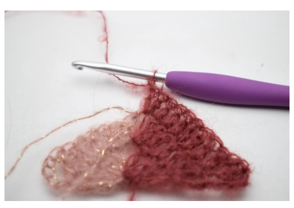
20. Like so.