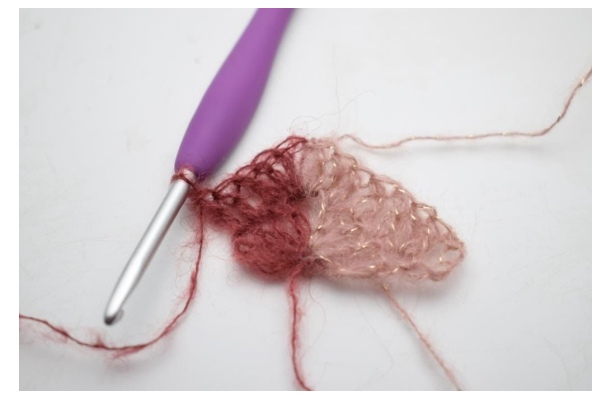
12. 1 dc in each of the next 3 sts.