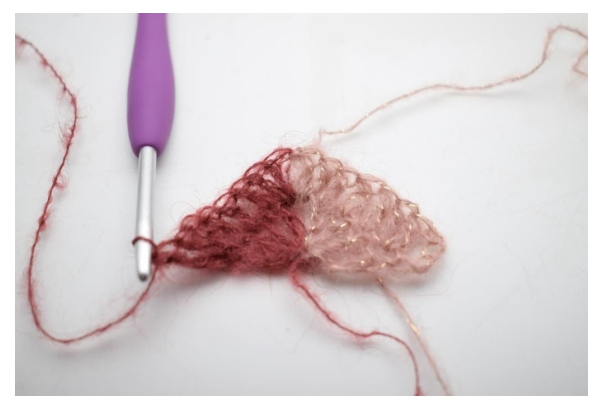
14. Like so.