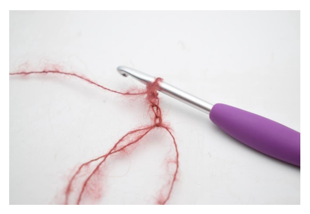
1. Using col. 1. Make a MR. Ch 4.