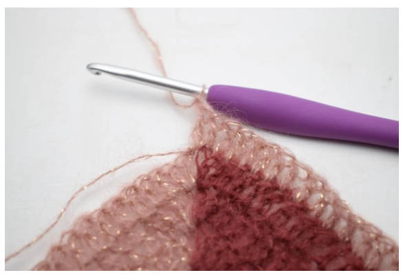
35. Make 2 dc and ch 1 in the ch-sp.