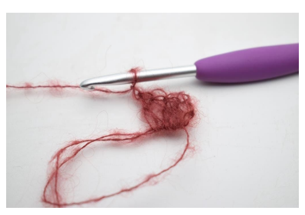
2., 3 dc into the ring and ch1.