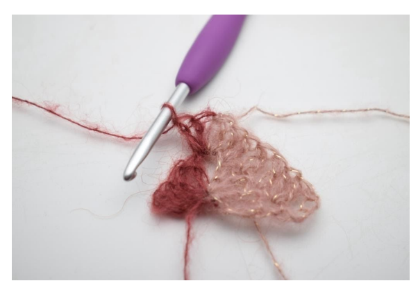
11. Switch to col. 1. Ch 1 and make another 2 dc into the ch-sp.