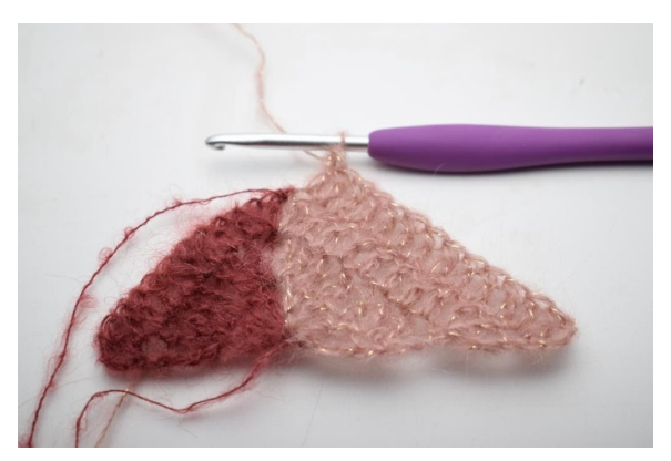
27. 1 dc in each of the next 11 sts.