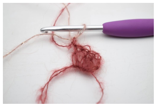
3. Switch to col. 2. Ch 1.