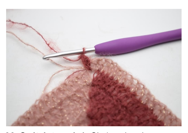
36. Switch to col. 1. Ch 1 and make another 2 dc into the ch-sp.