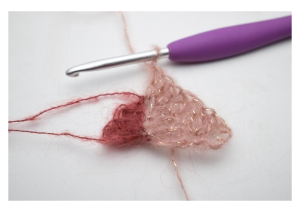
10. Like so.