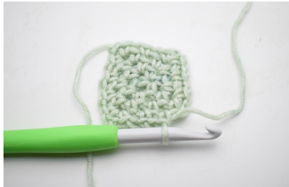
10. Repeat between ** 2 times in total.]