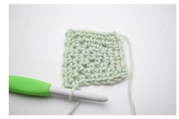
3. [Ch 1 and make 1 sc, ch 2, 1 sc into the next ch-sp.