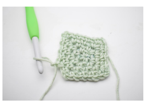
2. * Ch 1, sc into the next ch-sp *. Repeat between ** 3 times in total.

1. Sc into the first ch-sp. Ch 2 and sc into the same ch-sp.