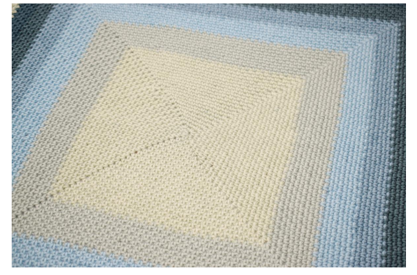
1. Continue in this manner until you have 75 \, 2. Like so. rounds, or the 2 skeins of yarn is used up. Cut the yarn and weave in ends.