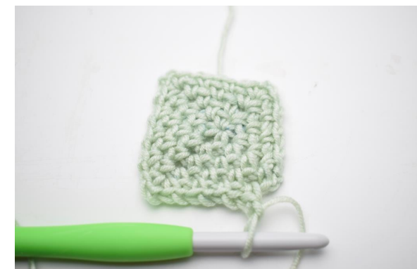
4. * Ch 1, sc into the next ch-sp *. Repeat between ** 3 times in total. ].