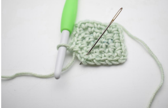
6. [ Ch 1 and make 1 sc, ch 2, 1 sc into the next ch-sp.

5. . Repeat between ** 2 times in total.