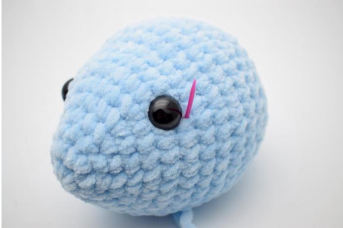
1. Pull the yarn up through the head, out on the outer side of the eye.