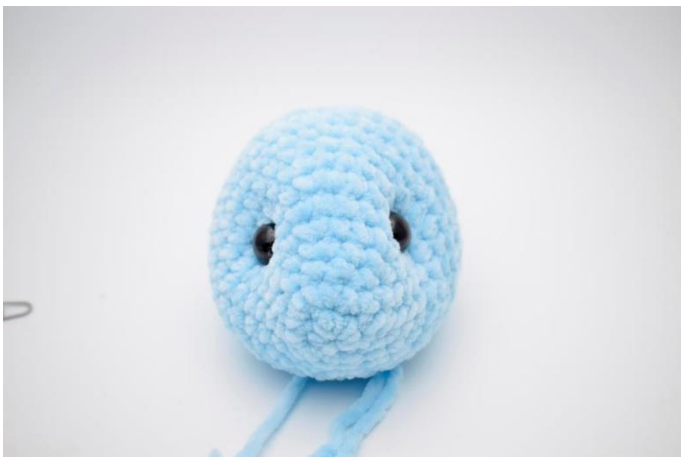
1. Pull and tug both yarn tails until the eyes are set as desired. Fasten the yarn.