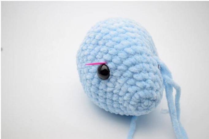
3. Pull the yarn through on one side of the eye.