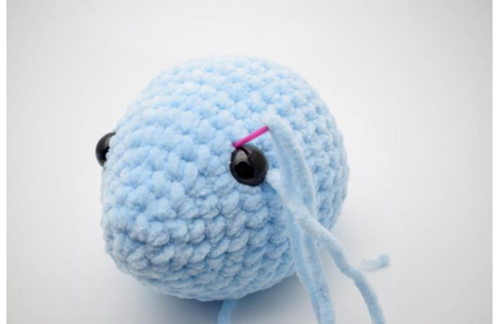
2. Poke the needle through the other side of the eye and towards the other eye through the head.