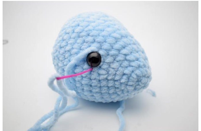
4. Poke the needle through the other side of the eye and down through the head.