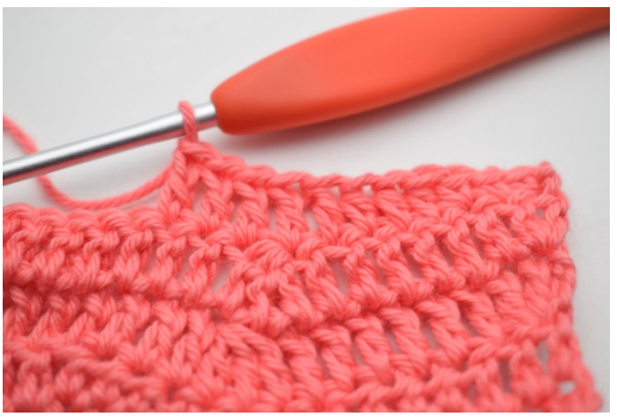
3. Dc in the next 5 sts.