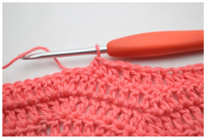
4. Hdc in the next 3 sts.