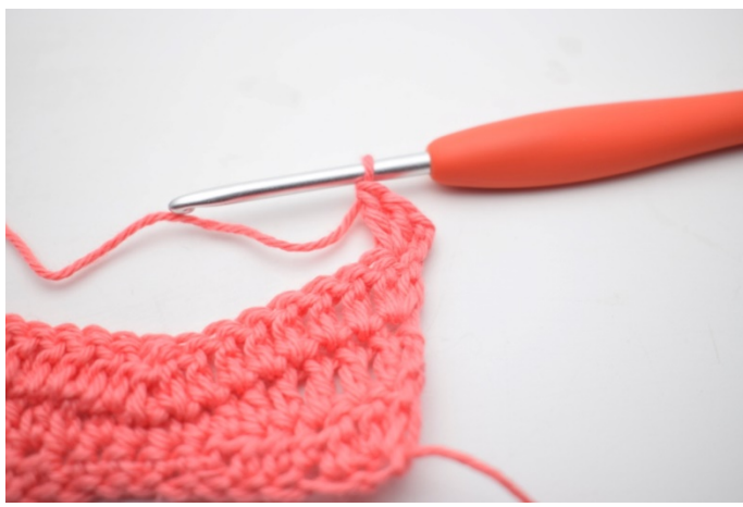
10. 2 dc in the first st.