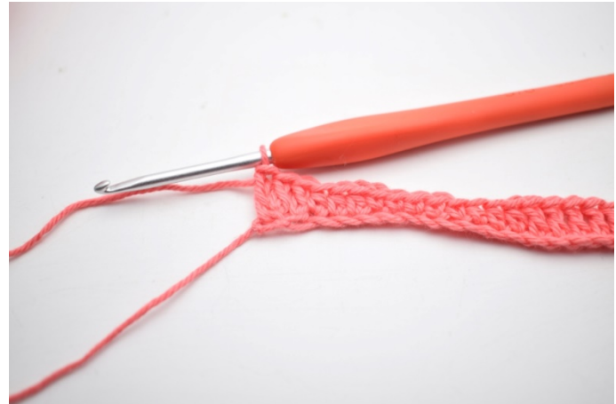
in the next 3 sts, dc in the next 5 sts *.