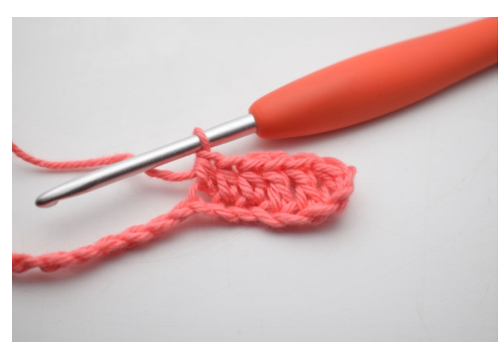
3. Hdc in the next 3 sts.