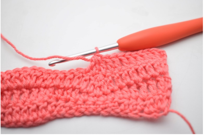
12. 3 dc tog.