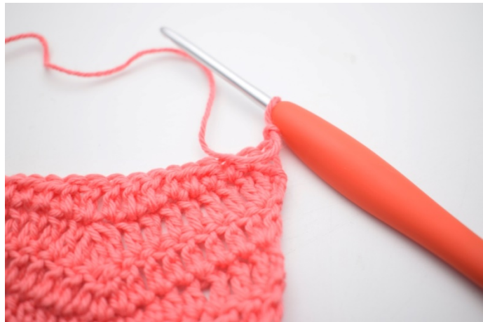
8. Now repeat the finishing row. Ch 1 and turn work.