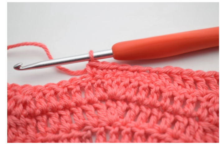
5. Sc in the next 5 sts.