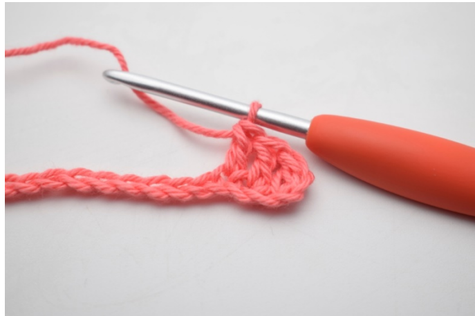
1. Start by making your foundation chain. Begin 2. 1 dc in each of the first 3 sts. your first row in the 3^{rd} st from the hook.