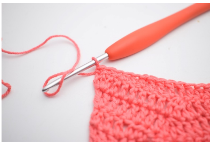
7. but end with 1 sc in each of the last 3 sts.