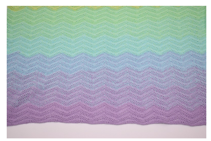
Repeat the pattern row until you have 90 rows in total.