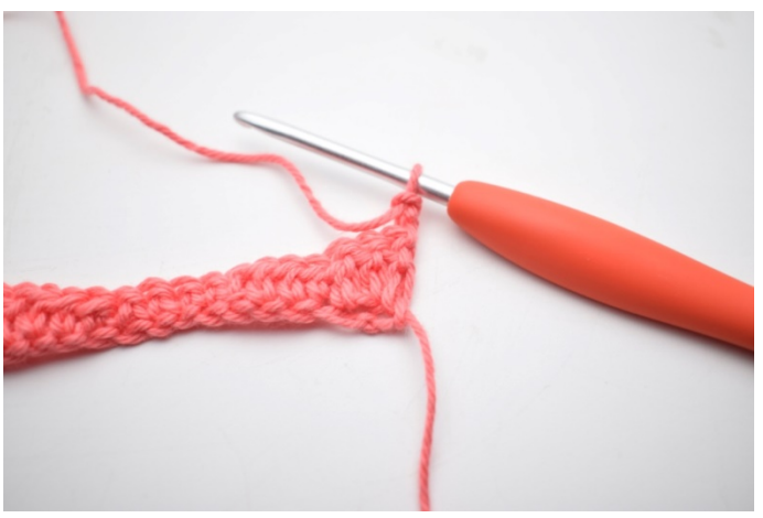
9. Ch 2 and turn work.