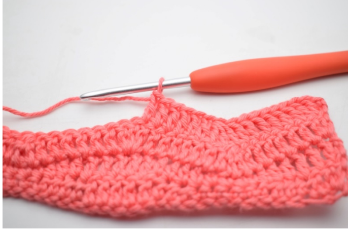
13. Dc in the next 6 sts.