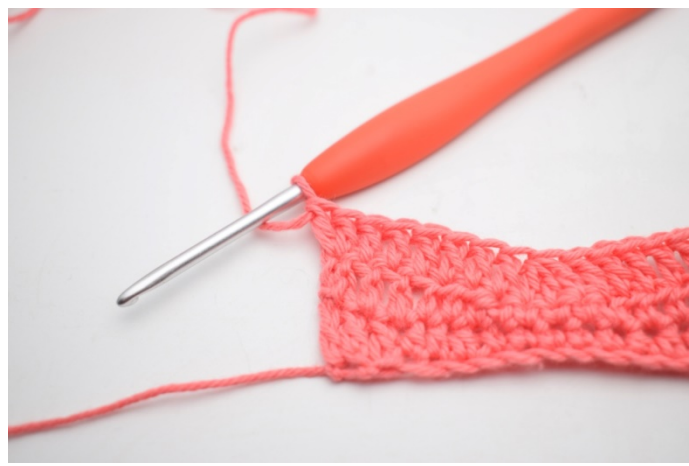
7. * dc in the next 6 sts, 3 dc tog, dc in the next 6 8. Like so. sts, 3 dc in the next st *. Repeat between **, but with only 2dc in the last st..