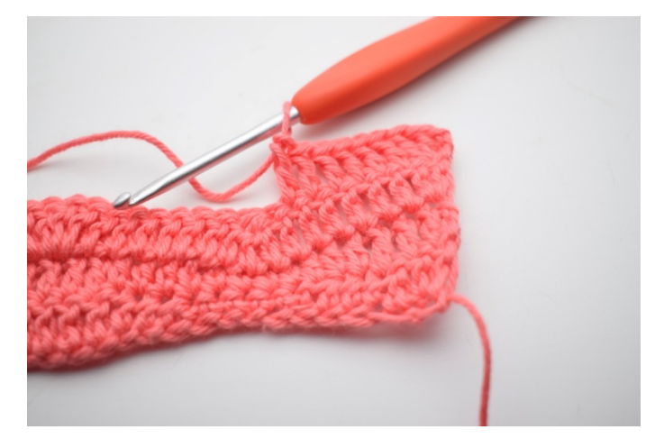
11. Dc in the next 6 sts.