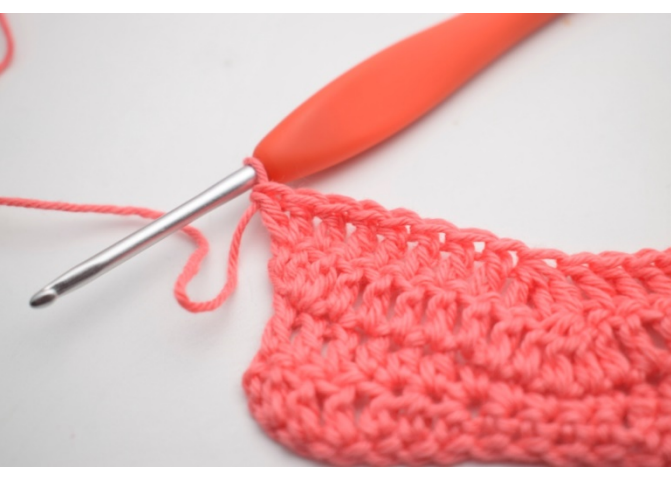
15. * dc in the next 6 sts, 3 dc tog, dc in the next 6 sts, 3 dc in the next st *. Repeat between **, but with only 2dc in the last st..