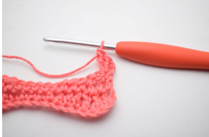
1. Ch 2 and turn work. Make 2 dc in the first st.