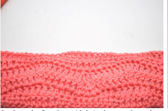
9. Sc in the first 3 sts. * hdc in the next 3 sts, dc in the next 5 sts, hdc in the next 3 sts, sc in the next 5 sts *. Repeat between ** until the end of row, but end with 1 sc in each of the last 3 sts. Cut yarn and weave in ends