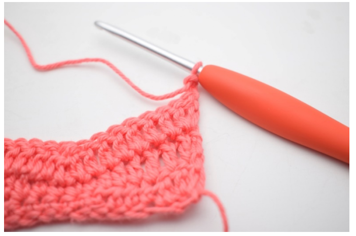
9. Repeat the 3<sup>rd</sup> row.