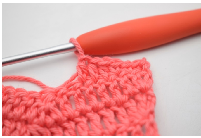
2. Hdc in the next 3 sts.