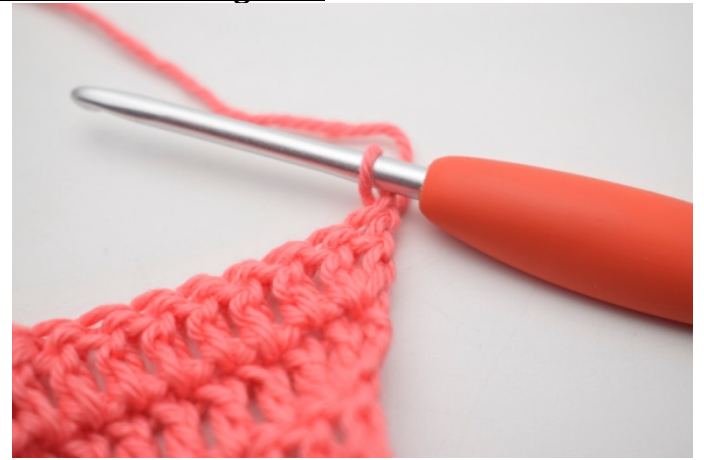
1. Ch 1 and turn work. Sc in the first 3 sts.