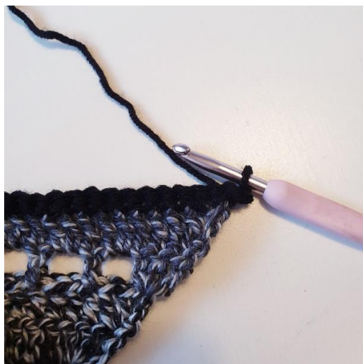
1 round of sc