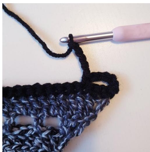
[ch 5, skip 3 sts, 1 sc in next st]