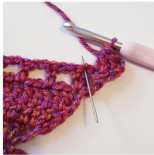
1 dc in the next 2 sts,