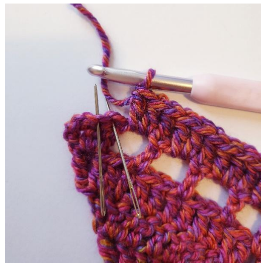
1 dc in last 2 sts