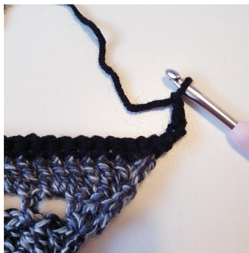
Round 1: ch 5,