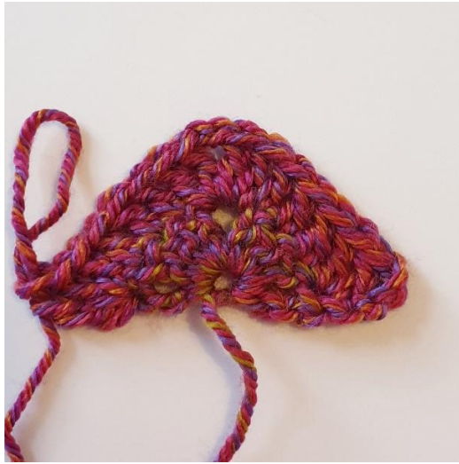
After round 2