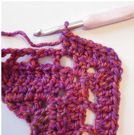
1 dc in next st