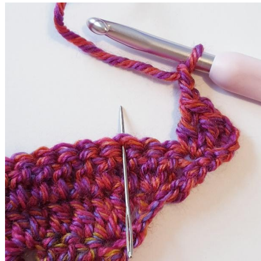
[ch 2, skip 2 sts,