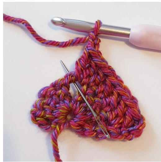
[2 dc, ch 2, 2 dc] in the tip