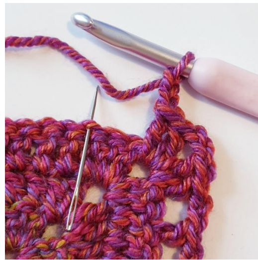
ch 2, skip 2 sts