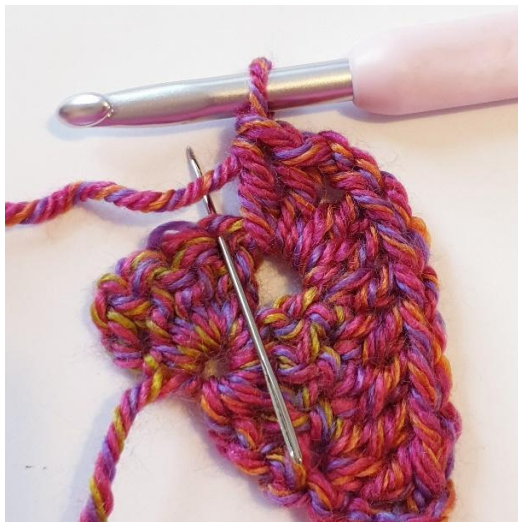
1 dc in the next 3 sts