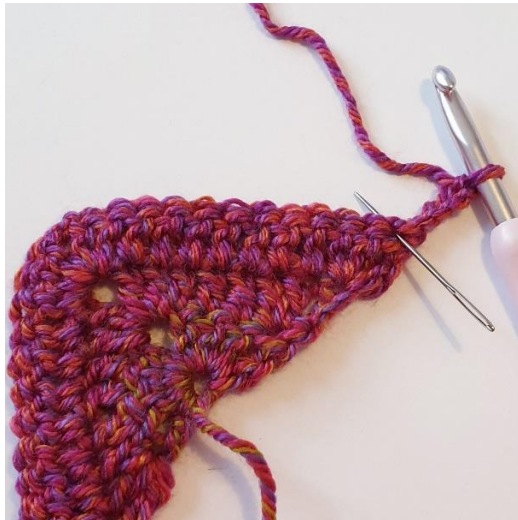
Round 4: 2 dc in first st