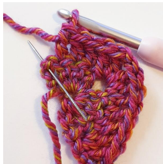
[2 dc, 1 tr] in tch