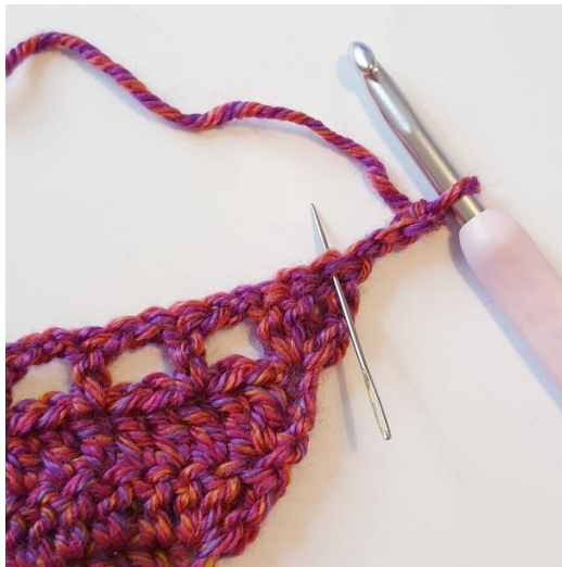
Round 5: 2 dc in first st