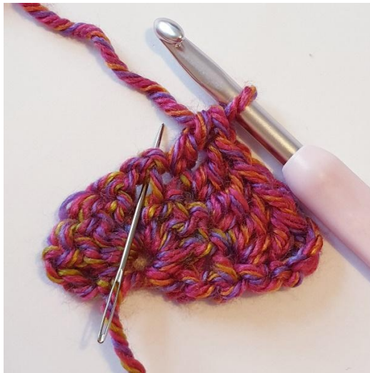
1 dc in the next 3 sts