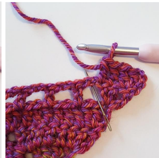
2 dc in the the ch-space