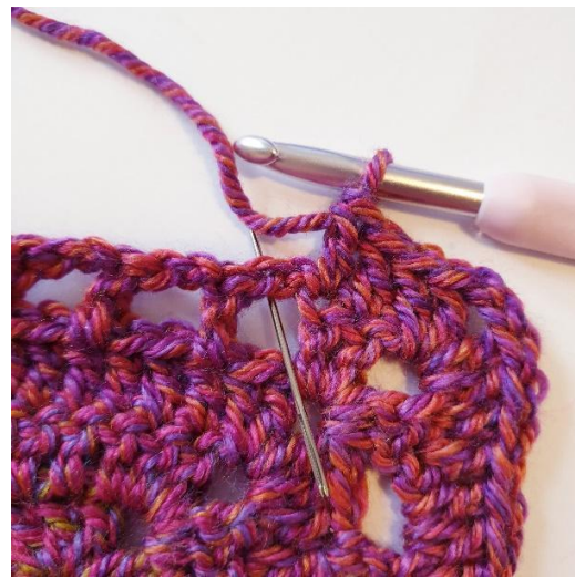
2 dc in the ch-space