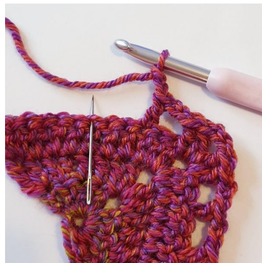
ch 2, skip 2 sts