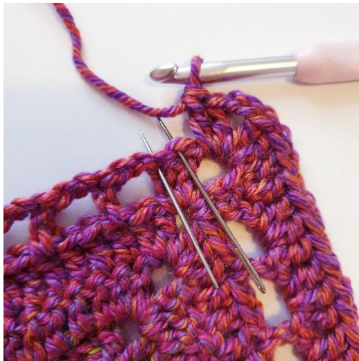
1 dc in the next 2 sts