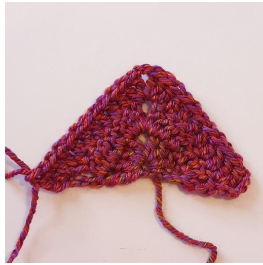
After round 3