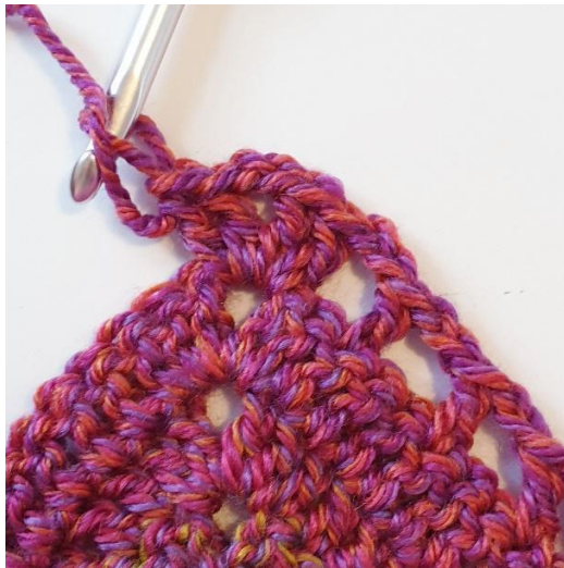
[2 dc, ch 2, 2 dc] in the tip