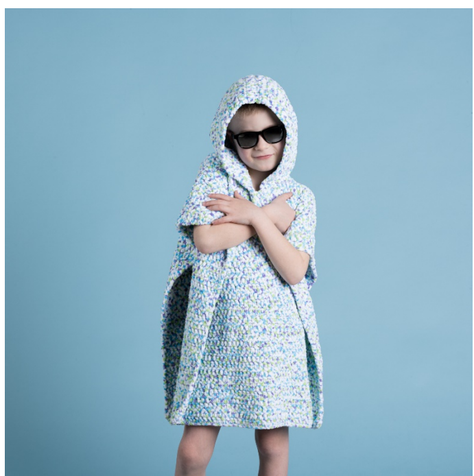
Have fun ☺ Best Regards, Hobbii.com