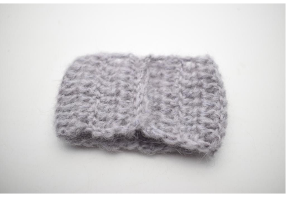
4. Cut the yarn and weave in the ends. Fold it, so you have the adjoining bit in the middle of the bow. This is the back.