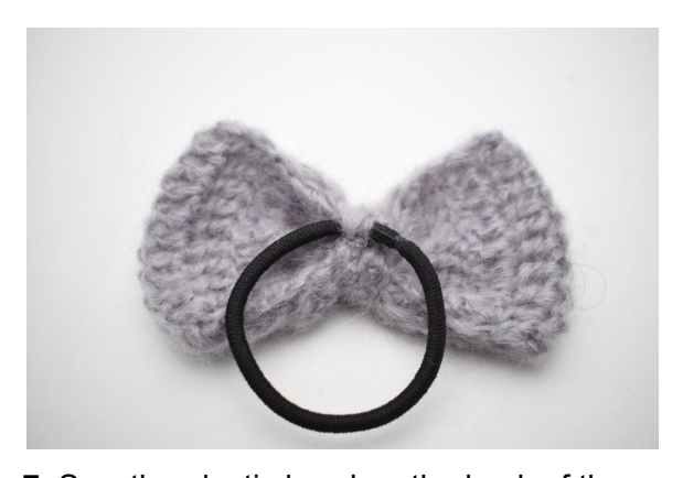
7. Sew the elastic band on the back of the bow.