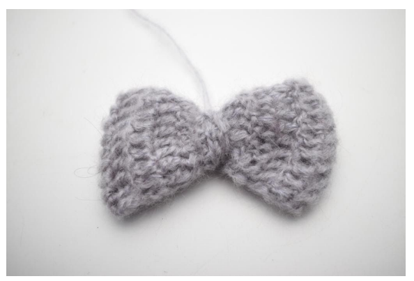
6. Fold the middle piece around the middle, so a new 'bow' is formed, sew it on.