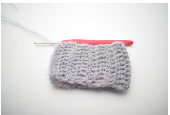
2. Fold your work in half.