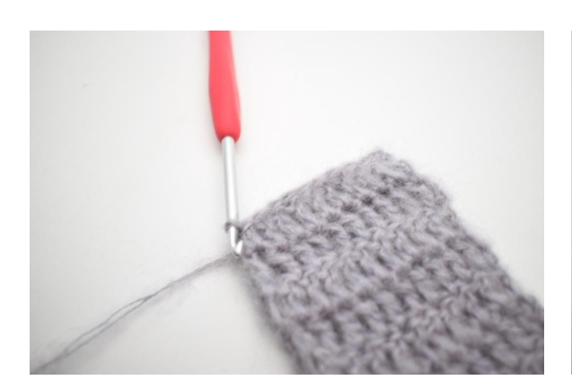
3. Crochet the ends together with sl sts.