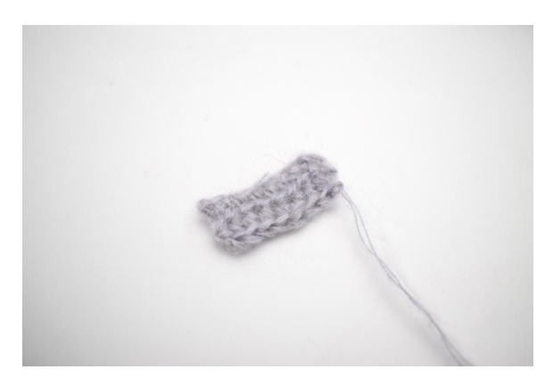
5. Crochet the middle piece.