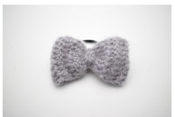
8. Like this.