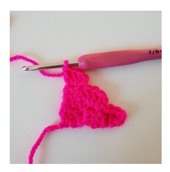
5. Make a sl st into the pixel beside it. Ch 2. Work 3 dc into the ch-sp you made your sl st into. You now have 3 pixels and row 3 is done.