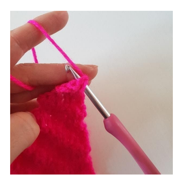
1. Instead of ch 5 at the end of the row, make 3 sl sts along the edge of the last pixel.