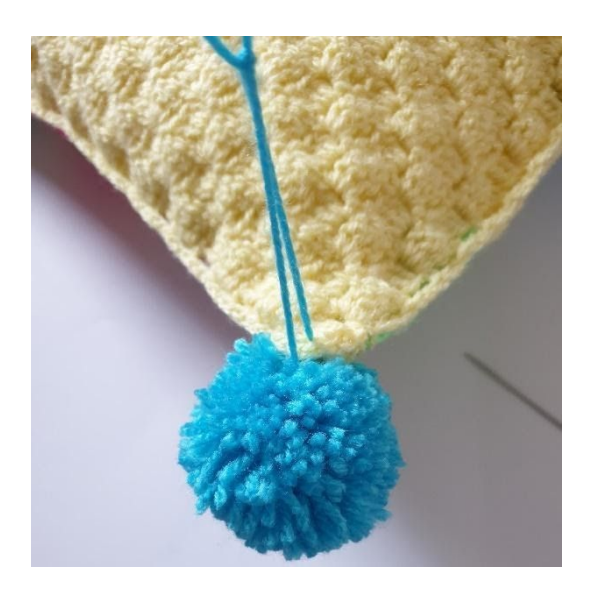
Sew a pom-pom to each corner of the pillow.