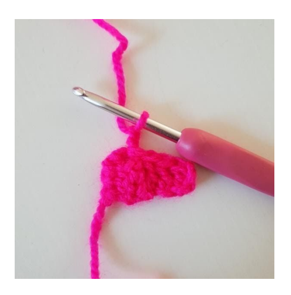
5. Ch 2 (takes the place of the 1st dc)