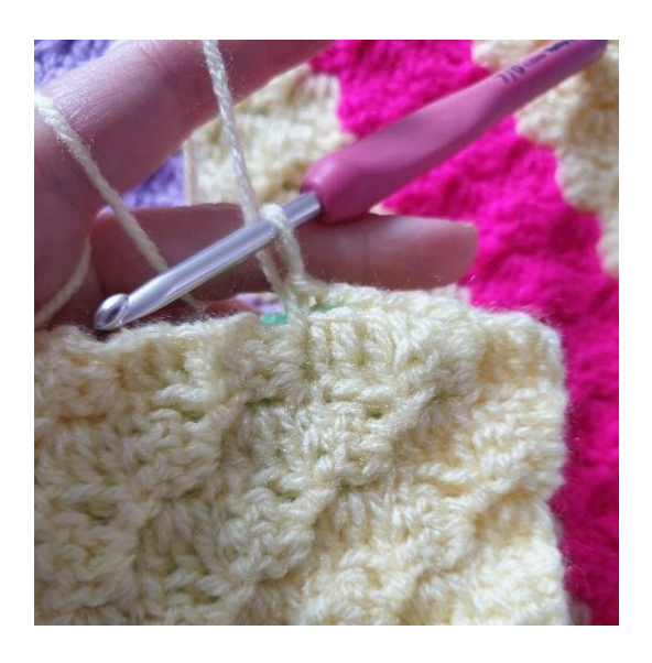
4. Make a sl st between the next 2 pixels.