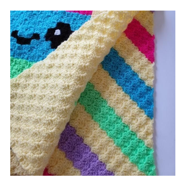
1. Lay the two pieces on top of each other, wrong sides together.