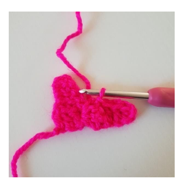
3. Make 1 sl st into the corner of the pixel below.