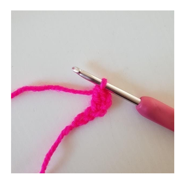
2. Make 1 dc in the 3rd ch from the hook.