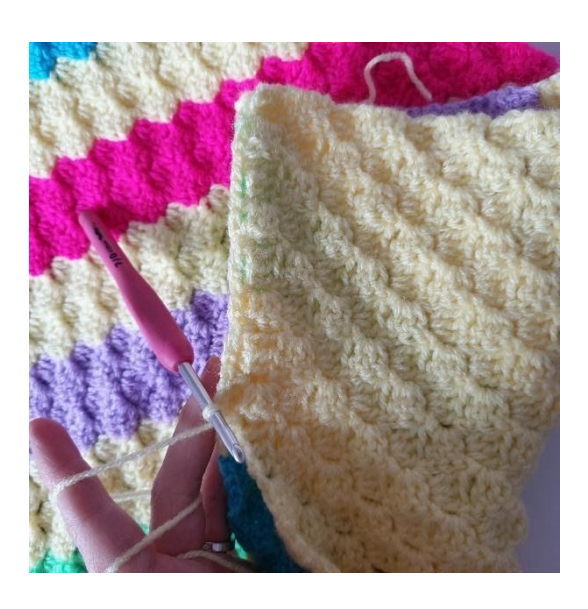
6. Make 1 sc in the corner. Continue with ch 2, sl st all around the pillowcase.