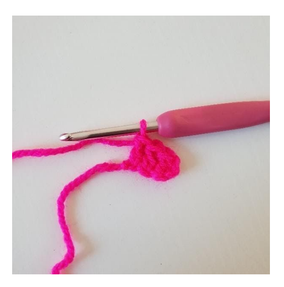
3. Make 1 dc in each of the next 2 sts. You have now made your first pixel/square.