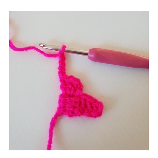
1. Ch 5.