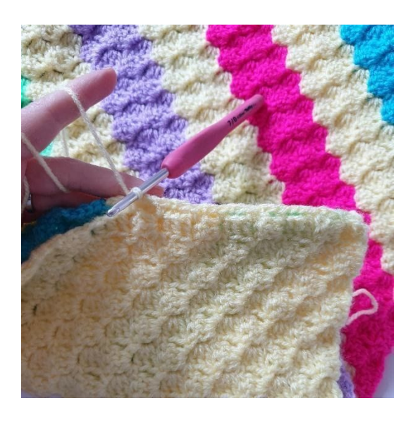
5. Repeat this pattern of ch 2, sl st between pixels.