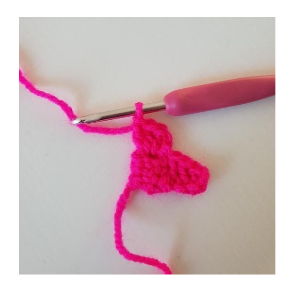
6. Make 3 dc around the ch-sp you just made your sl st into. You now have 2 pixels on the second row.