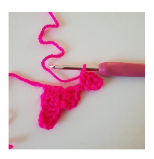
2. Make 1 dc in the 3rd st from the hook and then 1 dc in each of the next 2 sts.