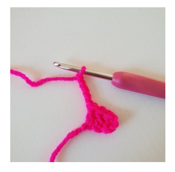
1. Ch 5.