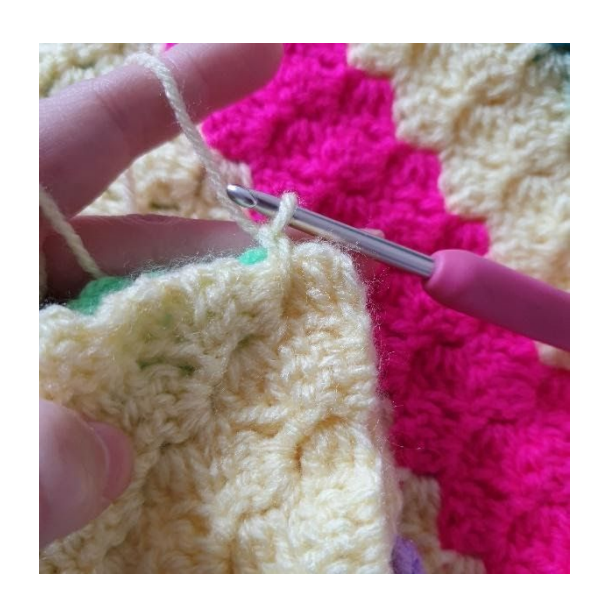
2. Pull the yarn up between 2 pixels.