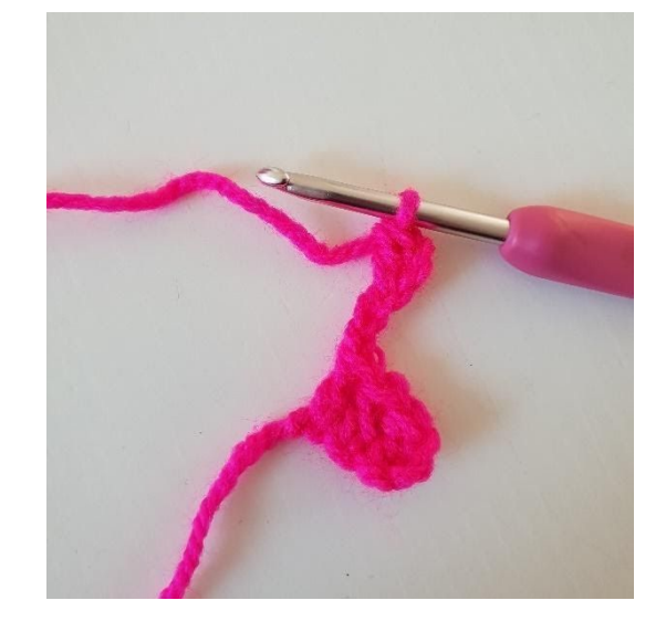
2. Make 1 dc in the 3rd ch from the hook.