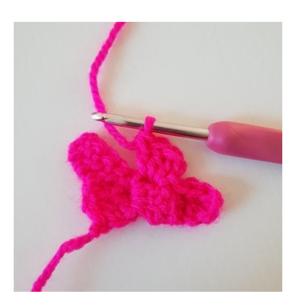
4. Ch 2 and make 3 dc into the ch-sp you made your sl st into.