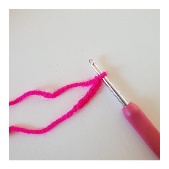
1. Begin with ch 5.