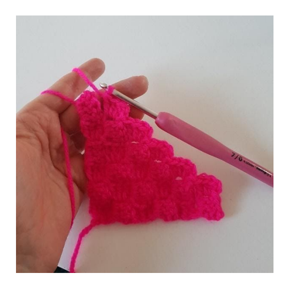
3. Here, you can see how you decrease at the end of a row by connecting the pixels with a sl st.