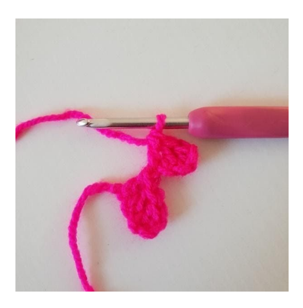
3. Make 1 dc in each of the next 2 sts. You have now made your next pixel/square.