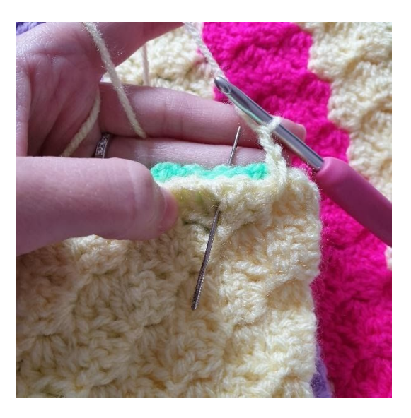
3. Ch 2.