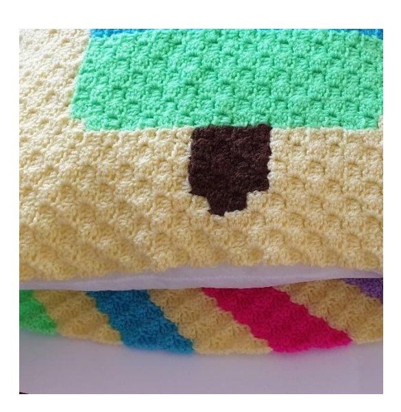
7. Place the pillow into the pillowcase. Continue closing up the seam of the pillowcase and end with a sl st.