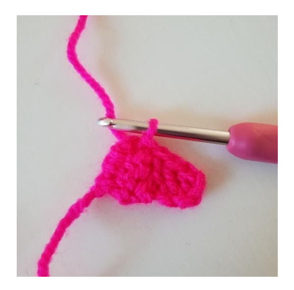
4. Now, the pixel is connected to the first one. Do this by turning the pixel and making 1 sl st into the left corner of the first pixel. The picture shows the connected pixels.