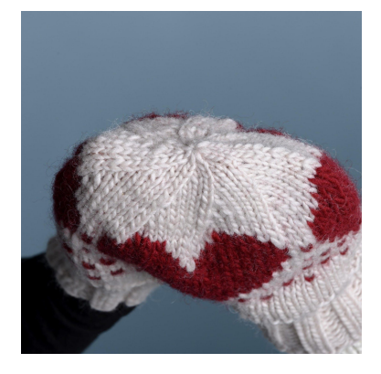
Have fun making this pattern!