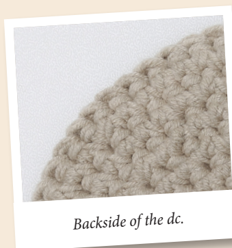
Backside of the dc.

Our backpack is crocheted from a solid bottom, and there is the back of the dc, which becomes our front.