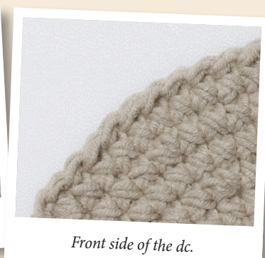
Front side of the dc.