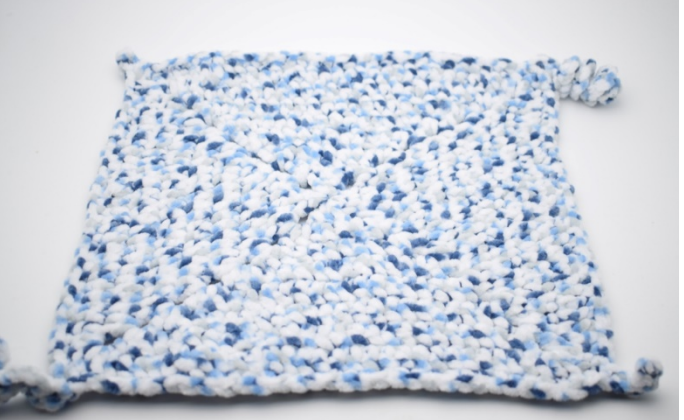
39. Cut the yarn and weave in the ends.