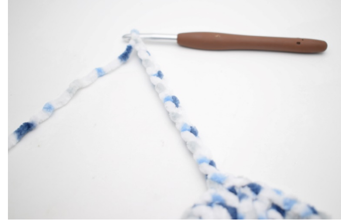
30. Ch15, 1 dc in the 3rd ch from the hook, 1 dc in the last 12 ch.