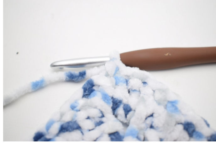
26. Ch1, 1 sc in the first st.