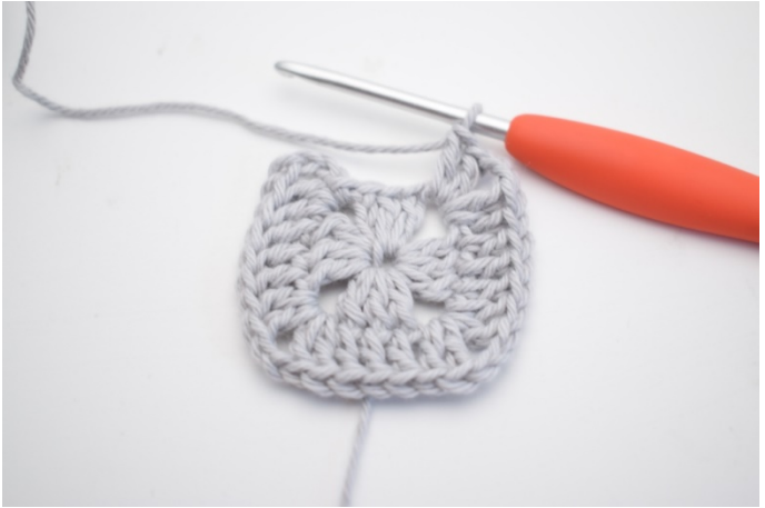
8. Repeat * to * 3 times in total.