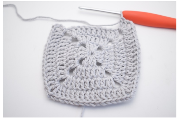
18. Repeat * to * 3 times in total.