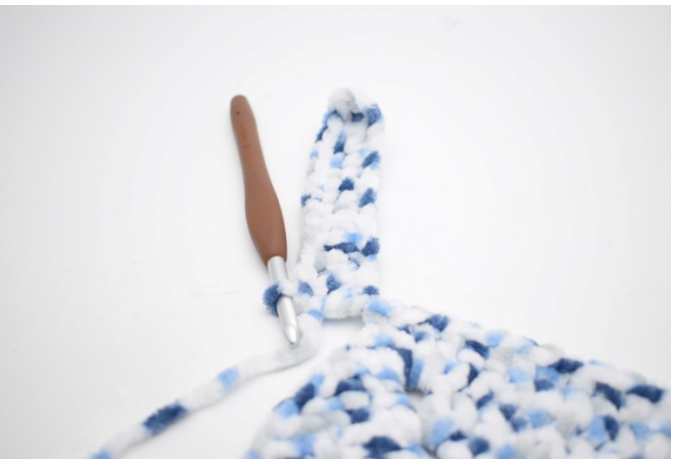
31. Like this.