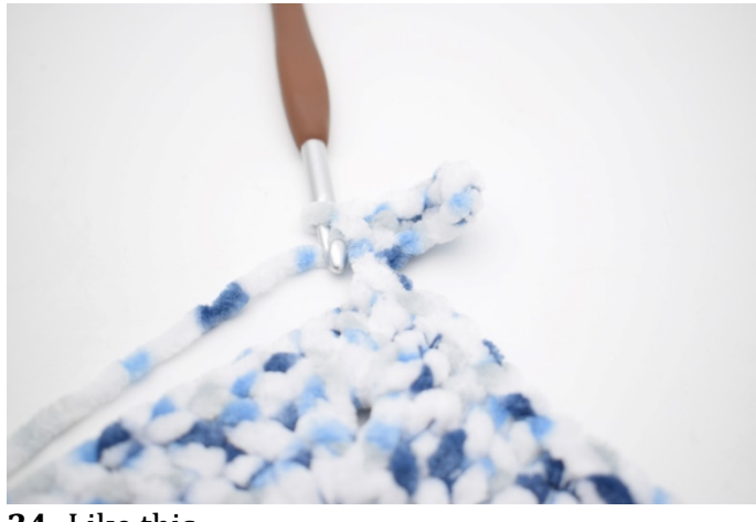
34. Like this.

33. Ch6, 1 sc in the 2nd ch from the hook, 1 sc in the last 4 ch.