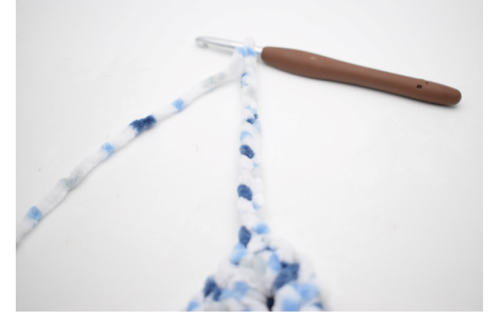
36. Ch15, 3 sc in the 2nd ch from the hook, 3 sc in each of the last 12 ch.