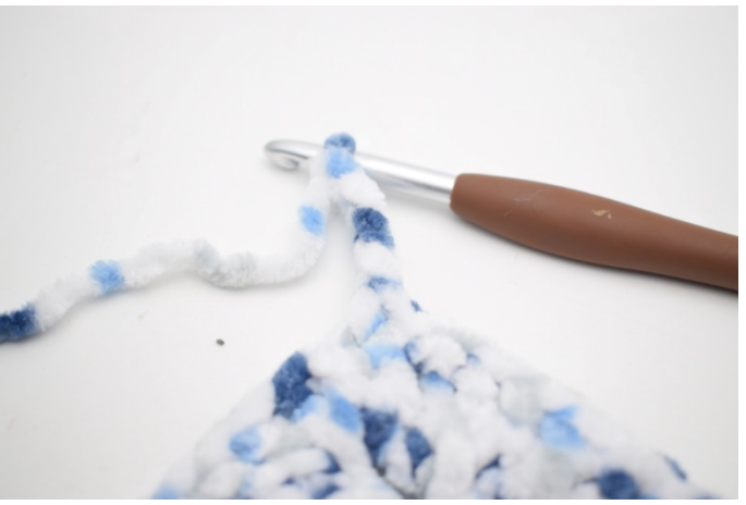
27. Ch4, 1 sc in the 2nd ch from the hook, 1 sc in the last 2 ch.