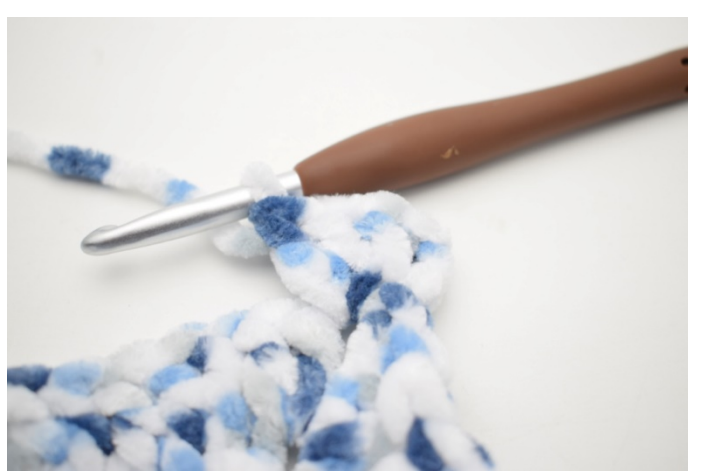
22. 3 dc in the ch-sp.