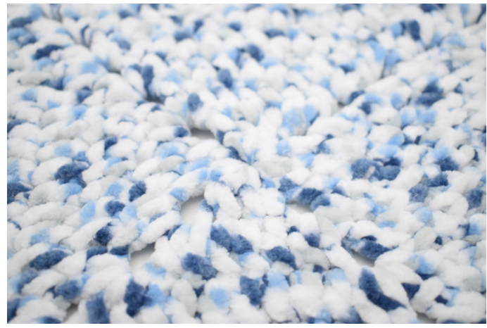
20. Repeat this procedure until you have 7 rounds in total.