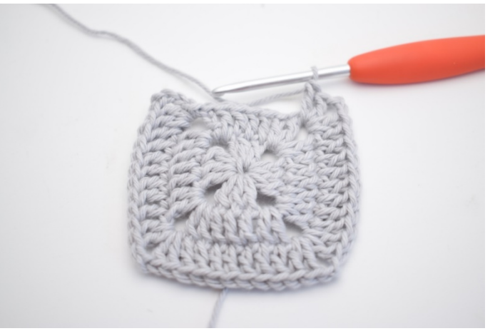
12. *1 dc in the next 7 st, 2 dc, ch2, 2 dc in the 13. Repeat * to * 3 times in total.