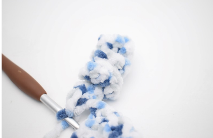
37. Like this.