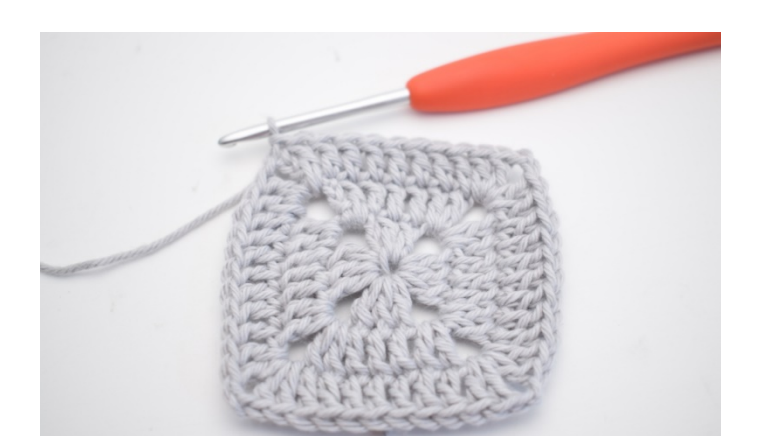
14. 1 dc in the next 7 st, 1 dc in the ch-sp from the start of the round, 1 sl st in the 3rd ch.