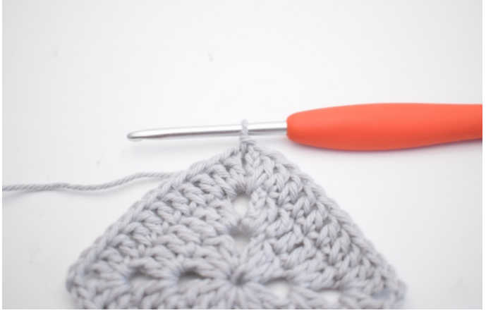
15. 1 sl st in the ch-sp.