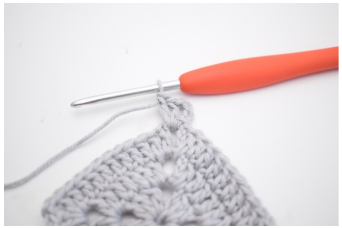
16. Ch4, 2 dc in the ch-sp.

Hobbii.com - Copyright \ensuremath{\textcircled{O}} 2020 - All rights reserved.