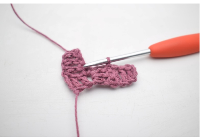
Ch 3 (replaces 1 dc). Work 3 dc into the same hole you worked your sl st. Sl st into the 2nd square of the previous row. The second square of the third row is now done.