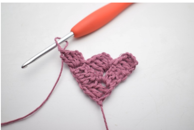
Repeat these rows until you have 111 squares.