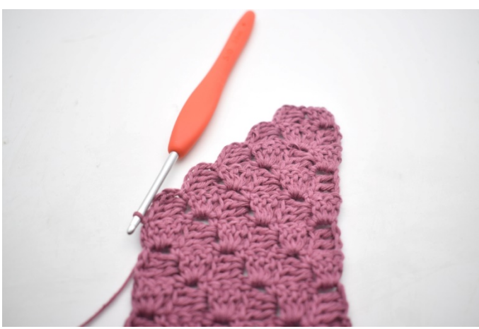
Repeat the decrease rows until you have 1 square left. Cut the yarn and weave in ends.