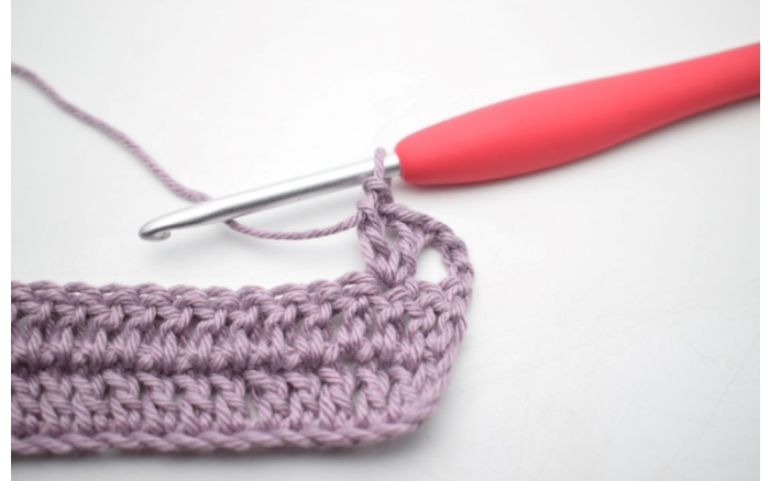
11. Like this.