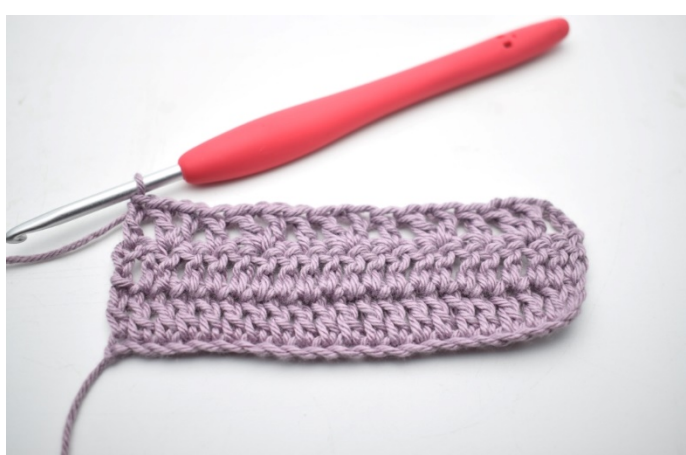
18. Repeat steps 10-12 to the end of the row.