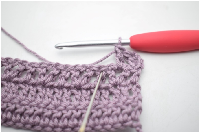
24. Skip 1 st, 1 dc, ch1 and 1 dc in the next st,