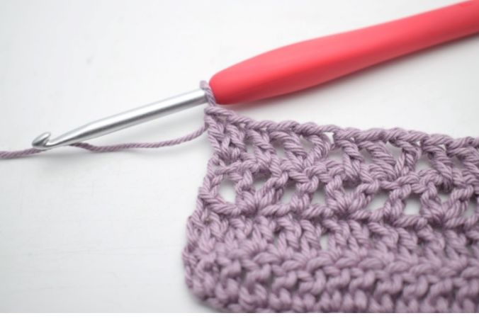
34. Like this.