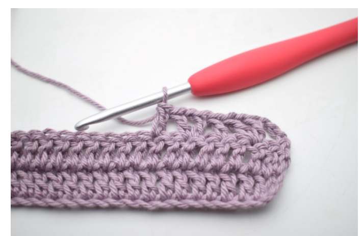
17. Like this.