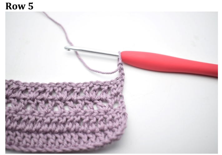
35. Turn, ch3.