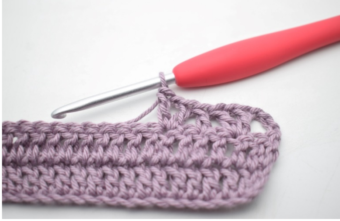
15. Like this.