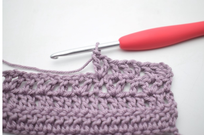
29. Like this.