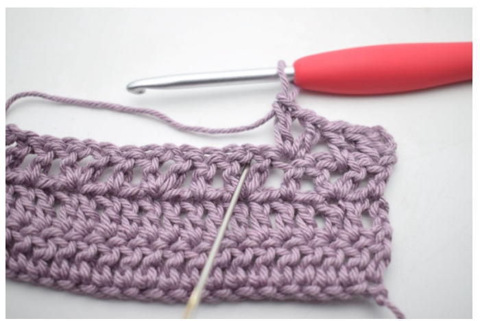
26. Skip 1 st, 1 dc in the ch-sp.