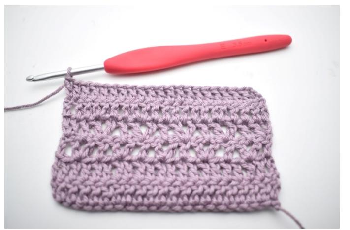
38.1 dc until the end of the row. (69)