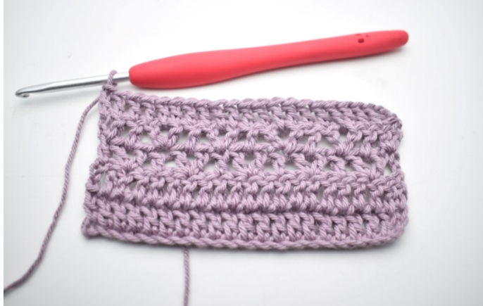
36. 1 dc in each st and ch-sp throughout the row.(69)