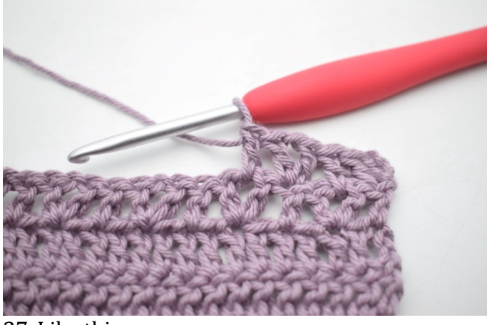
27. Like this.