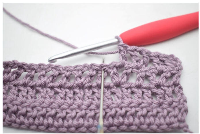
28. Skip 1 st, 1 dc, ch1 and 1 dc in the next st.