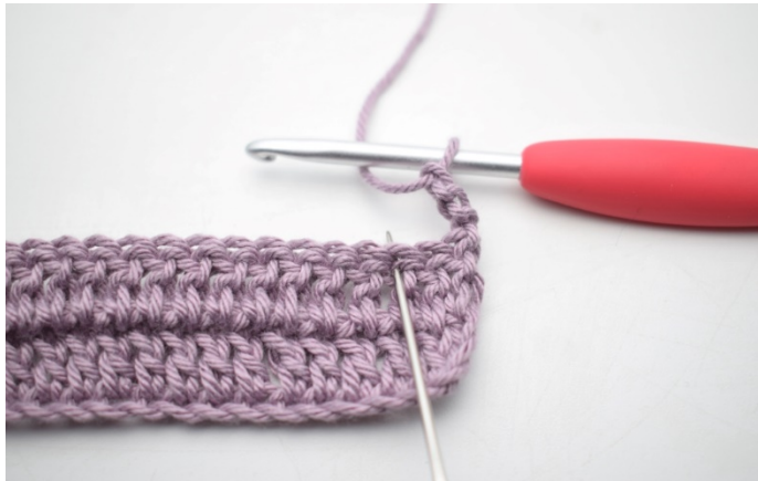
9. Turn, ch3.