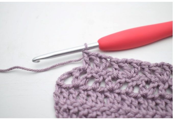
32. Like this.