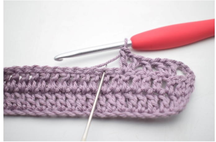
16. Skip 1 st, 1 dc in the next st.