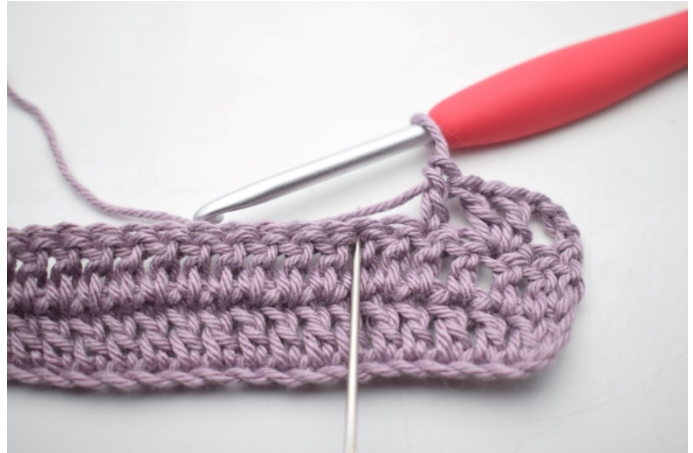
14. Skip 1 st, 1 dc, ch1 and 1 dc in the next st.