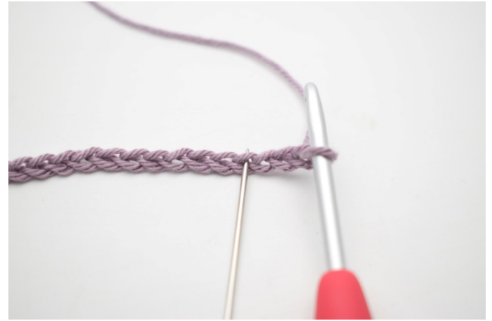
2. 1 dc in the 4th ch from the hook.