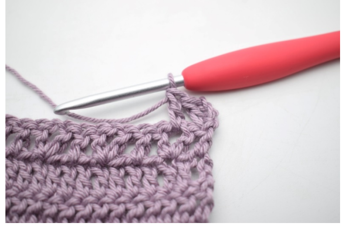
23. Like this.