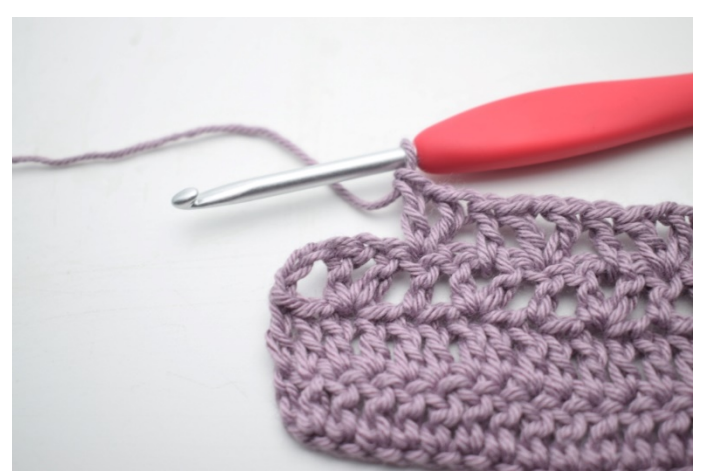
30. Repeat steps 26-28 until there are 3 st left.