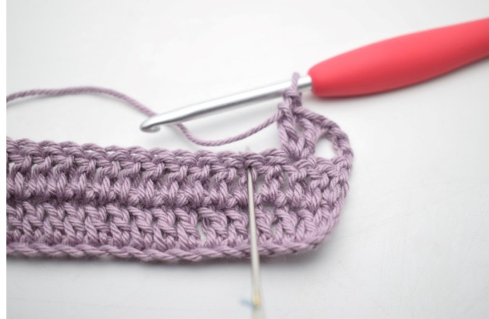
12. Skip 1 st, 1 dc in the next st.