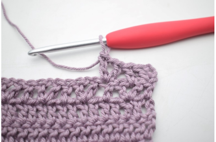
25. Like this.