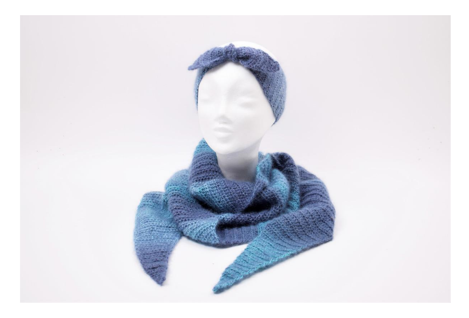
Happy crocheting ⊚ Love Hobbii.com