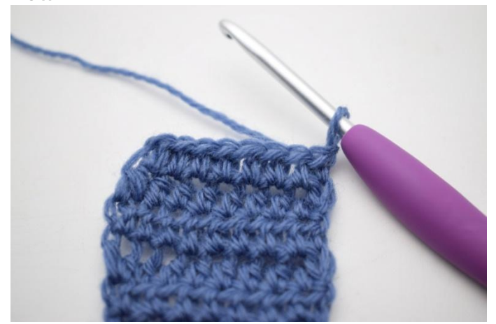
1. Turn by chaining 1.