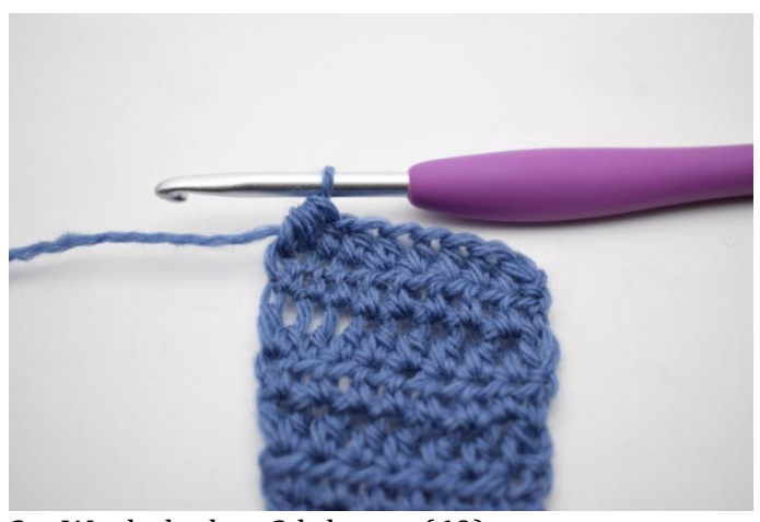
3. Work the last 2 hdc tog. (69)