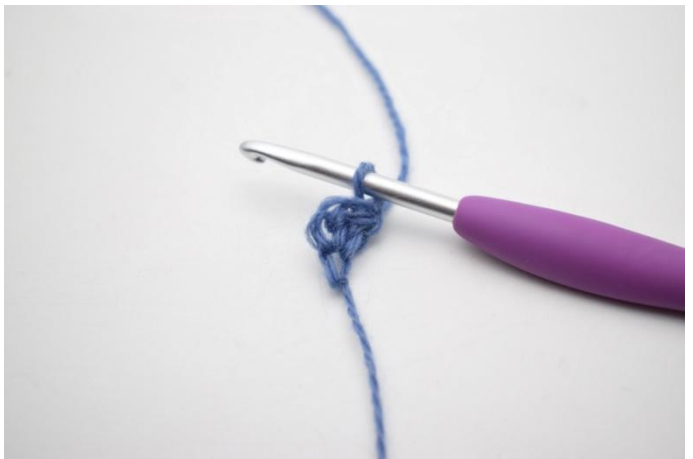
1. Turn by chaining 1.