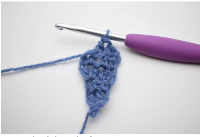
2. Work 1 hdc in the first 2 sts.