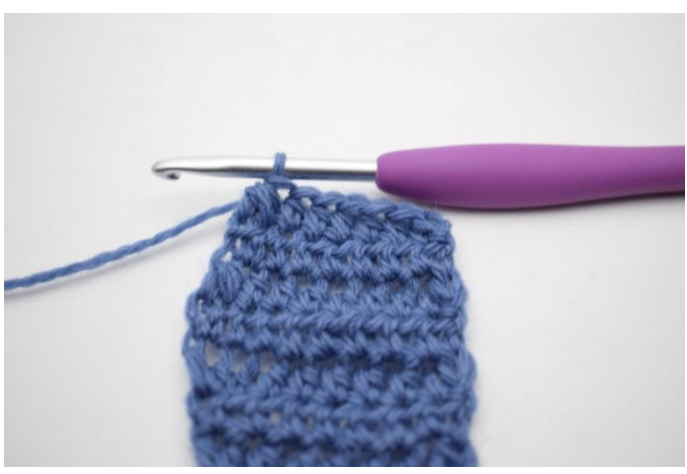
3. Work the last 2 hdc tog. (68)