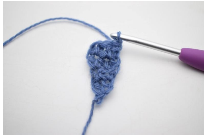
1. Turn by chaining 1.