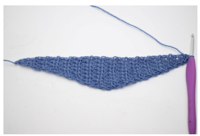
1. Repeat this procedure until you have a total of 274 rows = 2 sts