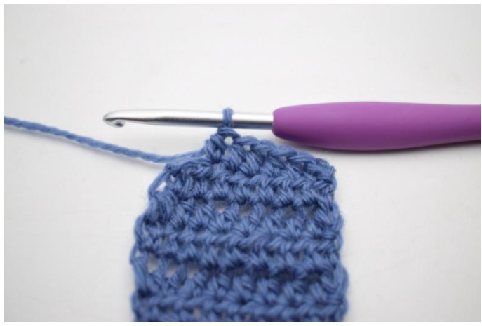
2. Work 1 hdc in the first 67 sts.