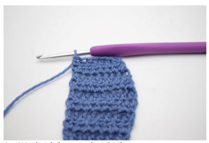
2. Work 1 hdc in each s. (68)