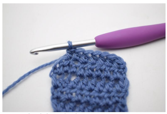
2. Work 1 hdc in the first 68 sts.