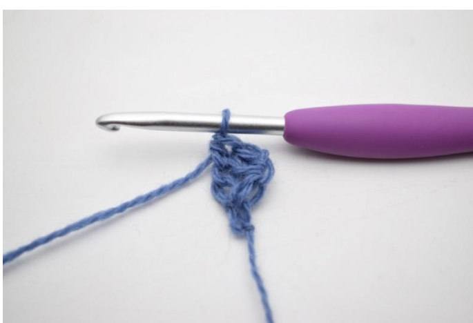
2. Work 1 hdc in each s. (2)