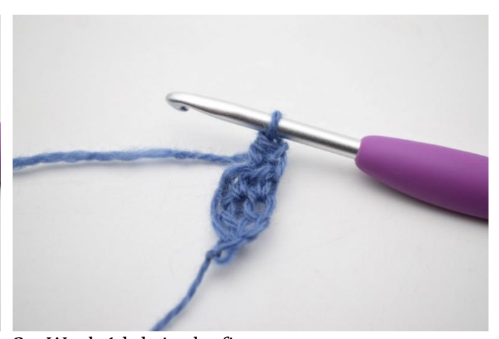
2. Work 1 hdc in the first s.