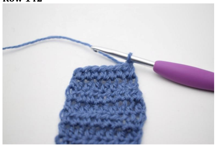
1. Turn by chaining 1.