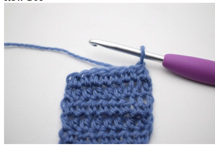
1. Turn by chaining 1.