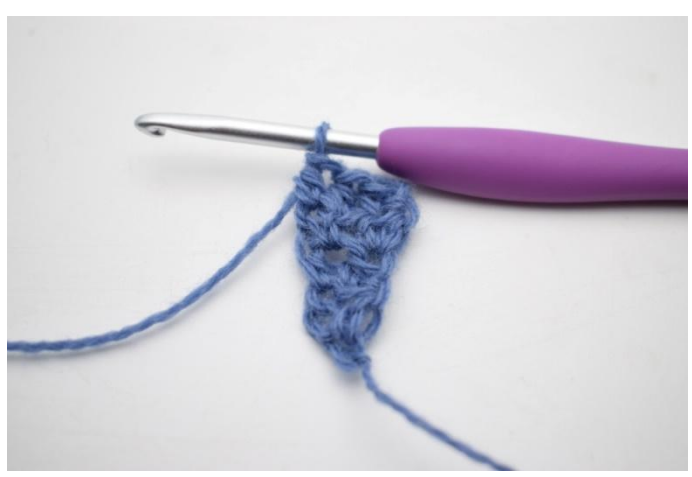
2. Work 1 hdc in each s. (3)