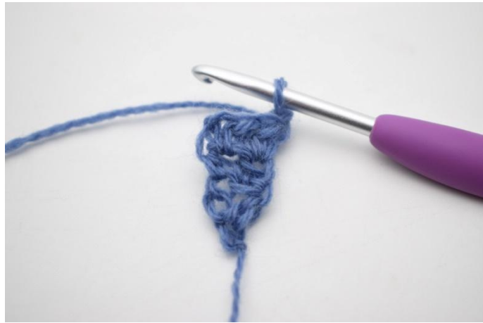
1. Turn by chaining 1.