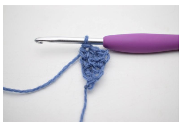
3. Work 2 hdc in the last s (3)