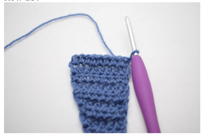
1. Turn by chaining 1.