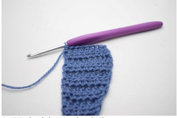
2. Work 1 hdc in each s. (69)