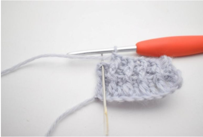
9. Work 1 reg. dc in the last s.