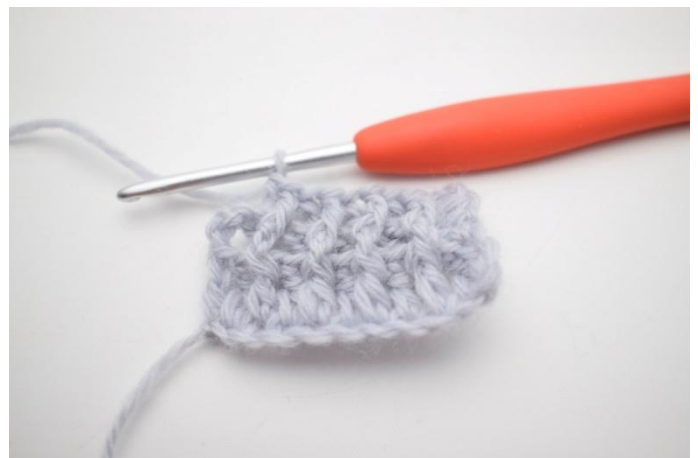
8. Work 1 bpdc around the next s.