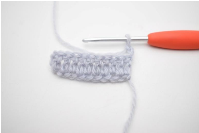
1. Turn by chaining 3.