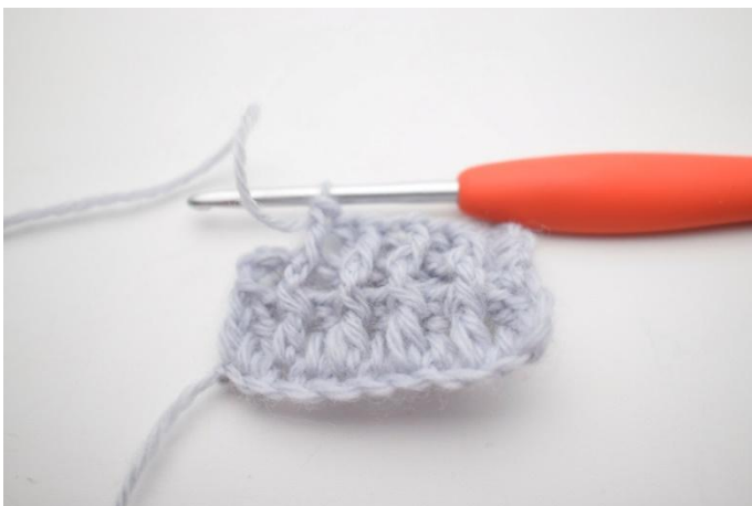
7. Repeat from "to" until you have 2 sts left.