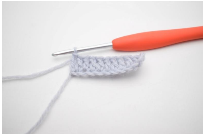
4. Work dc till the end of the row (33)