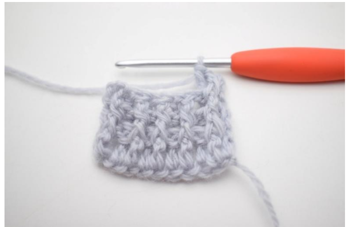
2. "Work 1 fpdc around the first s, Work 1 bpdc around the next s".