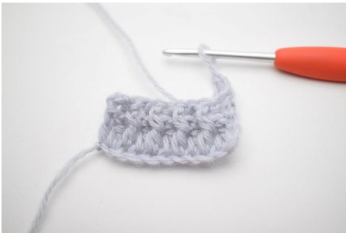
1. Turn by chaining 3.