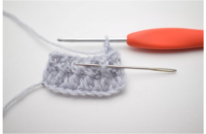
4. Work 1 fpdc around your next s. The needle here marks how your fpdc should be worked from the front around the dc post of the previous row.