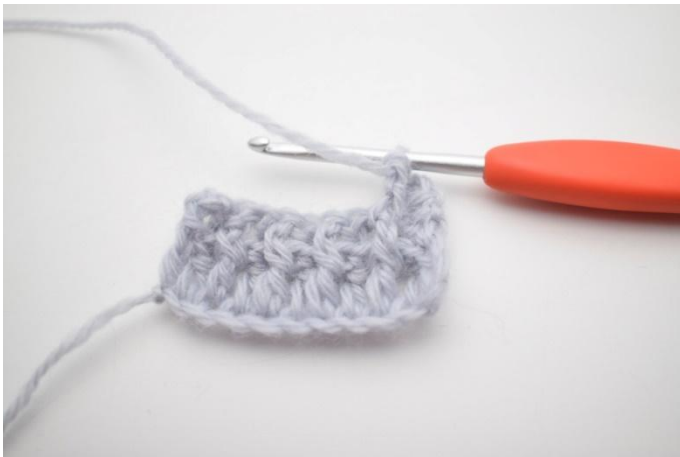
5. Like this.