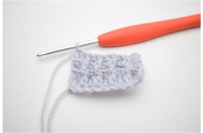
10. Like this.