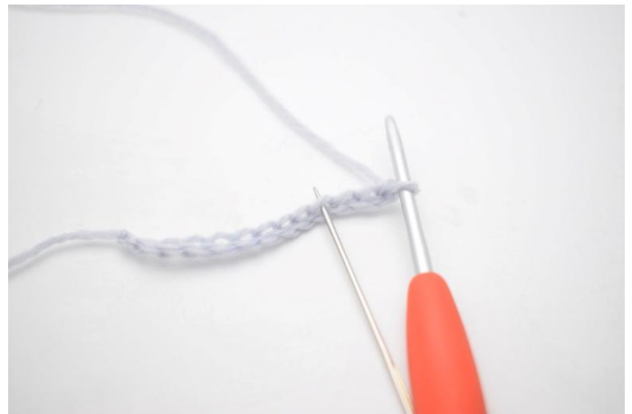
2. Work 1 dc in the 4th ch from the hook