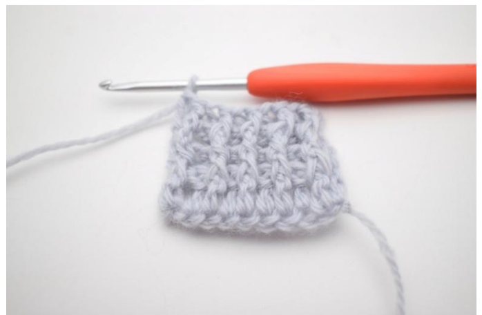
4. Work 1 fpdc around the next s. Work 1 reg. dc in the last s.