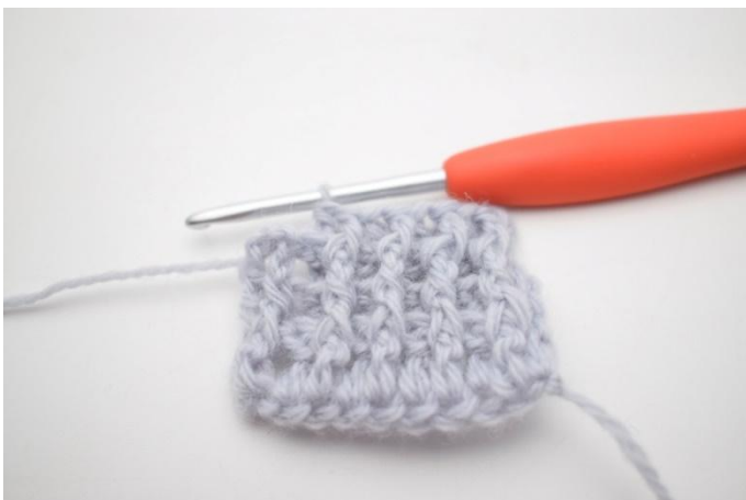
3. Repeat from "to" until you have 2 sts left.