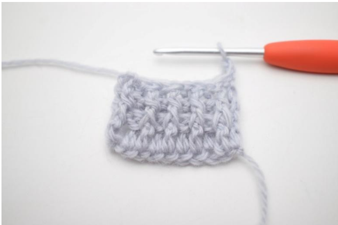
1. This row is worked just like row 2. Turn by chaining 3.