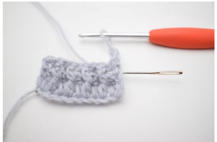
2. Work 1 bpdc around the first s. The needle here marks how your bpdc should be worked from the back around the dc post the previous row.