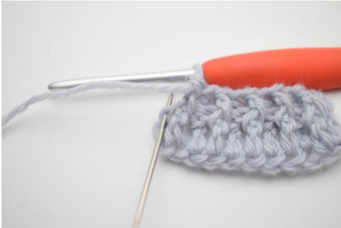
9. Work 1 reg. dc in the last s.