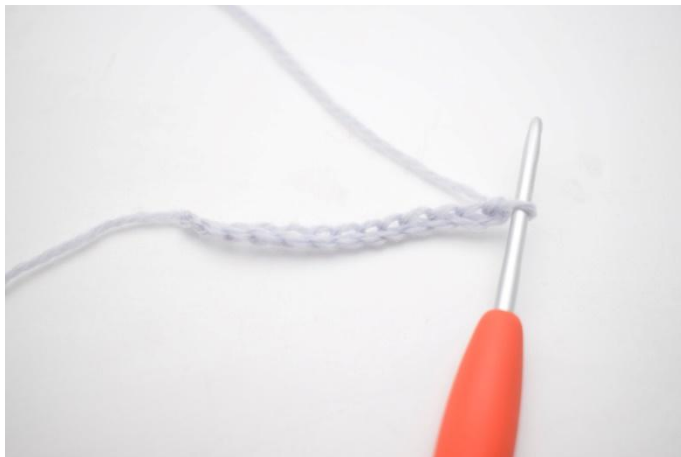
1. Ch 35.