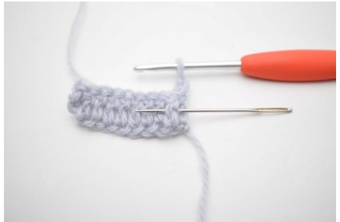
2. Work 1 fpdc around the first s. The needle here marks how your fpdc should be worked from the front around your dc post of the previous row.