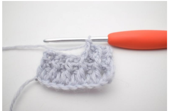
6. "Work 1 bpdc around the first s, work 1 fpdc around the next s".