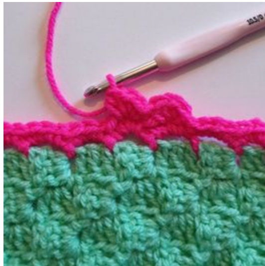
4. Skip 1 st and work 1 sl st in ch-space from previous row.