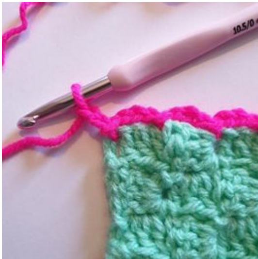
7. Ch 2.