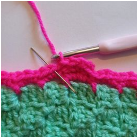
3. Work 3 hdc in next st.