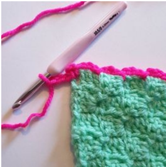
9. Ch 3.