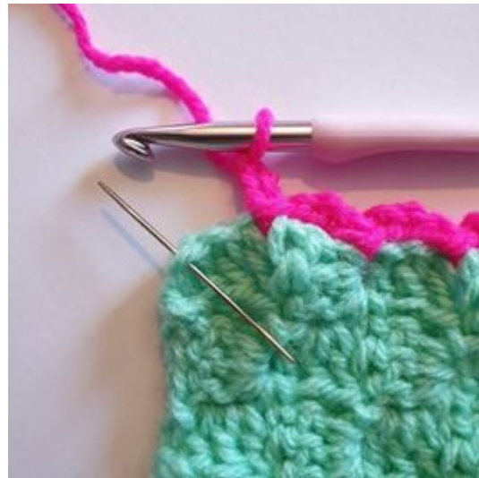
6. Work 1 sl st in the corner.