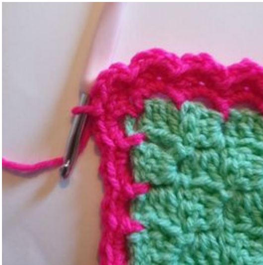
7. Continue working around the corner. *3 hdc in same st, skip 1 st and 1 sl st*.