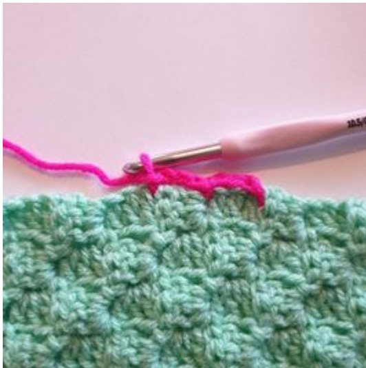
5. Work 1 sl st between the next 2 pixels.