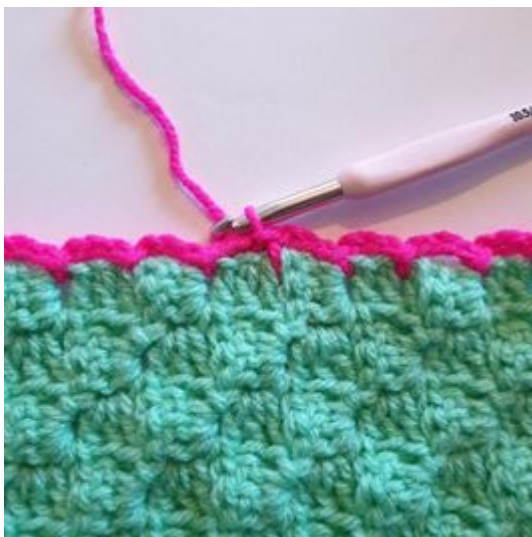
11. Finish with 1 sl st in first st on the row.