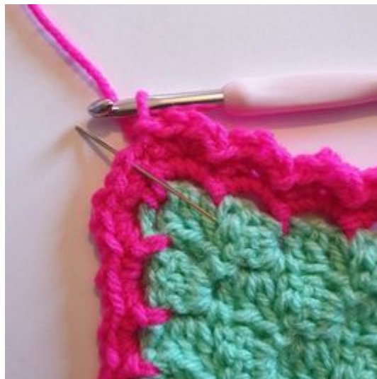
6. In the corner you work in the same way. *3 hdc in same st, skip 1 st and 1 sl st t*