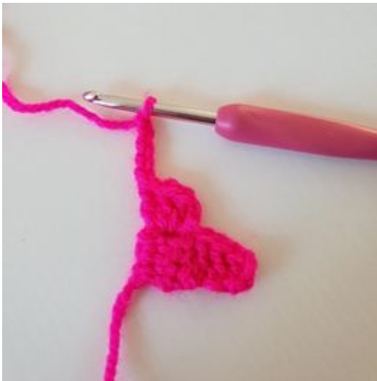
1. Ch 5.