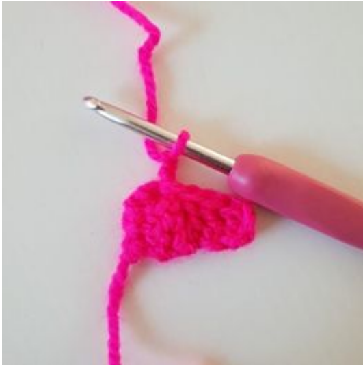
5. Ch 2 (replaces first dc).