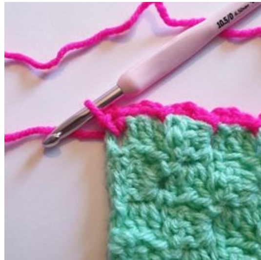
8. Work one more sl st in the corner.