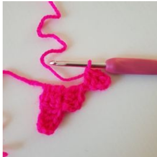
2. Work 1 dc in third ch from hook and continue with 1 dc in each of the last 2 ch.