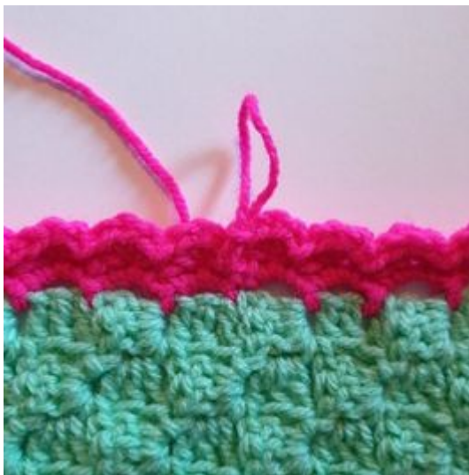
9. Finish with 1 sl st.