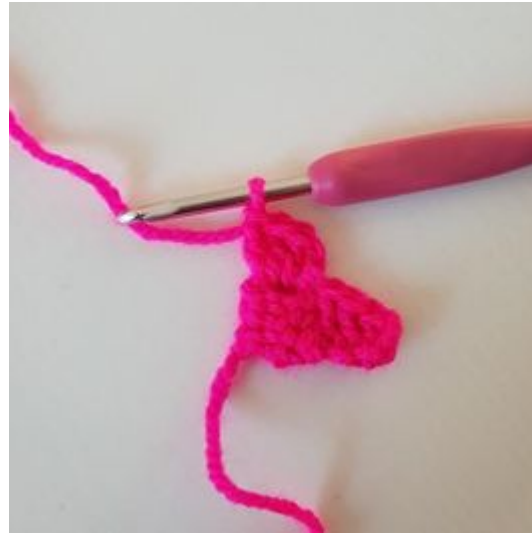
6. Work 3 dc in same ch-space, where you just worked 1 sl st. You now have 2 pixels on row 2.