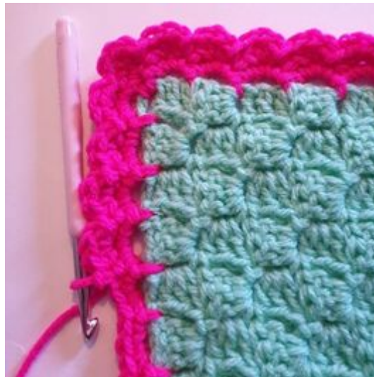
8. Continue working the rest of the row.