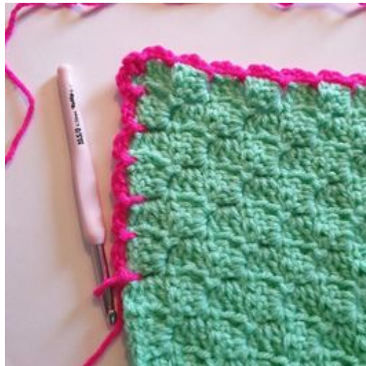
10. Continue working like this around the entire edge of the blanket.