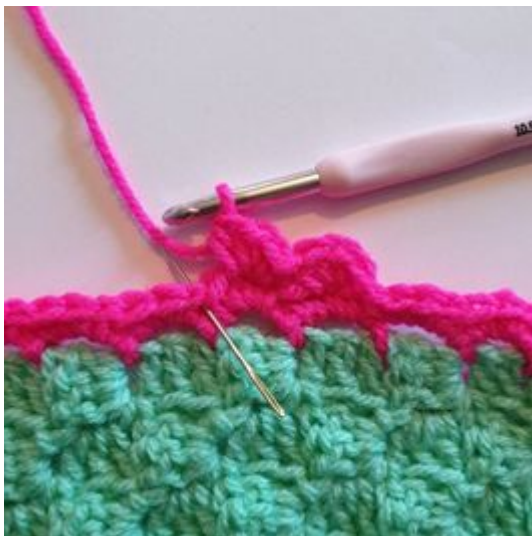
5. Continue working 3 hdc in same middle-st from previous row and 1 sl st in ch-space. *3 hdc in same st, skip 1 st and 1 sl st*