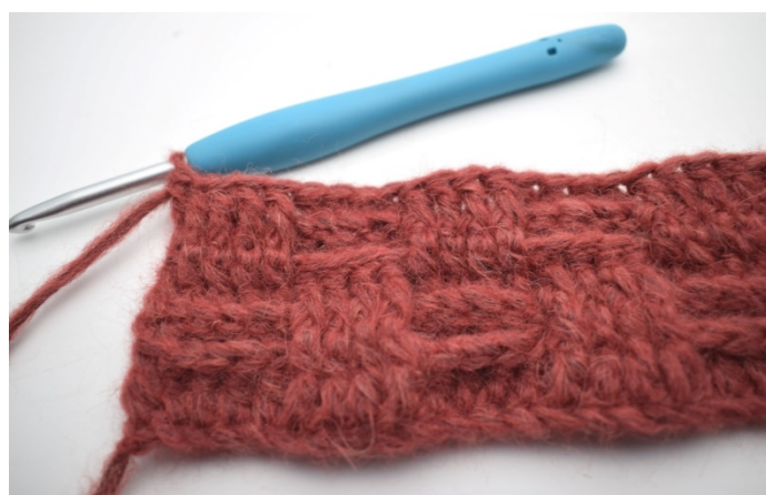
10. Crochet 1 dc in the last st.

9. Repeat * to * until you have 1 st left.