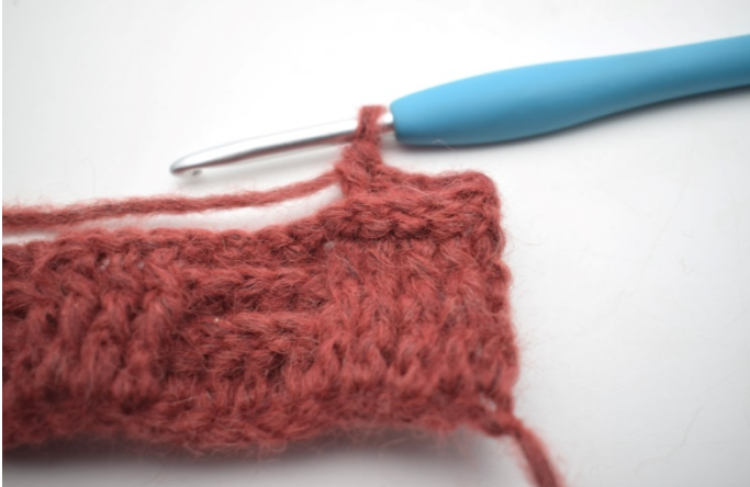
4. Crochet 1 BPdc around the next 3 st.