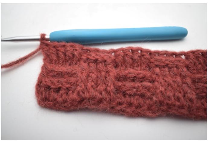
10. Crochet 1 dc in the last st.

9. Repeat * to * until you have 1 st left.