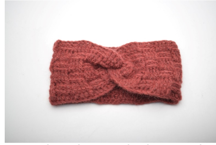
6. Sew the ends together through the 4 layers. Cut the yarn and weave in the ends.

6. Turn the stitching around to the wrong side of the work. There is a nice 'knot' assembled on the headband. 😇