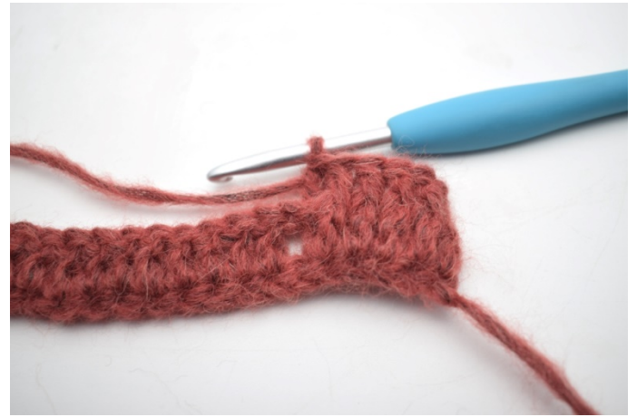
6. Like this.

5. Crochet 1 BPdc around the next st. The needle in the picture marks where to crochet around the dc post from behind.