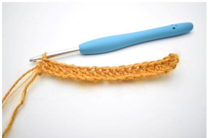
4. Work 1 hdc in each st on entire row = 77(83)89 st.