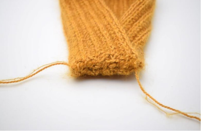
8. Like this. Cut the yarn and weave in ends.