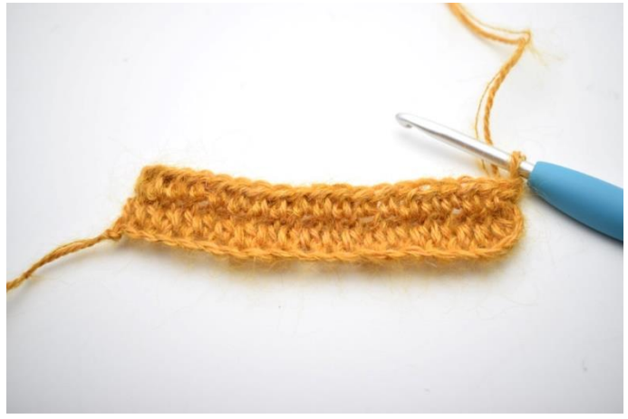
1. Work row 3 as row 2. Turn and ch 1.