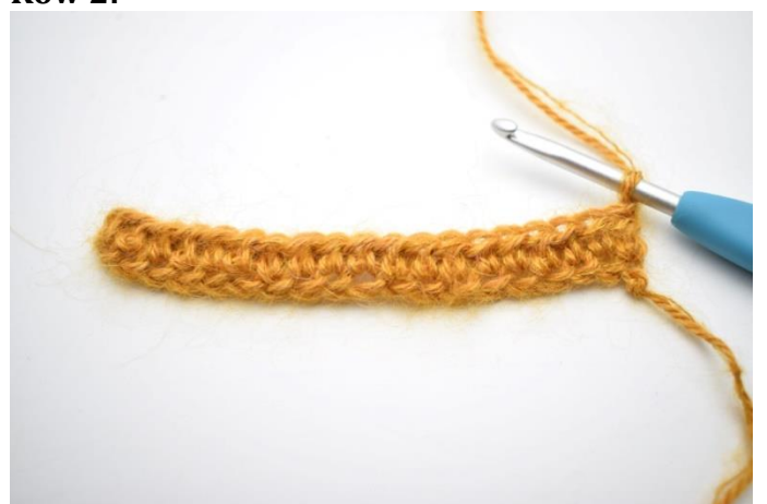
1. Turn and ch 1.