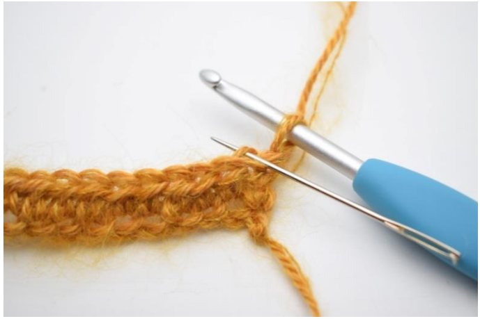
2. Work 1 hdc TBL. The needle on photo points out the stitch, in which you work the hdc.