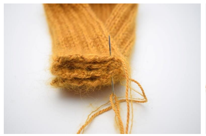
7. Sew pieces together, working through all 4 layers.