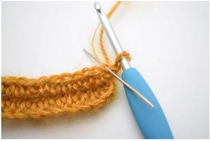
2. Work 1 hdc TBL. The needle on photo points out the stitch, in which you work the hdc.