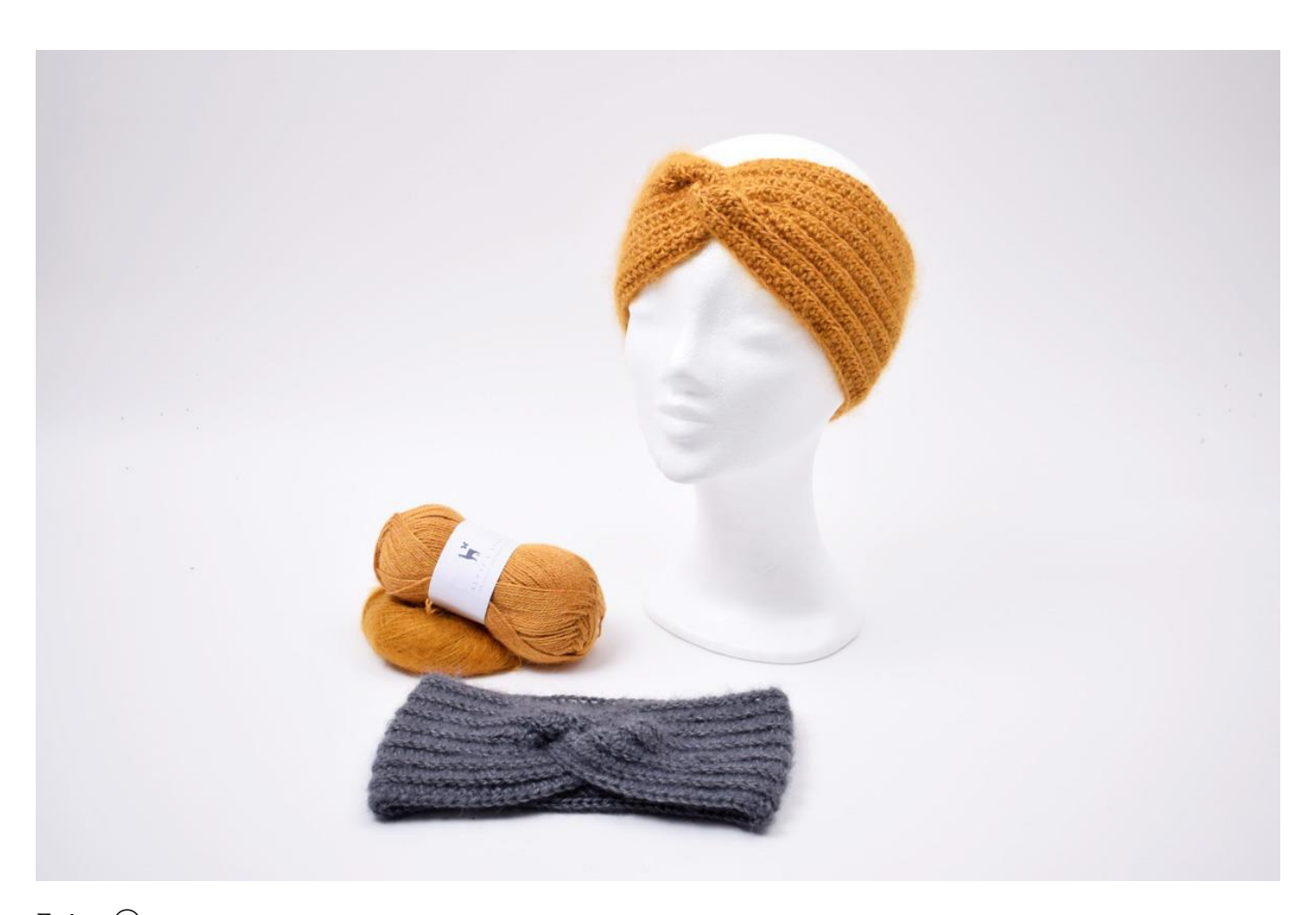
Enjoy \bigcirc Love from Hobbii

9. Turn the seam around to the wrong side. You now have a pretty "knot" on the right side and the head band is finished ©