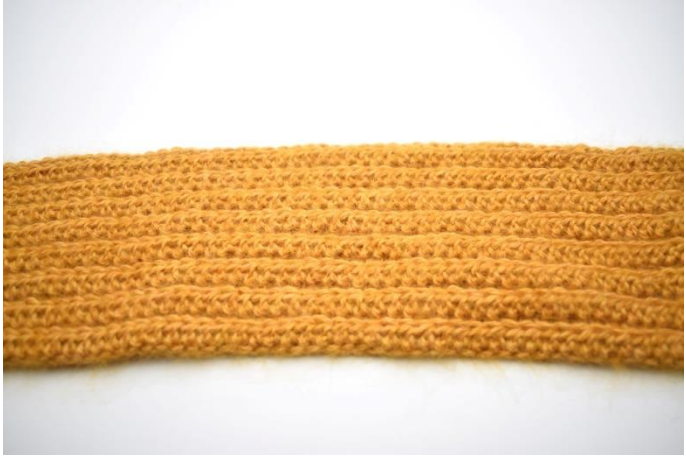
5. Repeat row 2 until you have worked a total 16 rows in hdc. Cut yarn and weave in ends.