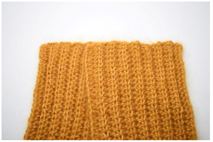
3. Lay the right piece over the left piece, covering the half of it.