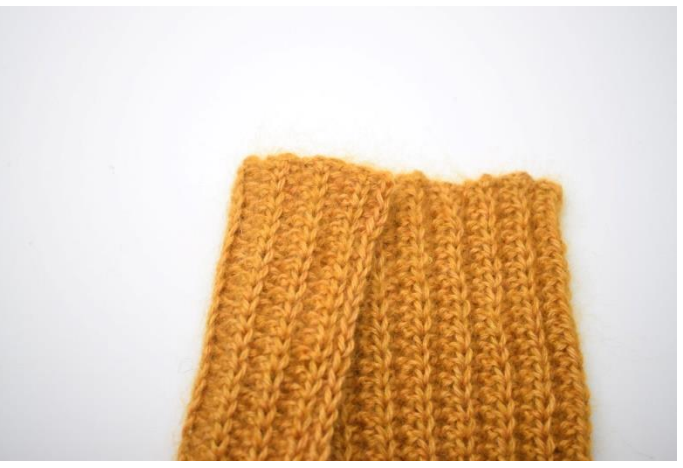
4. Fold the left piece, which has not been covered, over the right piece.