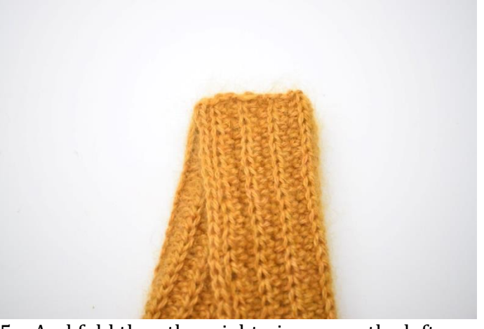
5. And fold the other right piece over the left piece.