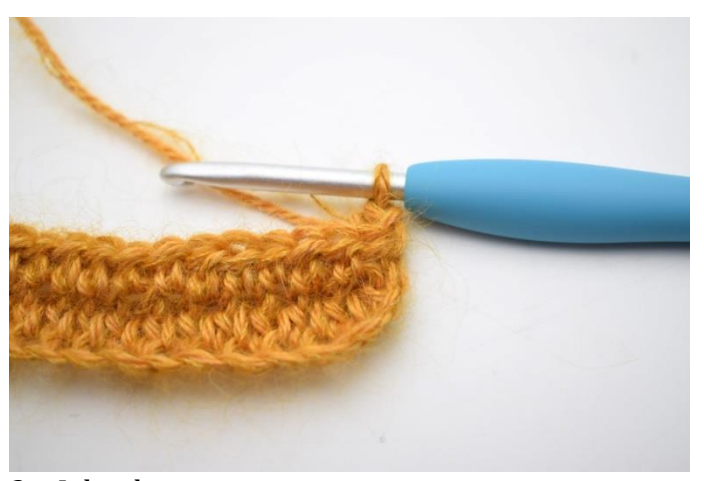
3. Like this.