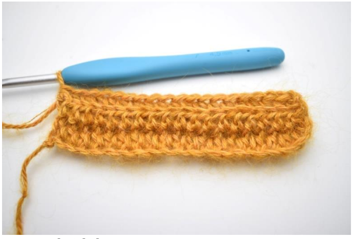
4. Work 1 hdc TBL in every st on entire row = 77(83)89 st.