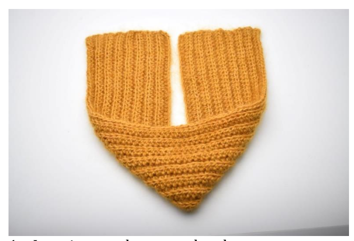
1. Lay piece as shown on the photo.