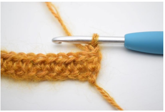
3. Like this.