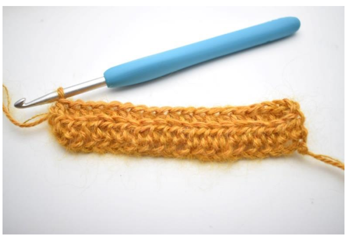
3. Work 1 hdc TBL in every st on entire row = 77(83)89 st.