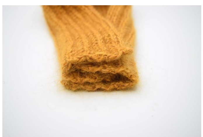
6. The ends of the pieces are now folded as seen on this photo.