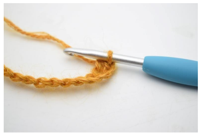
3. Like this.