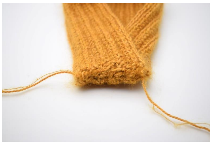
8. Like this. Cut yarn and weave in ends.