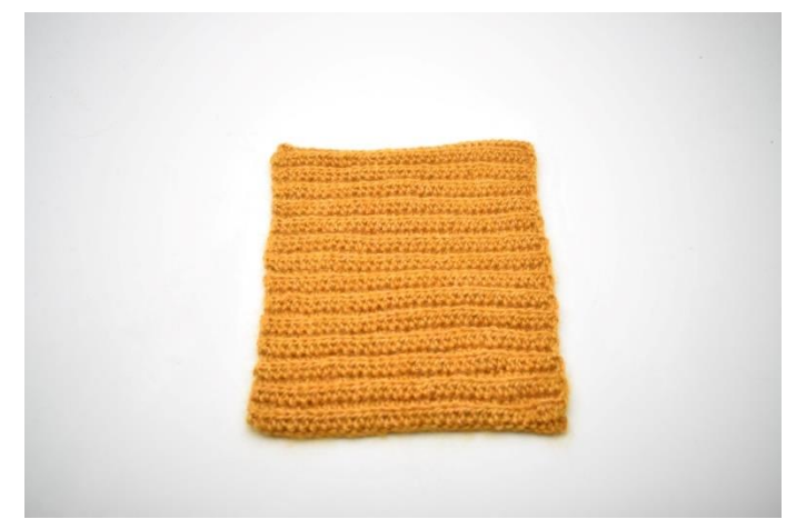
Work 1 hdc TBL in every st on entire row = 27(32) st.

5. Repeat row 2 until you have worked a total 28 rows in hdc. Cut yarn and weave in ends.