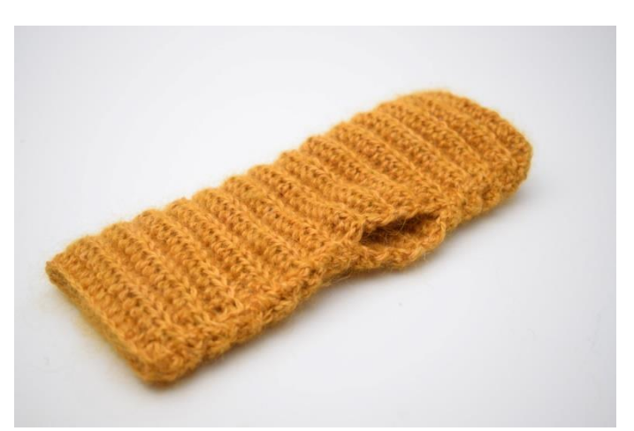
3. Skip 5 cm and sew or crochet the last 10 cm together. Cut yarn and weave in ends.