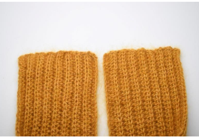
2. Now you need to fold the ends over each other to create a "knot".