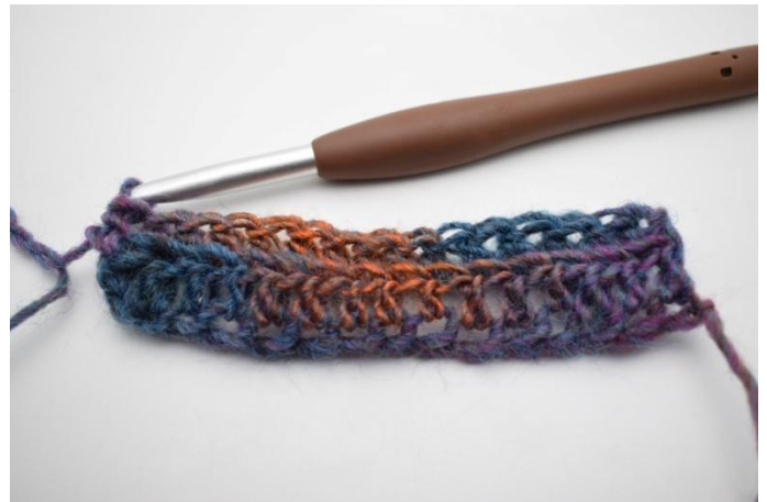
8. Work hdc in blo till the end of row.