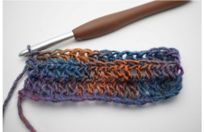
12. Work hdc in blo till the end of row.