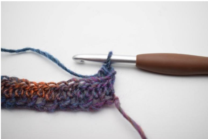
7. Like this..