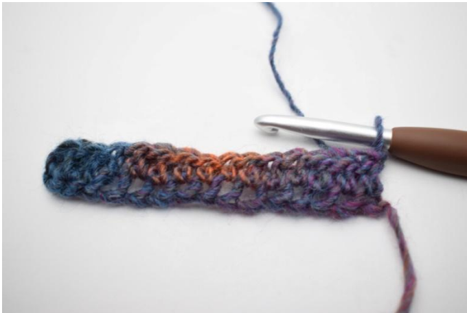
5. Turn by chaining 1.