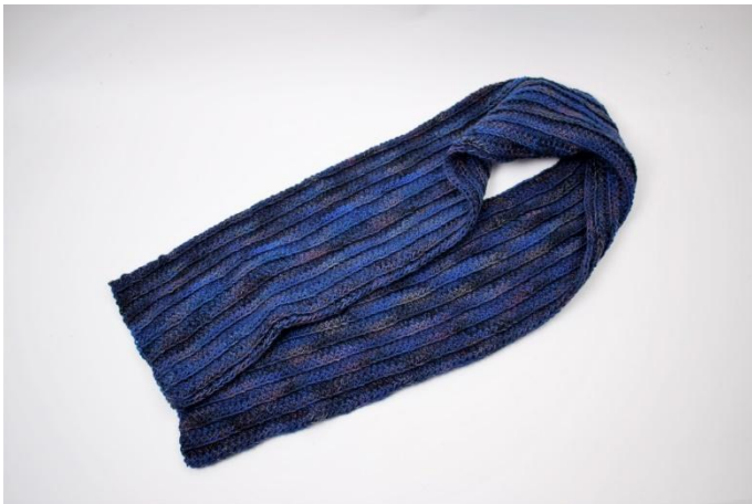
13. Repeat this procedure until you have 18 rows in total. Cut the yarn and weave in ends.