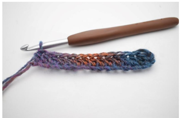
4. Work hdc till the end of the row.