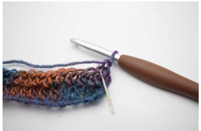
10. Work 1 hdc in blo. The needle marks the loop into which your hdc should be worked.