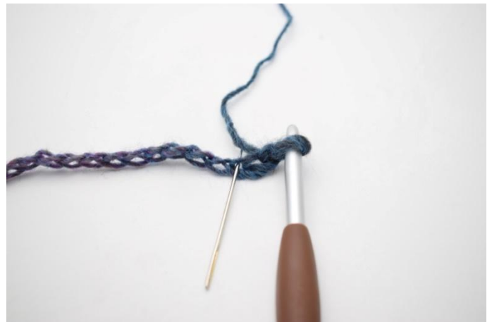
2. Work 1 hdc in the 3rd ch from the hook.