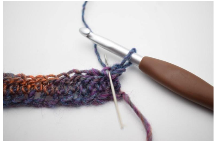
6. Work 1 hdc i blo. The needle marks the loop into which your hdc should be worked.