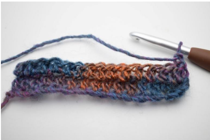
9. Turn by chaining 1.