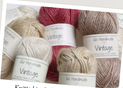
Knitted in Go handmade's Vintage - a luxurious mix of wool and bamboo: 70% Wool/30% Bamboo, 25 g/60 m.

Embroidery yarn, Felt, Tulle, Elastic, Press stud, Toy stuffing, Metal wire Eyes: 8 mm