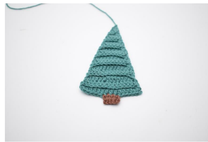
15. Cut the yarn and weave in ends.