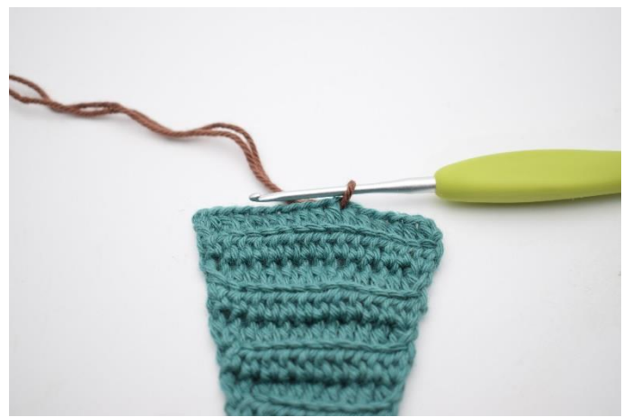
11. Skip 6 st and attach the color for the "trunk".

9. Repeat the rows until you have 16 hdc.