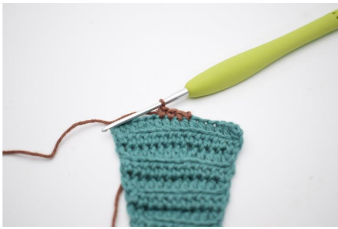
12. Work 4 dc.