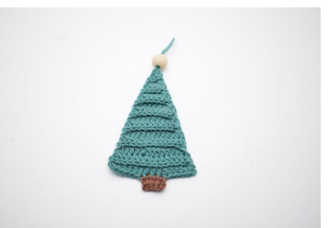
16. Attach optionally a bead on top of the tree.