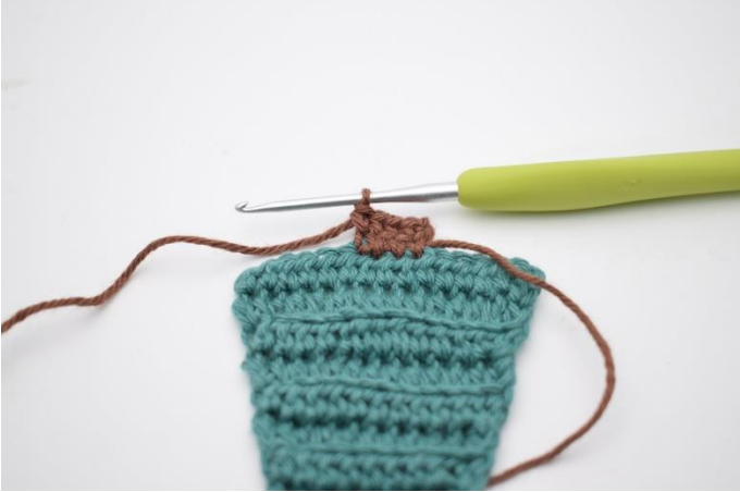
14. Work 1 sc in 4 st.