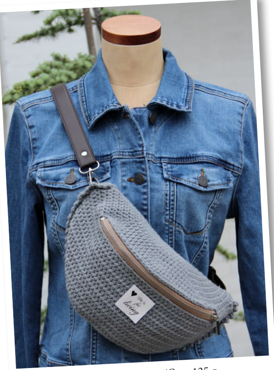
Size: 28 x 16 x 10 cm/Cosy 125 g. Zipper: 25 cm. Crochet slightly loosely with crochet hook 4,0 mm. Single thread: 16,5 htr/10 cm.

Although a crocheted bag is worked with the same size crochet hook, the finished size may be significantly different from another bag crocheted with the same crochet hook size. It is the style of crocheting (loose or tight) that really has a large impact on the final result.