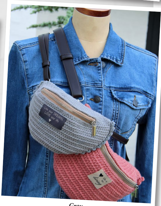
Grey Size: 22 x 12 x 8 cm/Cosy 75 g. Zipper: 20 cm. Crochet as tight as possible with crochet hook 3,0 mm. Single thread: 21 htr/10 cm.