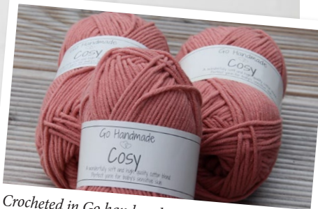
Crocheted in Go handmades Cosy – A wonderfully soft and high-quality cotton mix that keeps the shape. 60% Cotton/40% Acryl, 50 g/100 m.

Can be crocheted with both double and single thread.