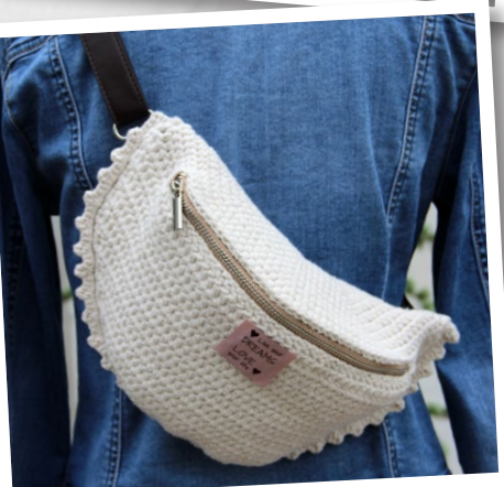
Size: 28 x 17 x 9 cm/Cosy 200 g. Zipper: 25 cm. Crochet as tight as possible with crochet hook 4,0 mm. Double thread: 16 htr/10 cm.