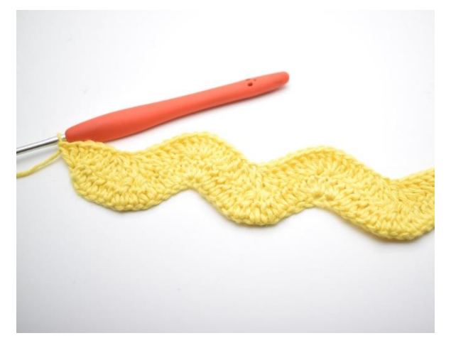
Rows 3 - 38