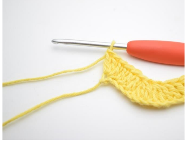
14. In the last st, work 3 dc.