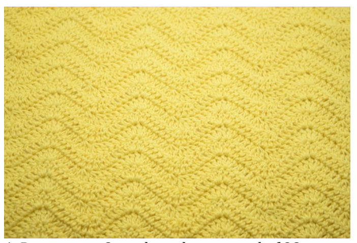
1. Repeat row 2 until you have a total of 38 rows.