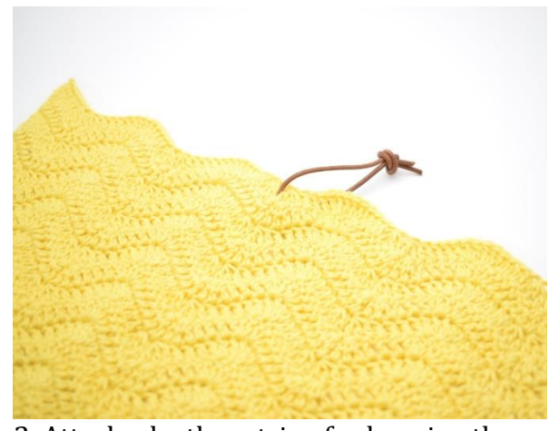
2. Attach a leather string for hanging the towel.