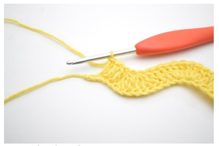
13. Work 1 dc in the next 3 sts.