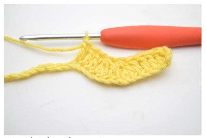
7. Work 1 dc in the next 3 sts.