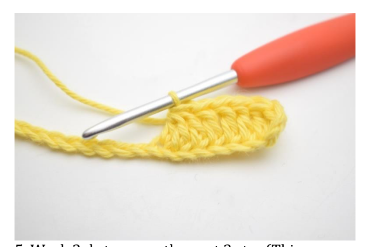
5. Work 3 dc tog over the next 3 sts. (This means that you should decrease the 3 sts to 1)