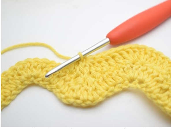
10. Work 1 dc in the next 3 sts. "work 3 dc tog over the next 3 sts". Repeat "to" twice.