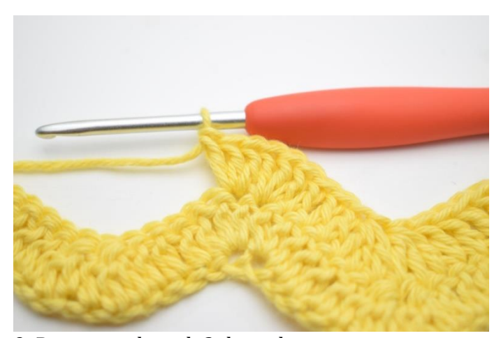
9. Repeat and work 3 dc in the next st.