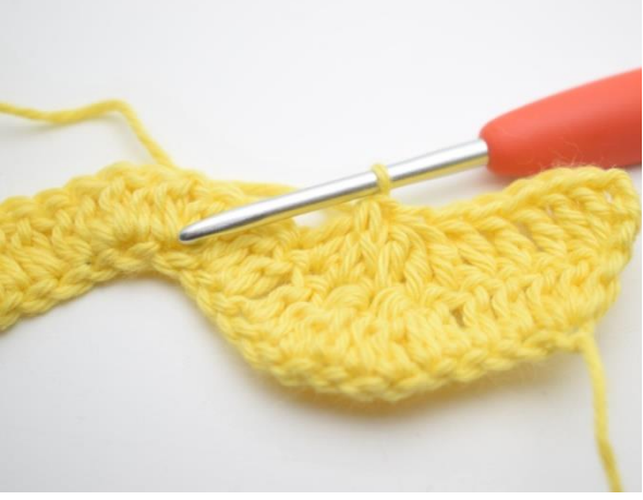
6. Repeat and work 3 dc tog over the next 3 sts.