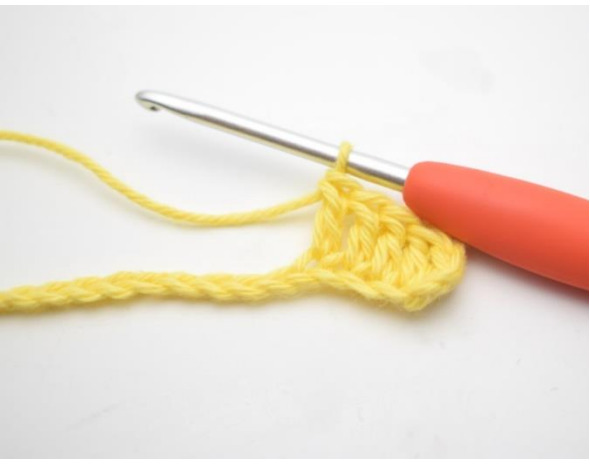
4. Work 1 dc in the next 3 sts.