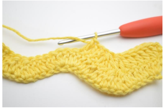
7. Work 1 dc in the next 3 sts.