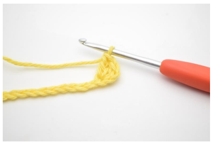
3. Like this.