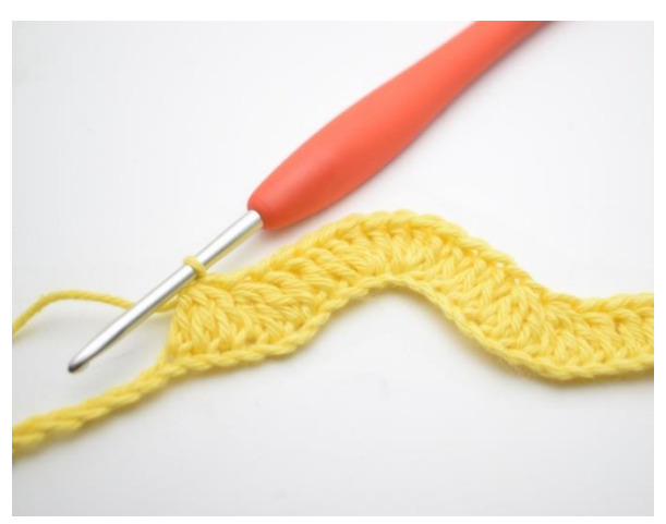
10. Work 1 dc in the next 3 sts. "work 3 dc tog over the next 3 sts". Repeat "to" twice.