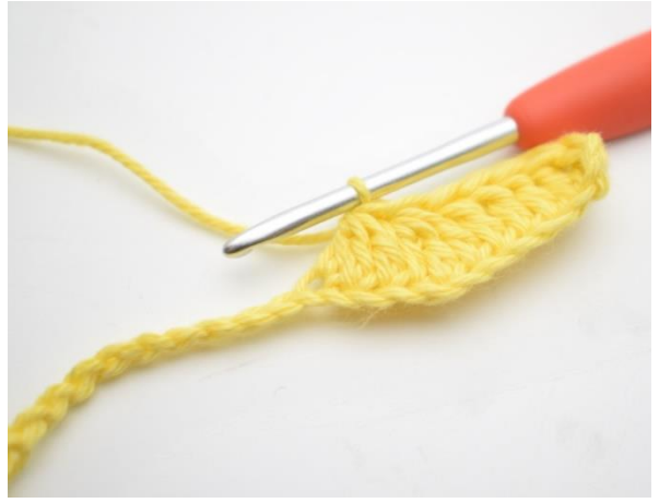
6. Repeat and work 3 dc tog over the next 3 sts.