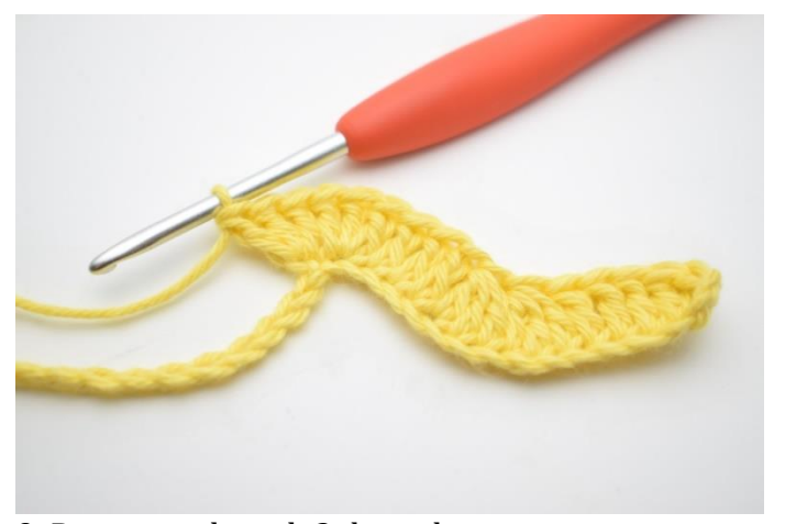
9. Repeat and work 3 dc in the next st.