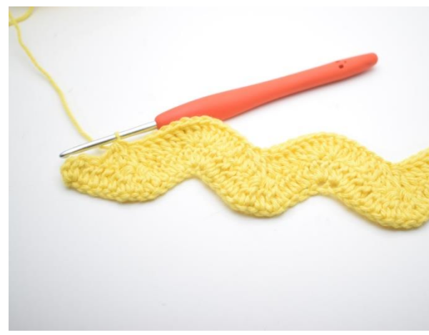
12. Continue until there are 4 sts remaining.