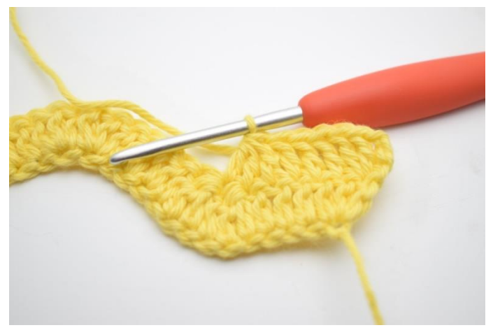
5. Work 3 dc tog over the next 3 sts.