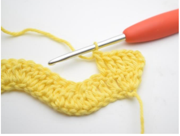
4. Work 1 dc in the next 3 sts.