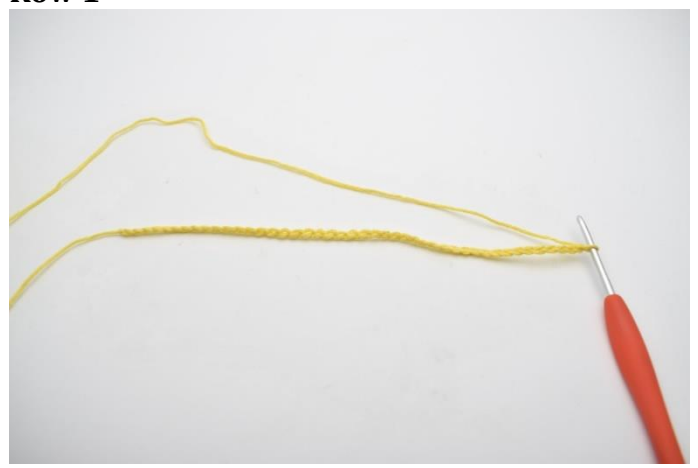
1. Ch 72.