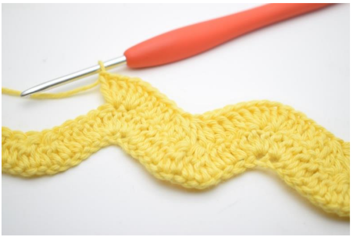
11. Work 1 dc in the next 3 sts. Work 3 in each of the next 2 sts.