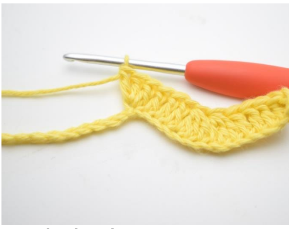
8. Work 3 dc in the next st.