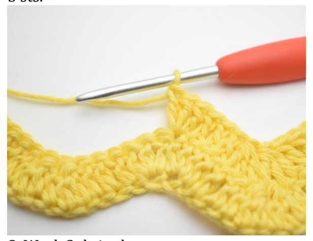
8. Work 3 dc in the next st.