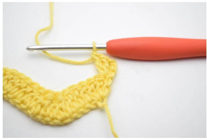
3. Like this.