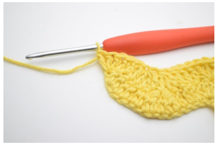
15. Like this.