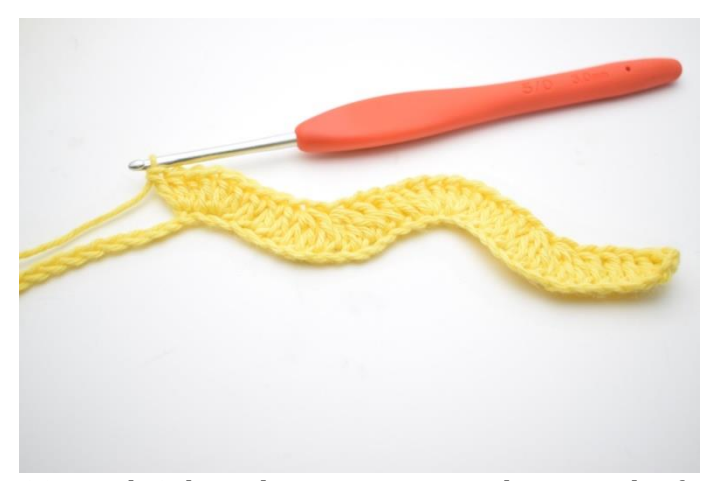
11. Work 1 dc in the next 3 sts. Work 3 in each of the next 2 sts.