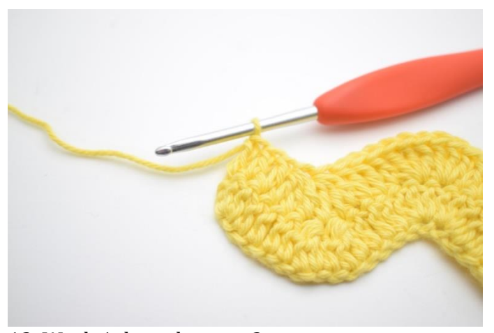
13. Work 1 dc in the next 3 sts.