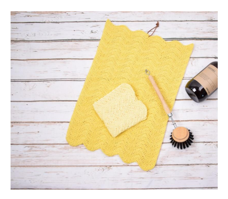
Enjoy! © Best Wishes, Hobbii