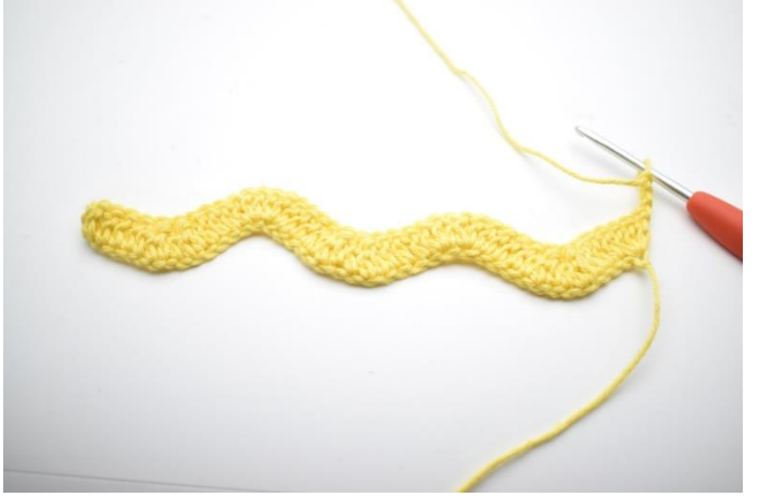
1. Ch 3 and turn.