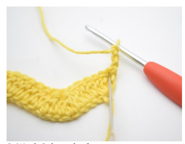
2. Work 2 dc in the first st.