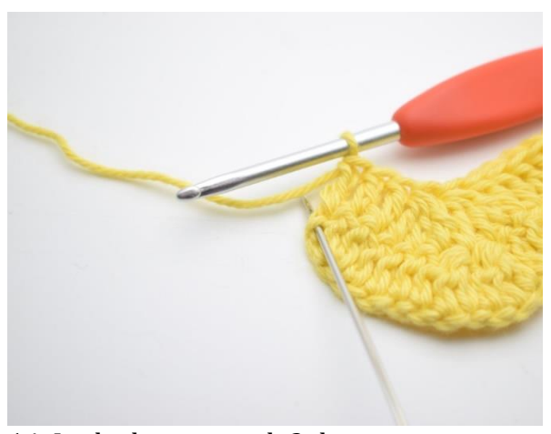
14. In the last st, work 3 dc.