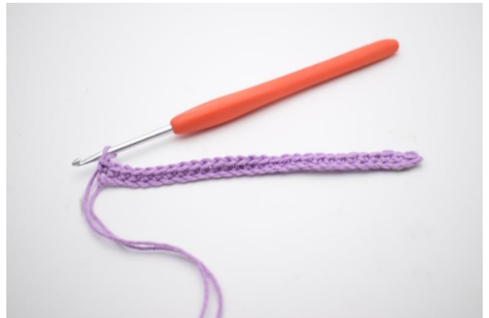
4. Work sc in each ch to the end of the row.