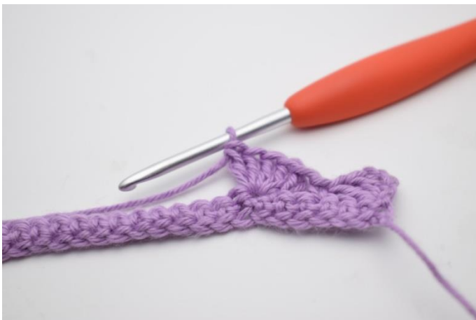
7. Work 5 dc in the next st.