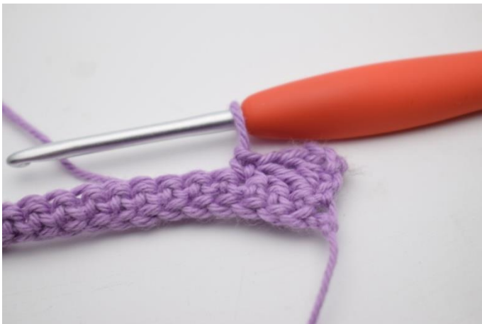
5. Work 1 sc in the next st.