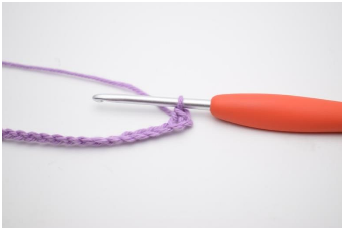
3. Like this.