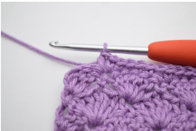
5. Repeat to the end of the row. Work 1 sc in the last 3 sts.