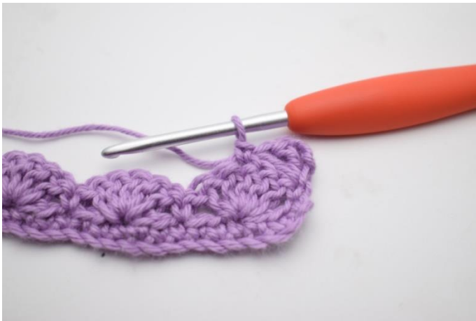
5. Like this.