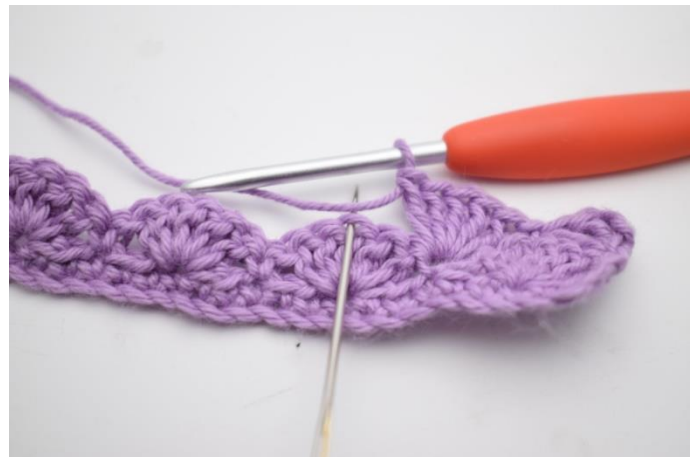
8. Skip 2 sts.