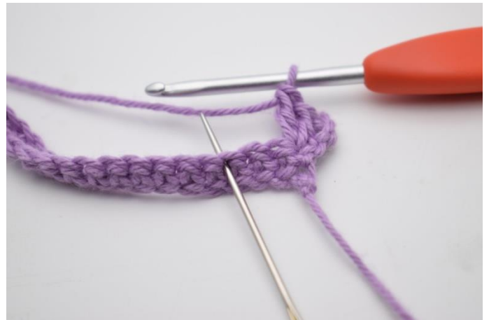
4. Skip 2 sts.