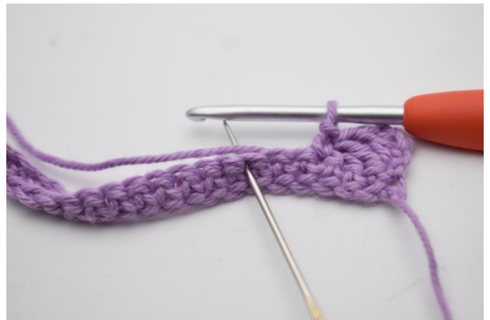
6. Skip 2 sts.