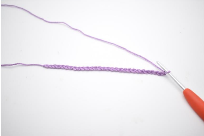
1. Ch 77.