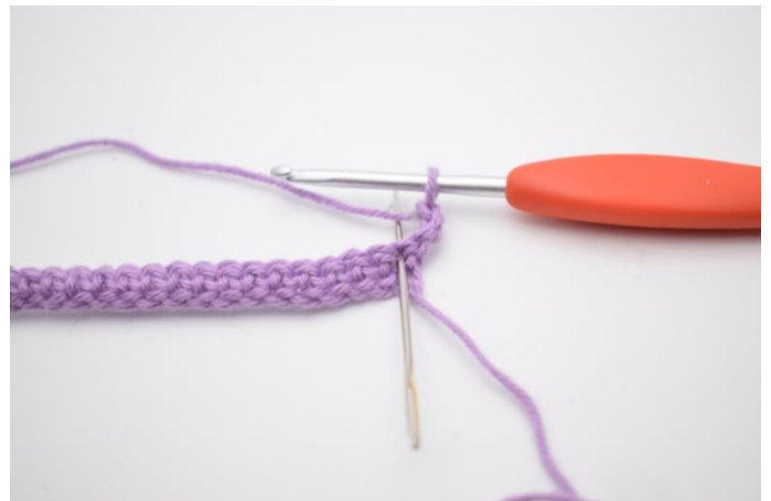
2. Work 2 dc in the first st.