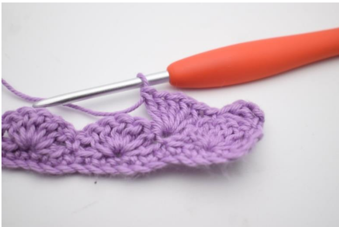
7. Work 5 dc in the next st.