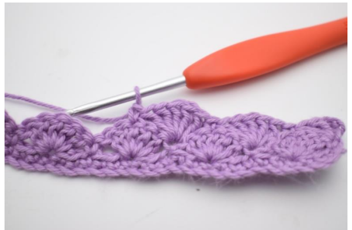
10. Skip 2 sts, work 5 dc in the next st, Skip 2 sts and work 1 sc in the next st.