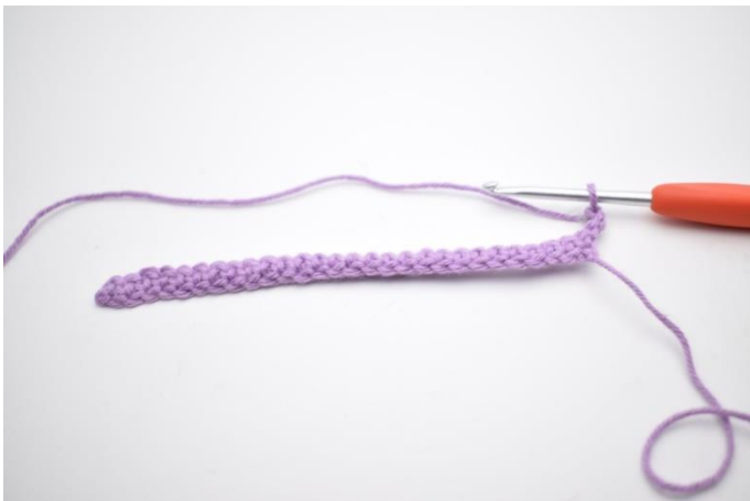
1. Ch 3 and turn (counts as 1 dc).