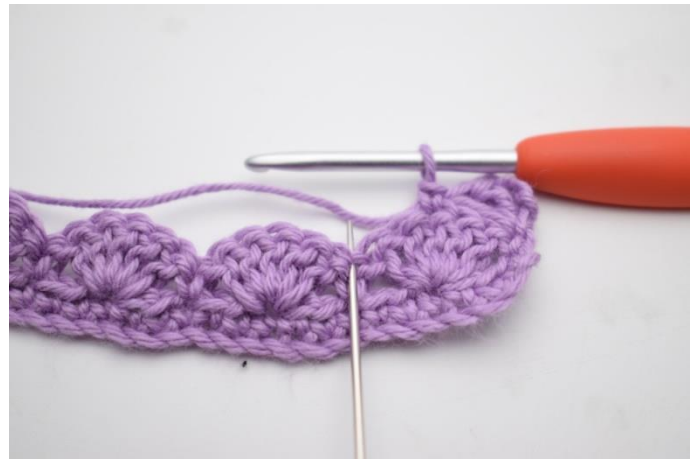
6. Skip 2 sts.