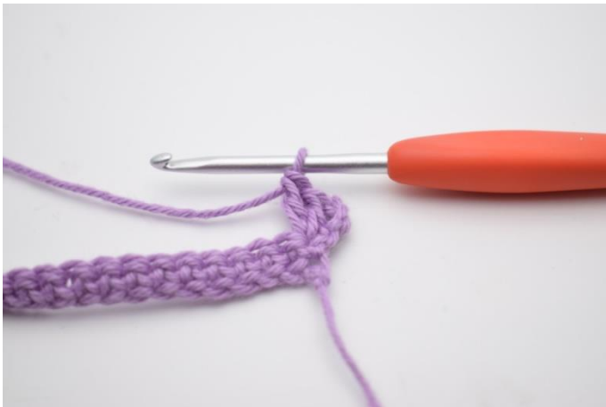
3. Like this.