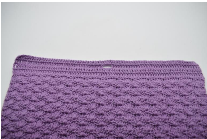
Work the top as described in the written pattern.