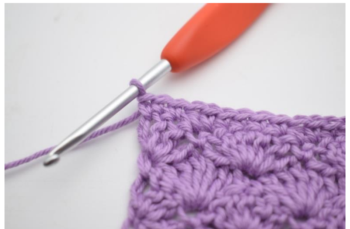
6. Like this.