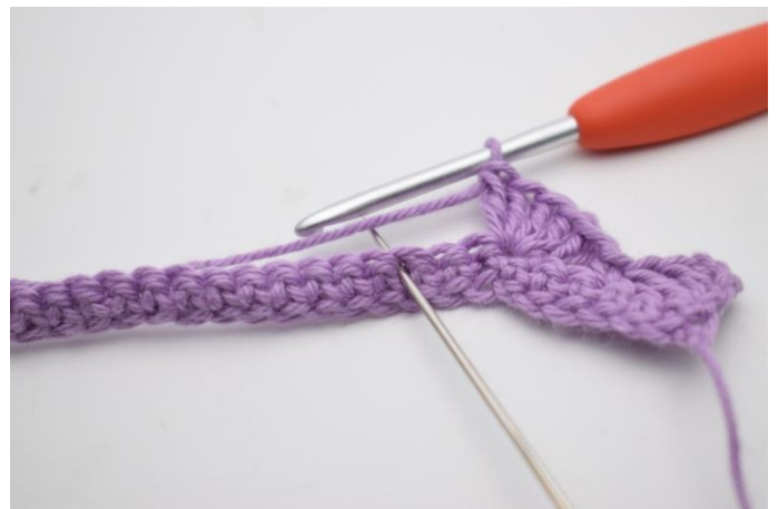
8. Skip 2 sts.