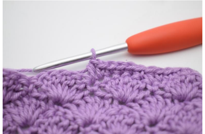
4. Work 1 sc in the next 5 sts, 1 hdc in the following st.