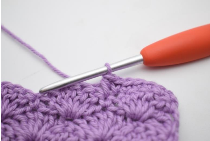
3. Work 1 hdc in the next st.