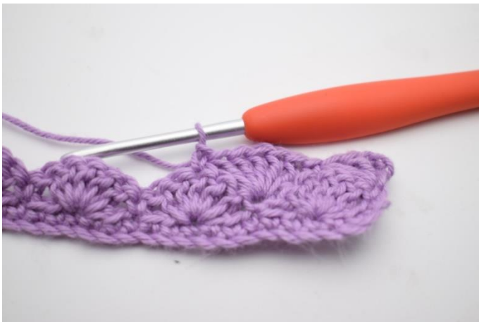
9. Work 1 sc in the next st.