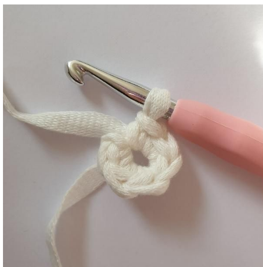
2. work 6 sc in the 2nd ch from the hook.