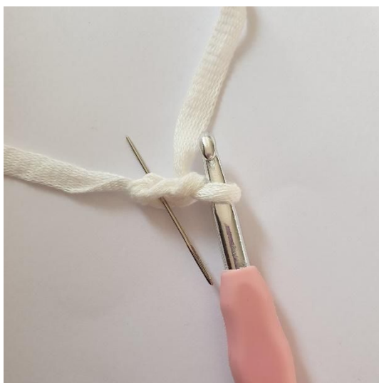
1. Ch 2, start in the 2nd ch from the hook.

End with 2 sl sts. Cut the yarn and weave in the ends.