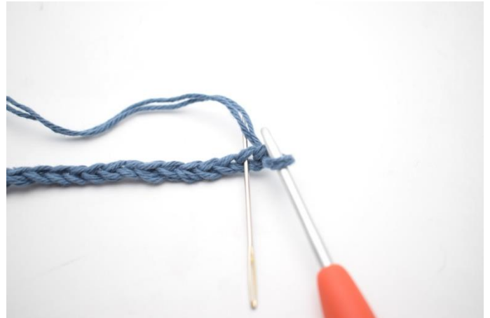
2. In the 2nd ch from the hook, work 1 sc.