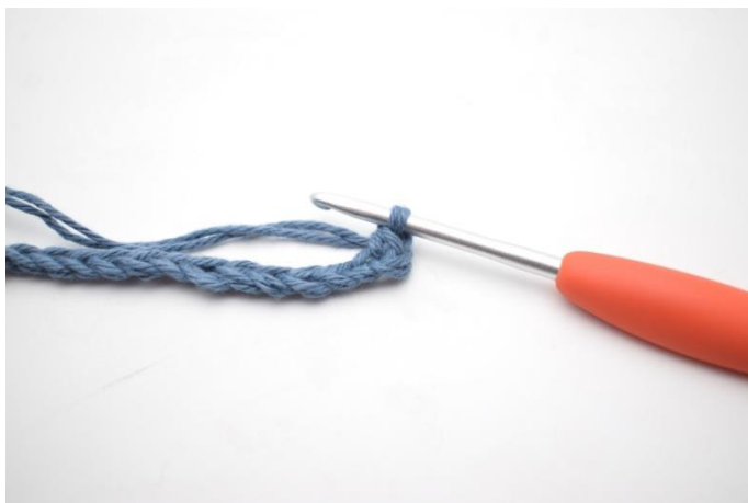
3. Like this.