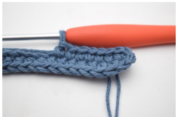
6. Working along the backside of the starting ch, work 1 sc in the next 42 sts.