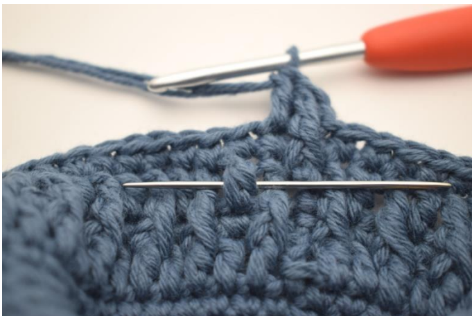
5. Work 1 fpdc around the next dc in the row below.