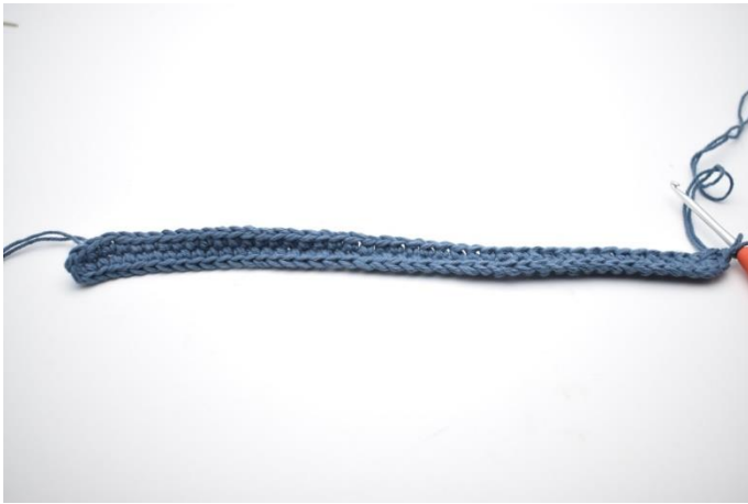
Rnd 2 - 9