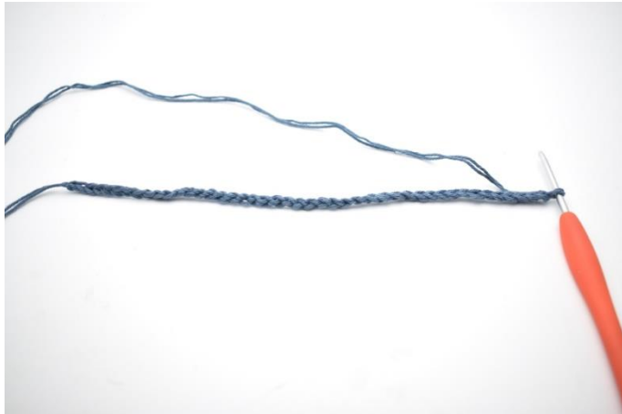
1. Ch 44.