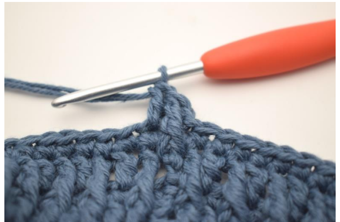
4. Work 1 dc in the next st.