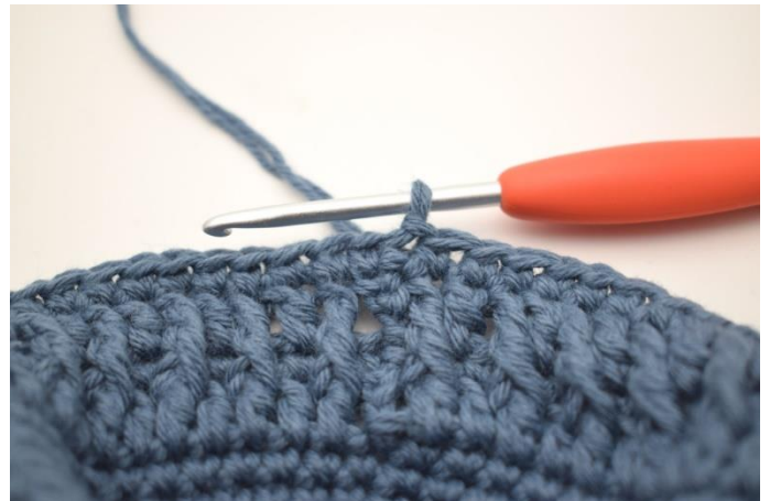
2. Work sc in each st to the end of the rnd. End with a sl st. (92)