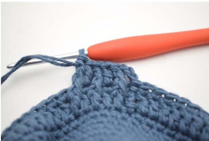
7. Work *1 dc in the next st, 1 fpdc around the next dc in the row below*