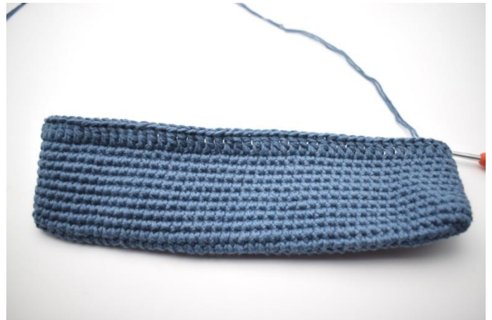
1. Ch 3 (counts as 1 dc). Work 1 dc in each st. End with a sl st. (92)