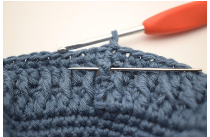
2. Work 1 fpdc around the next dc from the rnd below where you would normal work. The needle indicates where to insert the hook.