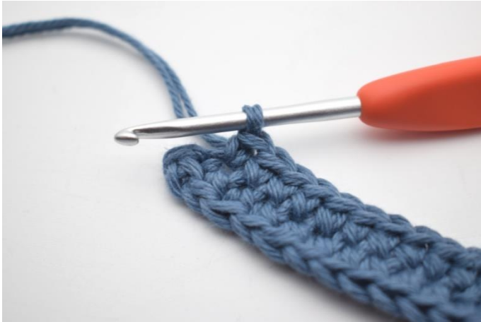
7. In the last st, work 4 sc.