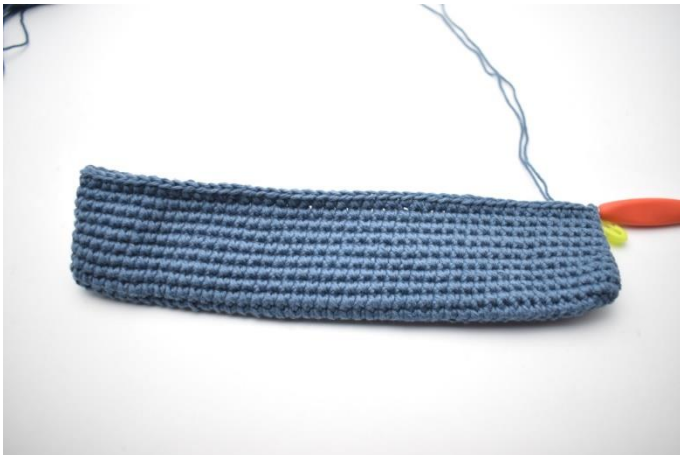
1. Repeat rnd 2 until you have a total of 9 rnds of sc. The last rnd, end with a sl st.