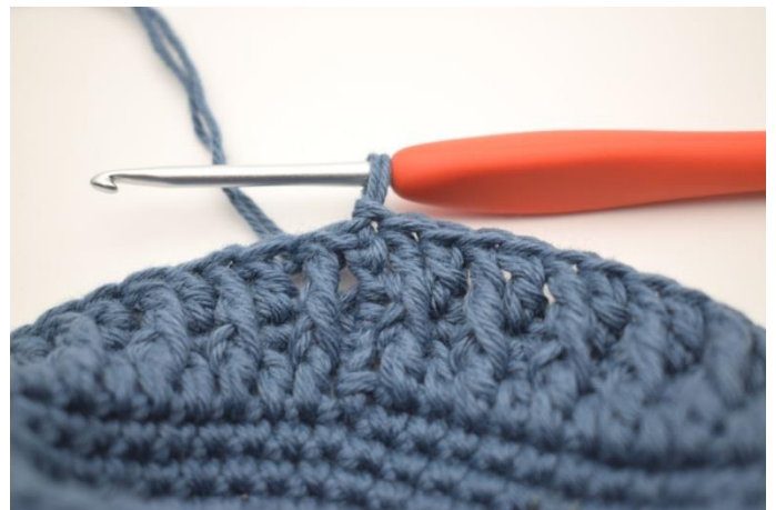
8. Repeat * to * to the end of the rnd. End with a sl st in the 3rd ch of the starting ch. (92)