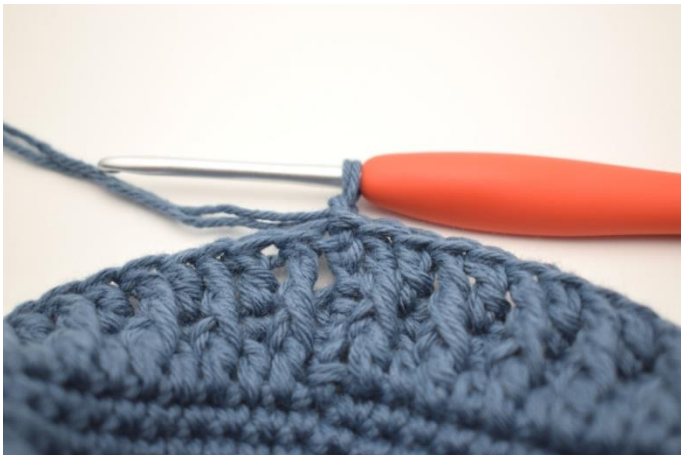
1. Ch 1.