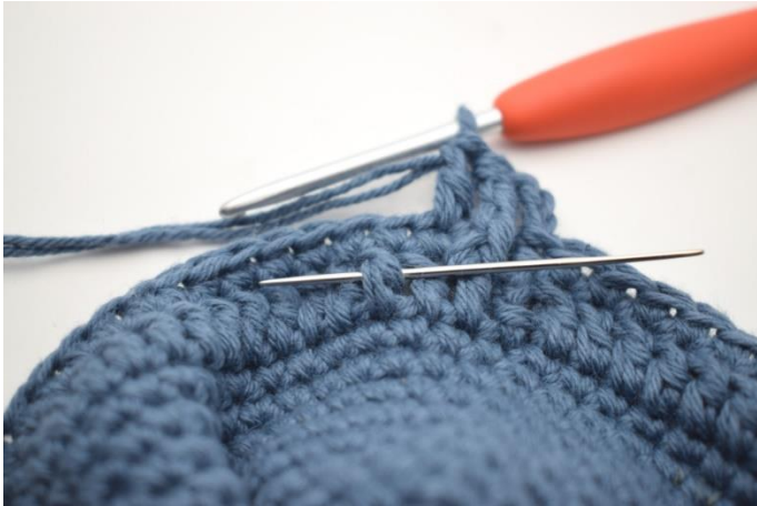
5. Work 1 fpdc around the next dc in the row below.