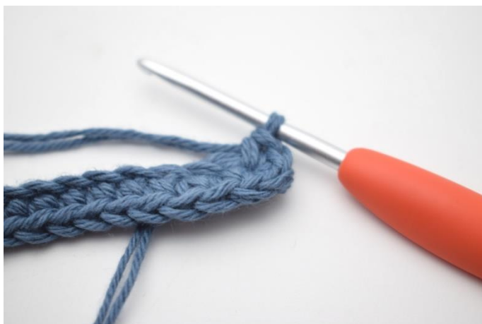
5. In the last st, work 4 sc.