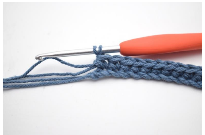
4. Work 1 sc in the next 41 sts.