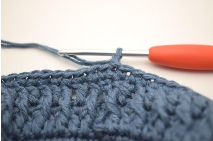
1. Ch 1.