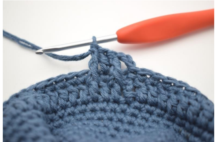
6. Like this.