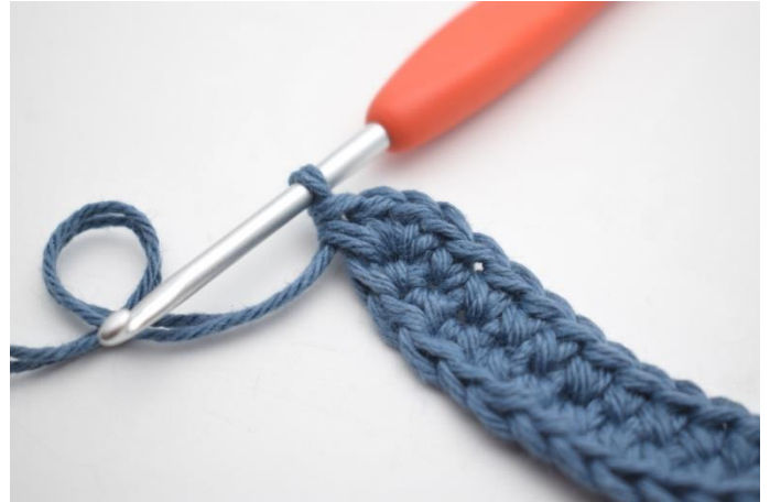
8. Like this. (92)