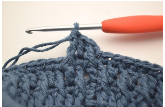
6. Like this.