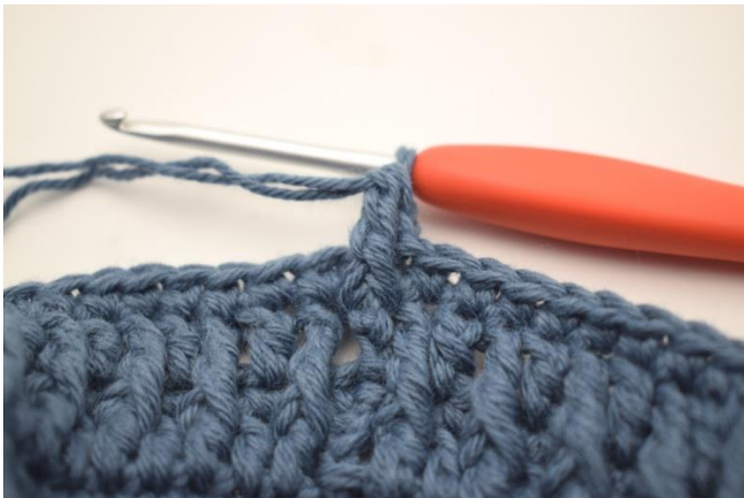
3. Like this.