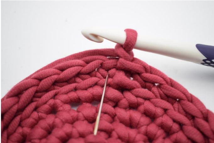
9. This rnd will be worked with ks. Ks is a normal sc but worked in the “v” instead of the rop of the st. The needle indicates the “v” that you will to insert the hook into.