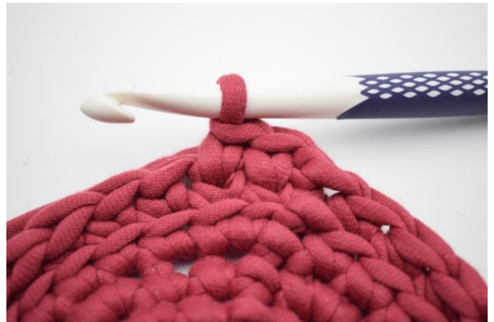
12. Like this.