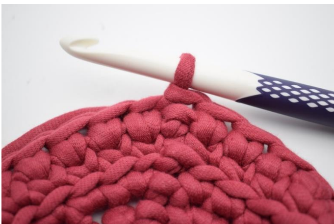
13. Repeat to the end of the rnd. End with a sl st.