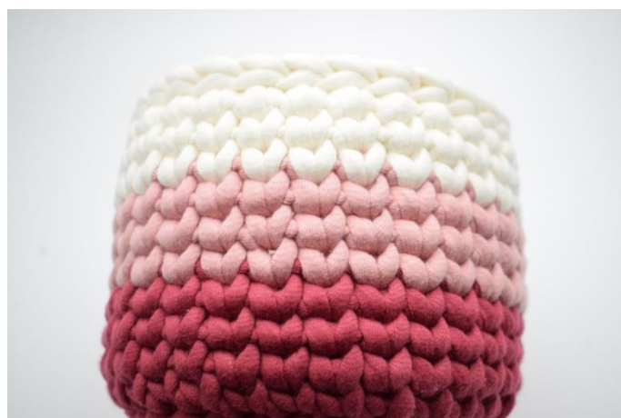
18. Repeat this rnd changing colors as described in the written pattern. End with 1 rnd of sl st. Cut the yarn and weave in the ends.