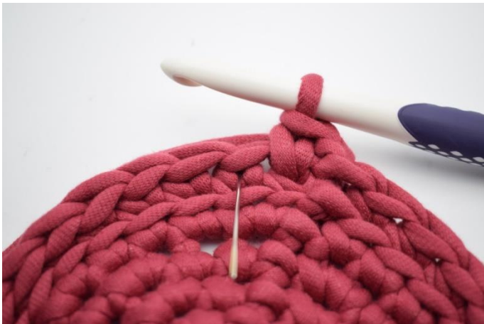
11. Work 1 ks in the next “v”. The needle indicates where to insert the hook.