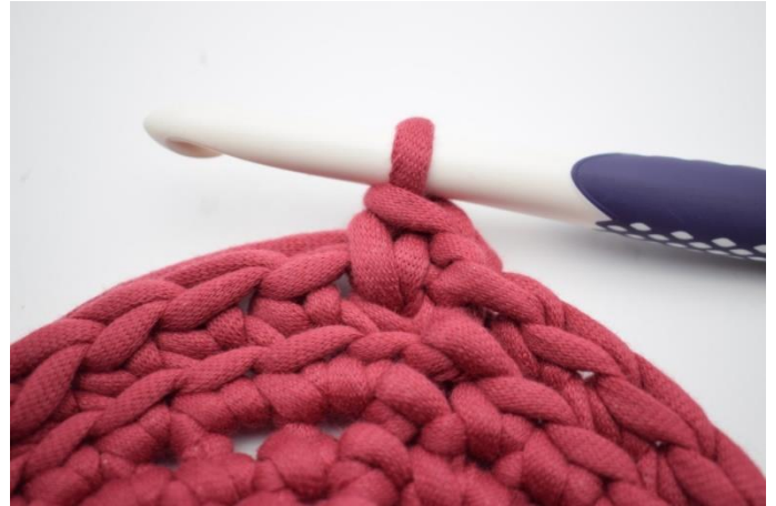
10. Like this. There is now 1 ks.