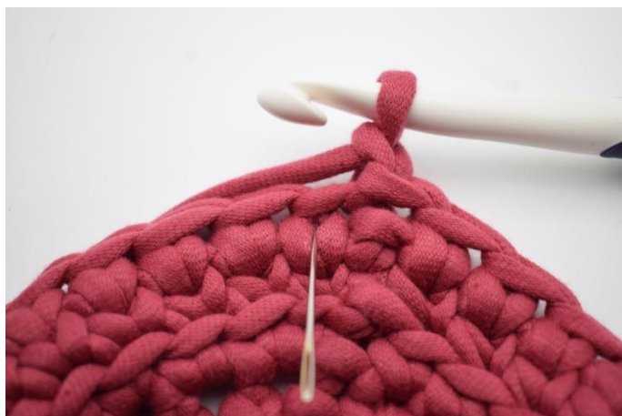
15. Work 1 ks in the first "v".