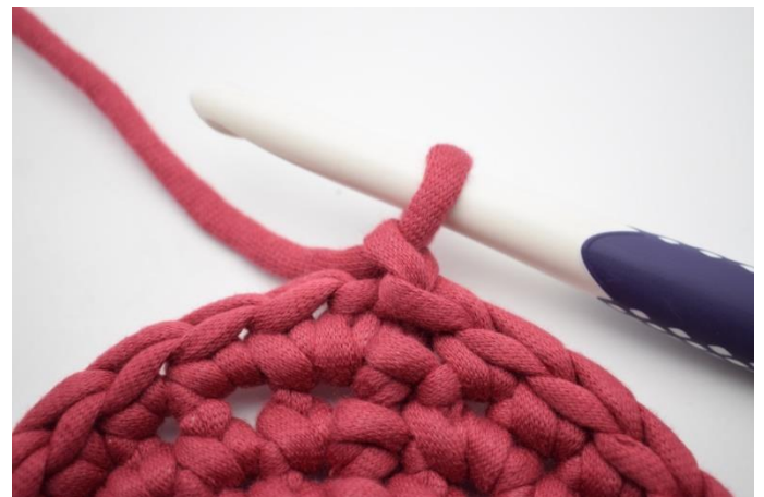
2. Ch 1.