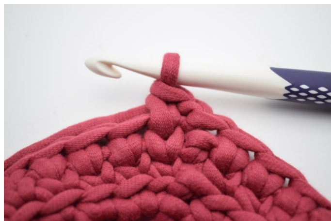
16. Like this.