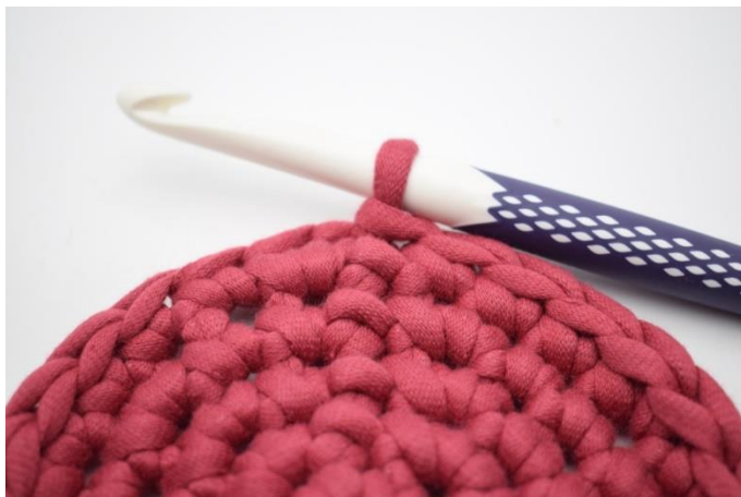
1. This is what the base should look like when completed.