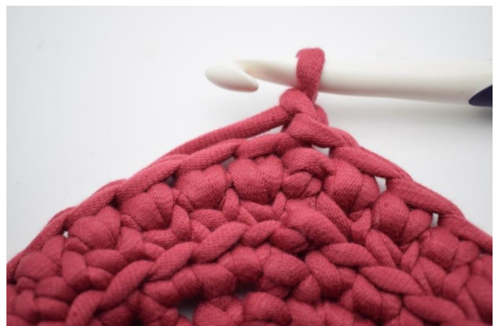
14. Repeat this row. Ch 1.