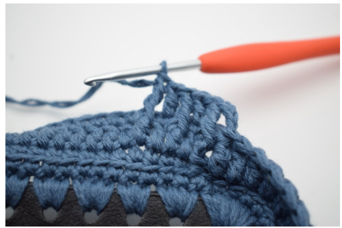
Work *1 dc in the next st, 1 fpdc around the next dc in the row below*