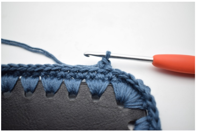
2. Like this. Now there is 1 sc in the BL.