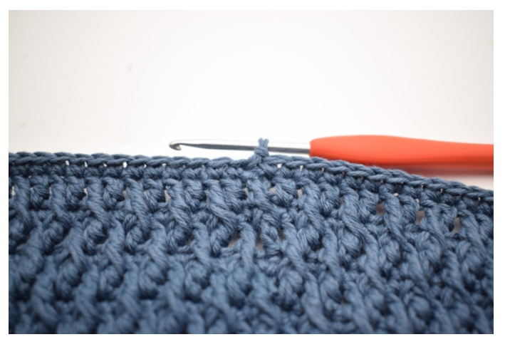
2. End with a sl st. (160)