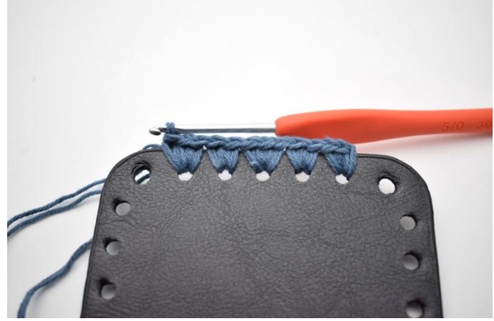
Work 3 sc in the first hole. Work *2 sc in the next hole. 3 sc in the following hole* Repeat * to * 2 times.

1. Begin by working in the holes around the leather base. Start in the 2<sup>nd</sup> hold from the corner on a short end.