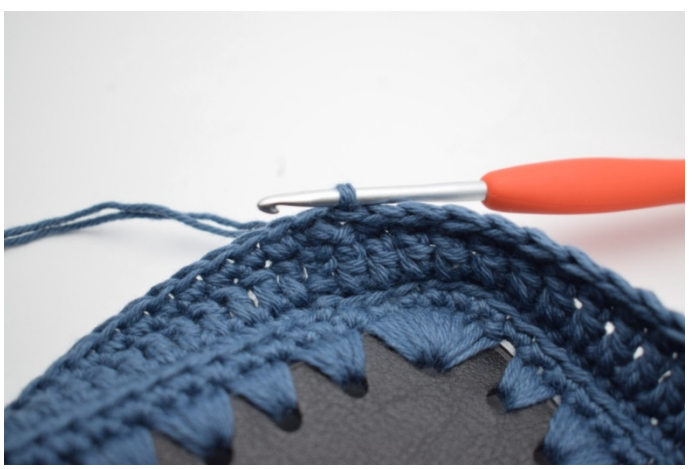
2. Like this.

1. Ch 1. Work sc in each st to the end of the rnd. End with a sl st. (160)