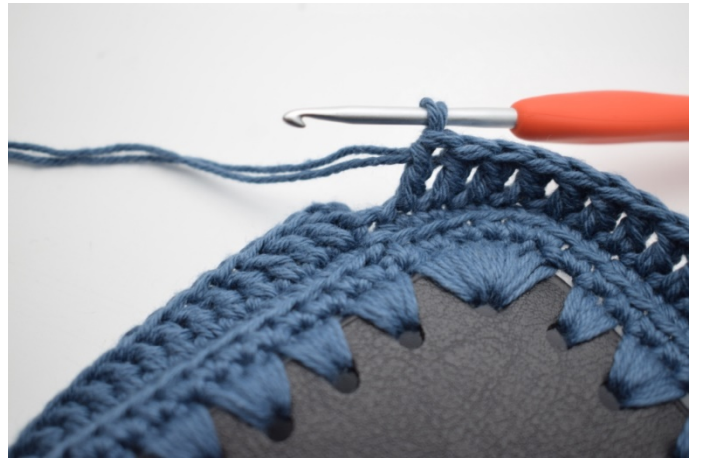
2. Work dc in each st to the end of the rnd.