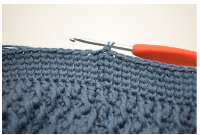
Repeat this rnd a total of 4 times. Cut the yarn and weave in the ends.