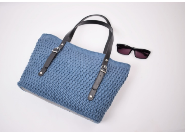
Sew the accessoires as described in the written pattern.