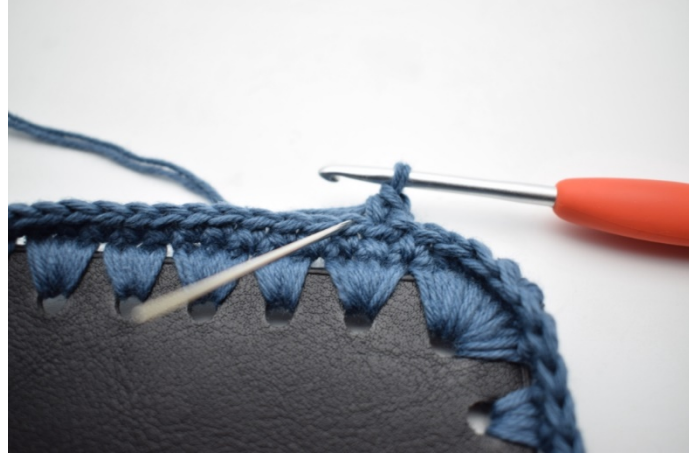
3. Work sc in the BL of the next st. The needle indicates where to insert the hook.