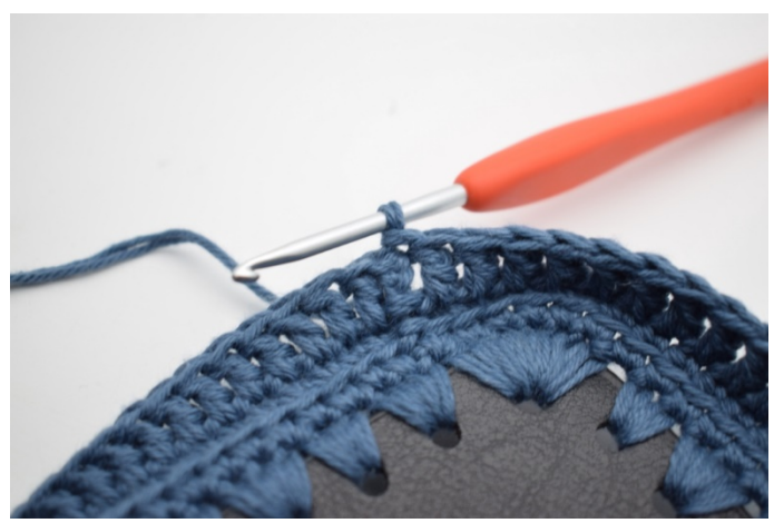
3. End with a sl st in the 3rd ch of the starting ch. (160)