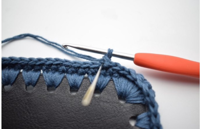
1. Ch 1. Work sc in the BL of each st to the end of the rnd. The needle indicates where to insert the hook.